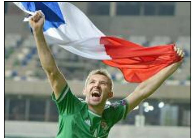
IN DREAMLAND: Northern Ireland's Gareth McAuley celebrates an historic night at Windsor Park

The suspension of Kyle Lafferty, who had scored seven goals in this qualifying campaign, handed Magennis his chance to shine on the international stage and he celebrated his goal at Windsor Park by running into the arms of manager Michael O'Neill on the touchline.