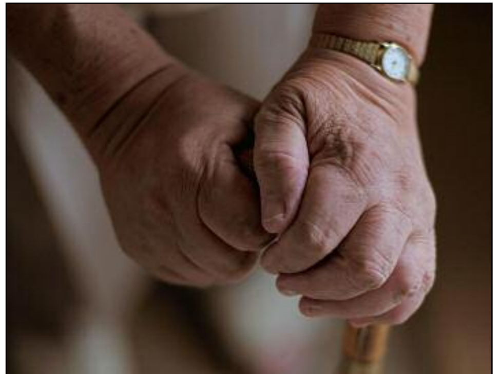
COLD COMFORT? There's nowhere better than the UK for palliative care