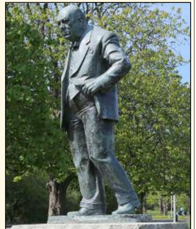
GREAT BRIT: Winnie in Woodford Green

Police are investigating after shocked passers-by spotted the "outrageous" paint job on Wednesday on the 8ft-high statue in Woodford Green in