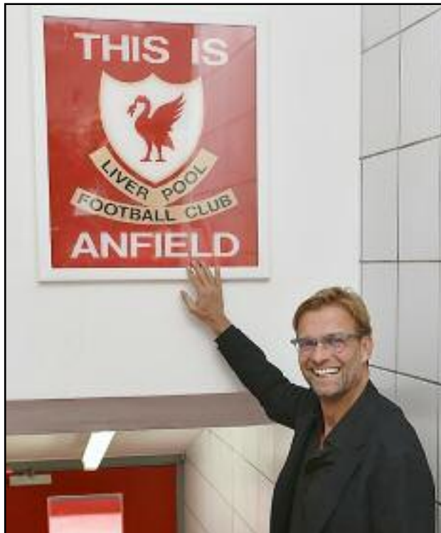
PROVEN TALENT: Klopp won two titles at Dortmund

Klopp, who will be joined at Anfield by his former Borussia Dortmund assistants