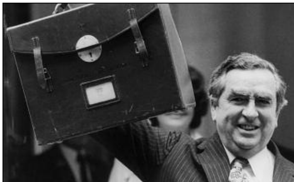
"Denis Healey (above) was a Labour giant whose record of service to party and country stands as his testament." - Jeremy Corbyn

"He distinguished himself with his military service during the Second World War and continued that commitment to the