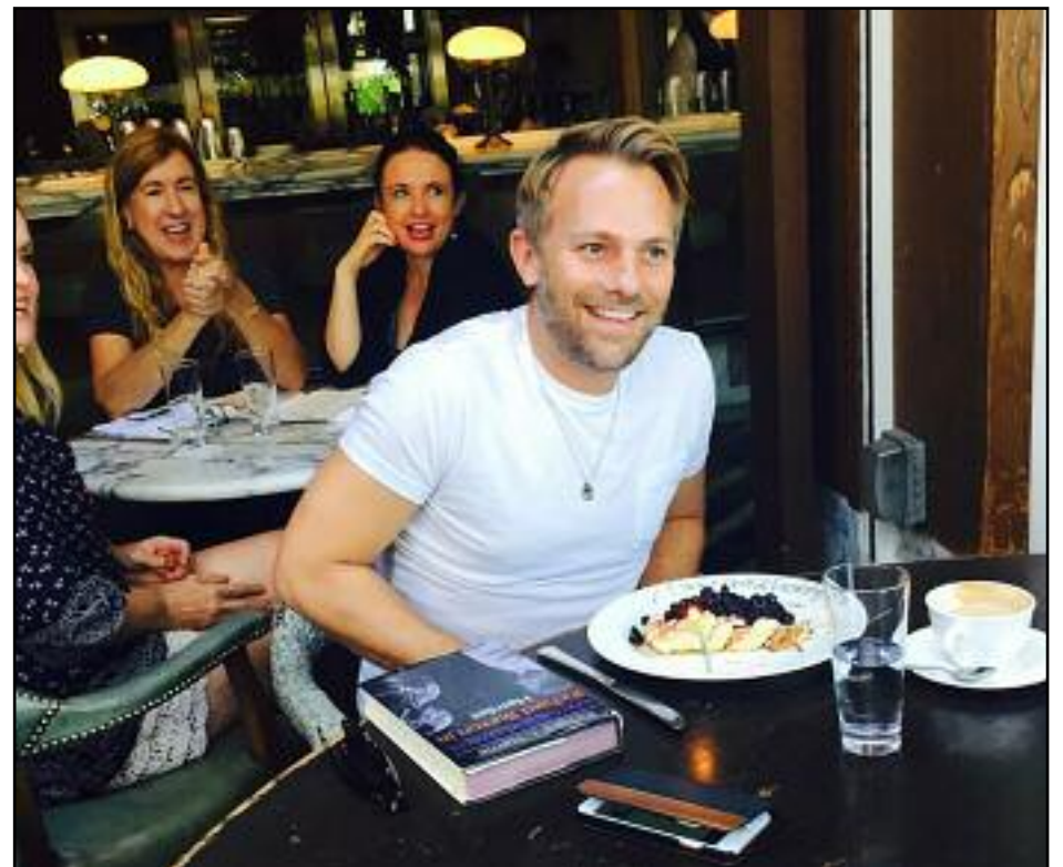
BIRTHDAY BOY: Craig celebrates at Cecconi's this week

These are all things that when living in London I didn't think were possible...or even necessary - but as soon as the Californian sun shone in my eyes I turned into the Catherine Tate character, Helen Marsh and said 'I can do that!' Most people back home often ask 'why?', whereas people here reply 'tell me more'. I think the key to this city is to take great pleasure in what you do - I saw a prime example of that when at a restaurant last week - a joyous group were sitting at a table close by and obviously celebrating something special. We got into conversation and I asked one of them what the special occasion was, and one of the group proudly explained they had made a film which had just opened and was received quite well. Which turned out to be a very modest understatement, as the headline in variety.com read 'The Martian Rockets to $18 Million Opening Day' - in case you haven't guessed, I was chatting to the legendary Sir Ridley