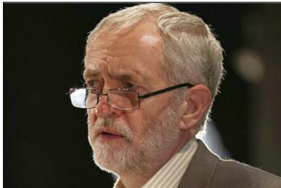
"This is not so much about snubs, insults or ceremonies: it's more about whether Jeremy Corbyn wants to be a serious political figure or just a perpetual rebel" - Conservative MP Sir Alan Duncan on the Labour leader (above)

Mr Corbyn was invited by David Cameron to join the Privy Council when he phoned him to congratulate him on becoming Leader of Her Majesty's Most Loyal Opposition, to use his full title, after he was chosen by the Labour Party on September 12.