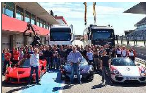
GETTING THE BANNED BACK TOGETHER? Messrs May, Clarkson and Hammond on location this week

The 55-year-old outspoken broadcaster had previously insisted "much is already sorted" for the show - after May suggested the stars had