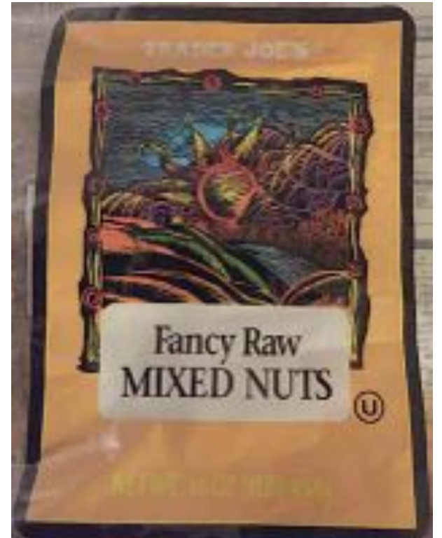
NOTHING FANCY: Unless you are Trader Joe...

One word(s) that I cannot find an American translation for is 'washing-up bowl'. Where I'm from to 'wash up' means to do the dishes but over here it means to give yourself a wash! Hence the difficulty I've had locating a new bowl - I've searched for sink bowl, dish bowl, kitchen bowl but had little success. I even texted a friend for the name and she replied "Tupperware? I have no clue" - I did learn along my unfruitful search (via The Guardian) that a washing-up bowl is like Marmite - you either love it or you hate it. I