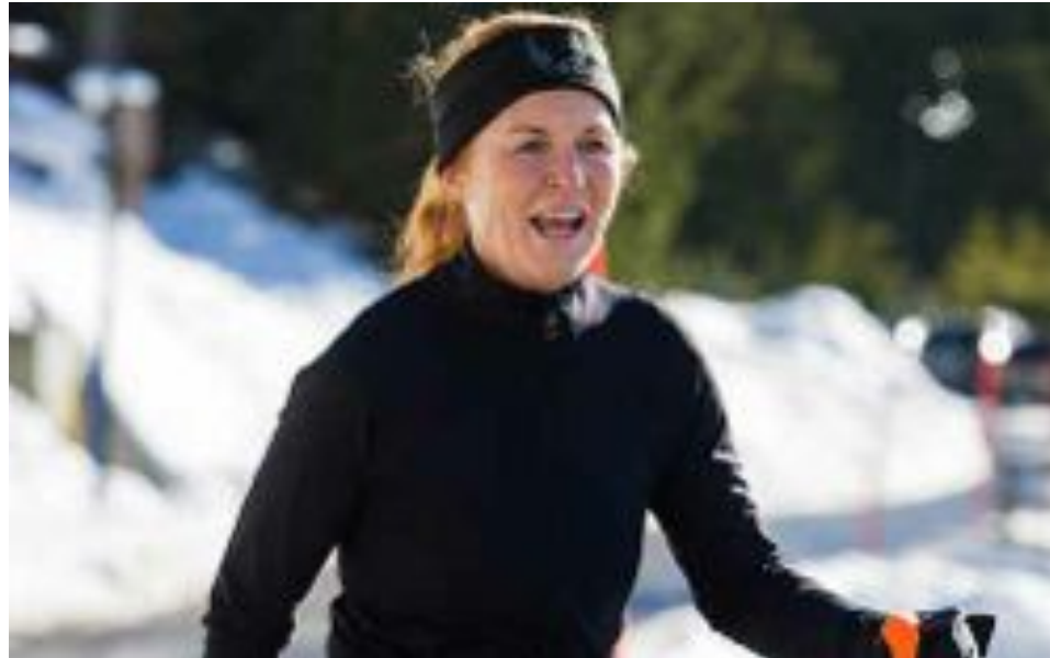
Prince Andrew’s ex-wife says she feels a ‘positive energy’ in the Alpine town

The spokesman added that the duchess will continue to use a room at Royal Lodge, the duke’s home in Windsor, for “family occasions”.