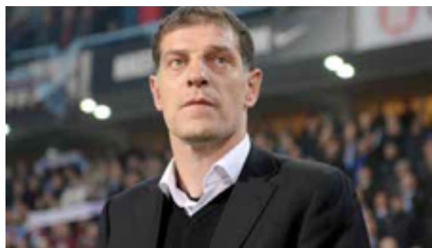
BUOYANT BILIC: West Ham are into the fifth round

year he would rather win the cup than finish in the top four of the Premier League and qualify for the Champions League, saying "the proof is silverware".