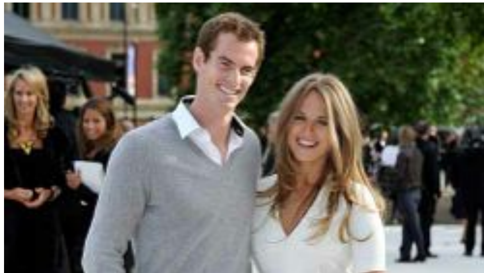
ANDY AND KIM: “It’s a big change for me and my wife, but that’s the current priority and I’ll see after that,” said the tennis star of his new baby girl

“All I could think of after Andy had finished playing his final [in the