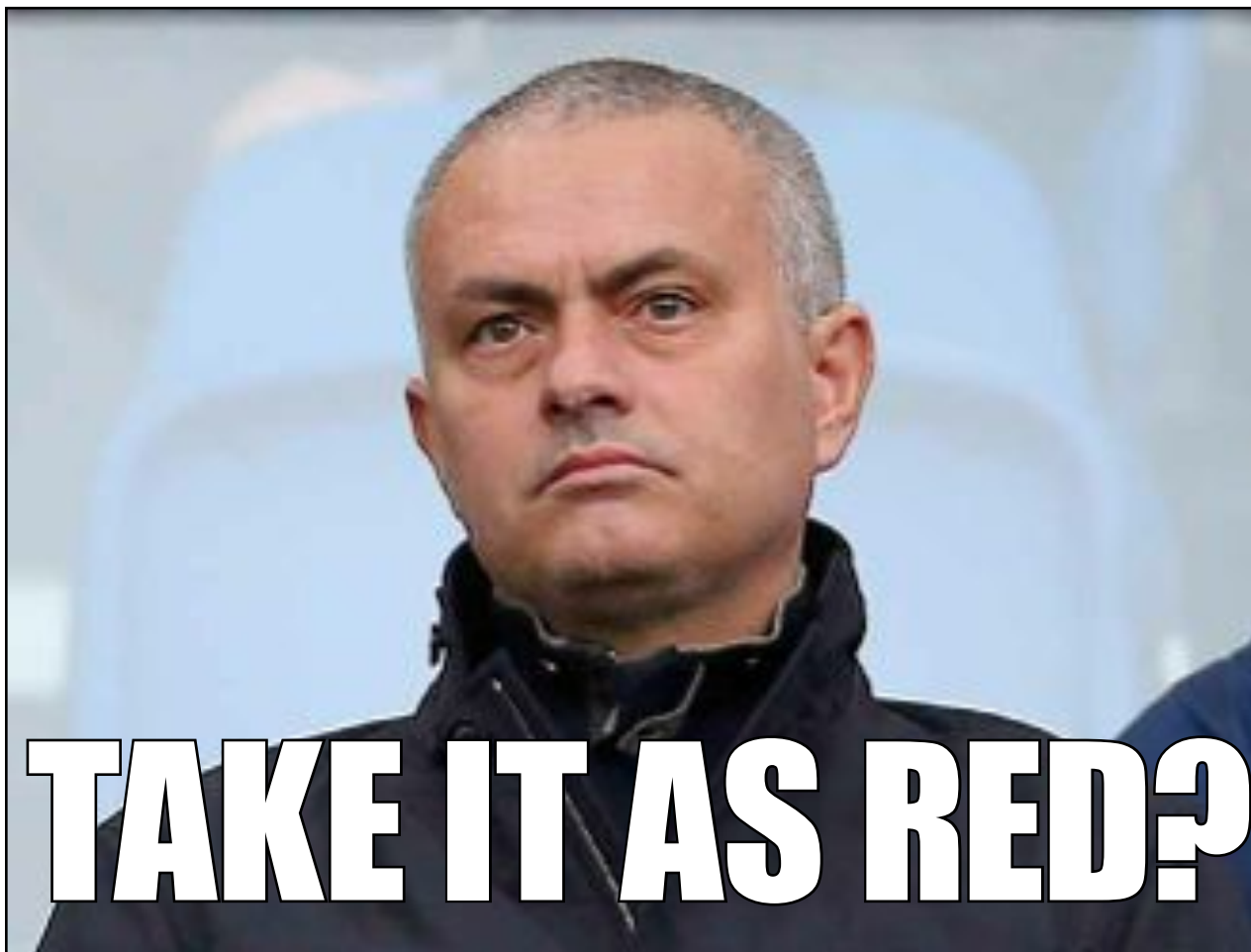
ON HIS WAY: Mourinho is tipped to replace Louis van Gaal as United boss at the end of the season

Van Gaal, whose side currently sits fifth in the