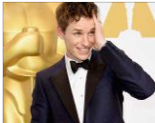
REDMAYNE: nominated again for The Danish Girl

He joined his fellow nominees - including his co-star Alicia Vikander, who is nominated for the "Best Supporting Actress" for playing Elbe's wife Gerda in "The Danish Girl" - for the annual Oscar luncheon and "class photo" at the