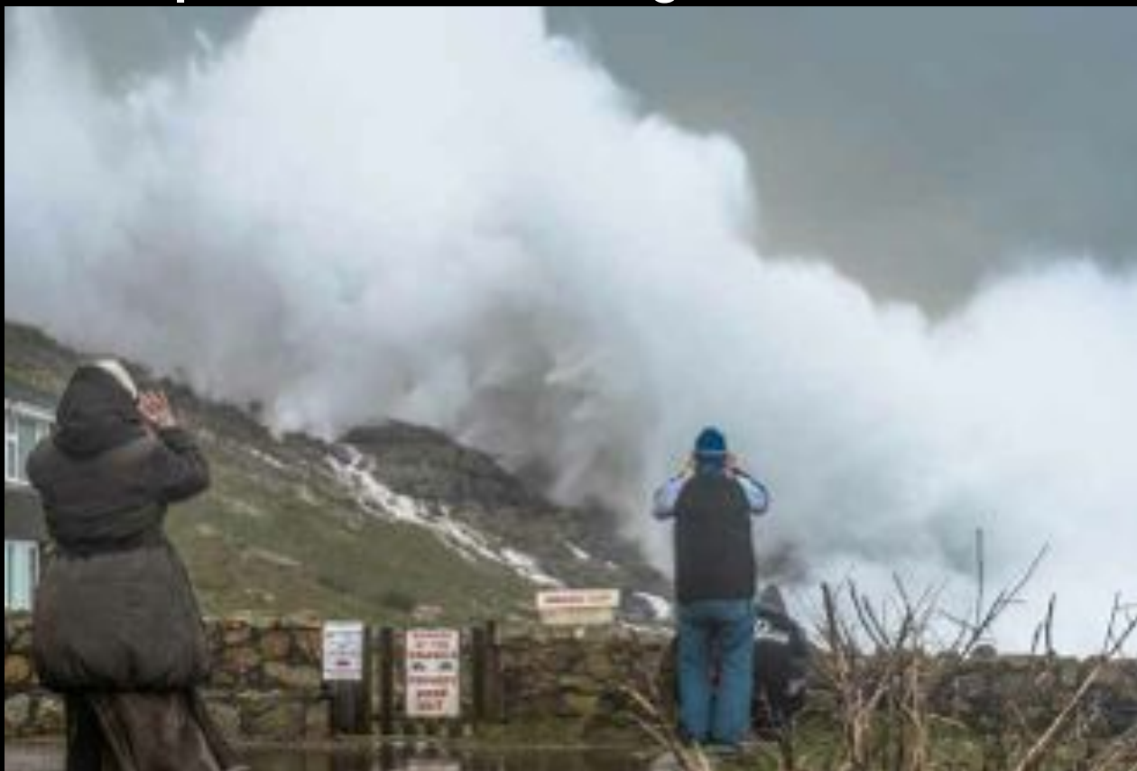
SURF'S UP: huge waves crash over the headland at Sennen Cove, near Land's End in Cornwall this week as Britain was battered by Storm Imogen, which packed winds approaching 100mph and left thousands without power and disrupted transport links. The misery was set to continue into the weekend as the country braced for a snowy Valentine's Day, with a blast of frigid air from the Arctic expected to send temperatures plummeting to -10c in some areas in the north of England and throughout Scotland.