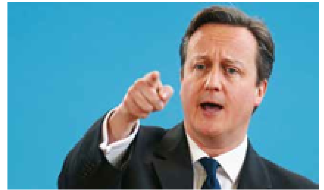
POINTING FINGERS: Having happily played the "Brussels-bashing game when it suited them", Tory leaders are now alarmed by the ramifications of Brexit," chortled The Guardian this week

Meanwhile Tory backbenchers have accused the PM of "scaremongering" after No. 10 warned that the "Jungle" migrant camp in Calais would relocate to England if the UK voted to leave the EU. Critics said that was nonsense, insisting that the bilateral deal with France that allows border guards to operate in Calais had nothing to do with the