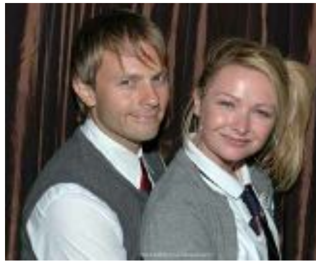
FANCY DRESS TO US: English schoolboy and schoolgirl to everyone else...

I actually won a 'Fancy Hat' competition at the tender age of three. But I was a bit disappointed when at Trader Joe's I bought some very plain,