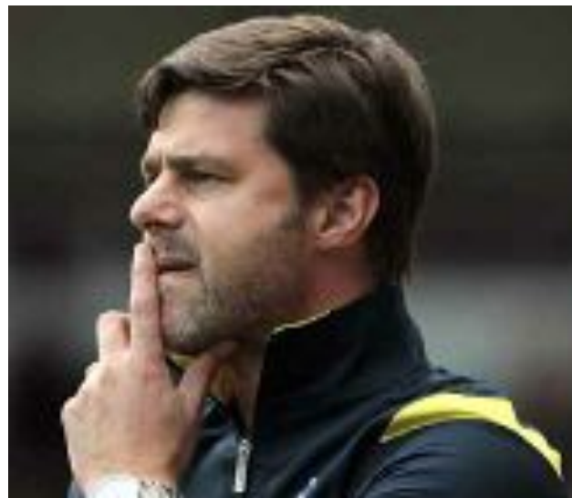
The best manager in the league? Fergie thinks so

Spurs' 1-0 home win over Watford at the weekend moved them up to second, five points behind surprise leaders Leicester City, who beat