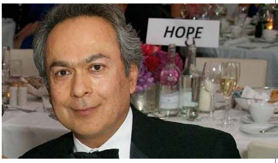
NEW MAN AT GOODISON: Farhad Moshiri has £1.3bn fortune