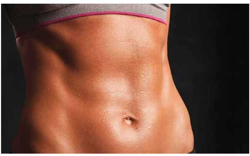
FLAT-OUT TRUE: maintaining energy balance is key to a flat stomach

The small daily treat method works for my sister and makes her happy. However this may not be the ideal method for everyone. My sister knows herself well, understanding that it's not in her nature for a few bites to trigger an urge for more. But for too many people it's difficult to stop at the predetermined (small)