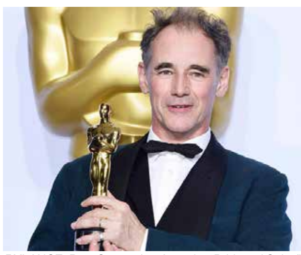
RYLANCE: Best Supporting Actor for "Bridge of Spies"