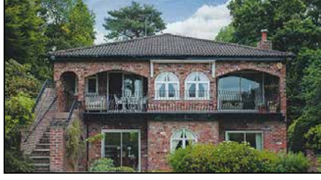
Taken: The Halls' £1.2million Cheshire mansion

Hall will be on the Sex Offenders' Register for life. After initially insisting he was innocent, he later pleaded guilty