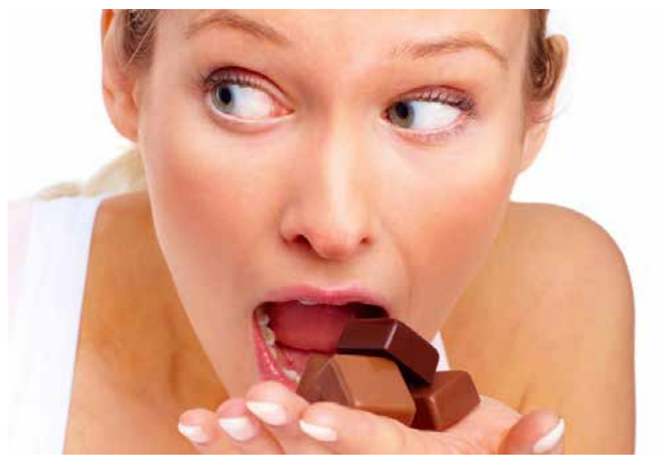
THREE SQUARES A DAY? not so bad. But keep treat foods out of sight...

calories every day method of treating can certainly work, and for that reason it's gotten more popular, but it's not my top recommendation and you should understand the pros and cons before you consider it