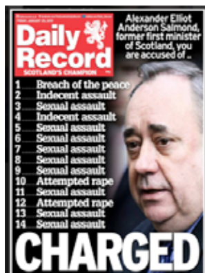
PULLING NO PUNCHES: Friday's Daily Record

during the investigation. He won that case two weeks ago, with a judge at the Court of Session in Edinburgh ruling that the government's investigation against him had been "procedurally unfair" and "tainted by apparent bias". The case was focused on the government's internal processes, not the substance of the complaints.