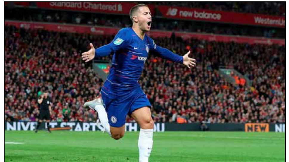
KEY MAN: Eden Hazard scored Chelsea's second goal Thursday night

It was apt that Hazard should score such a vital