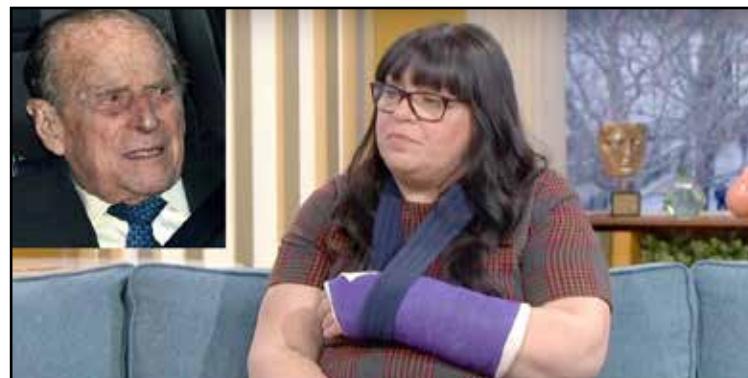
Crash victim blasts 'insensitive' Philip - page 4