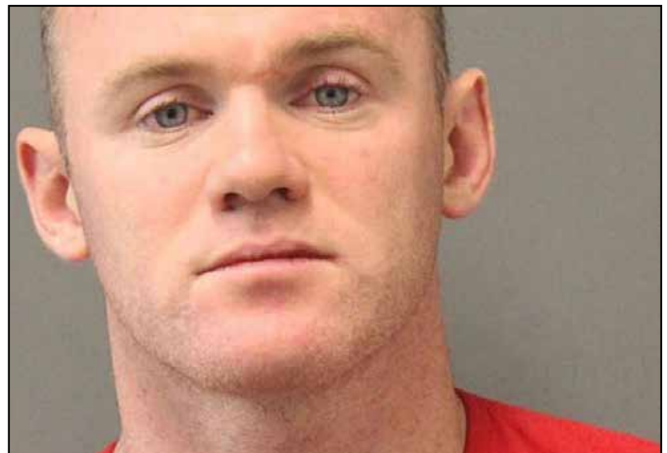
REPEAT OFFENDER: A Stockport court banned Rooney for two years in 2017

Rooney, who now plays for US Major League Soccer club DC United, was later released and fined $25 (£19) with $91 (£70) costs. His spokesman said at the time that he was "disorientated" after taking sleeping tablets and drinking on