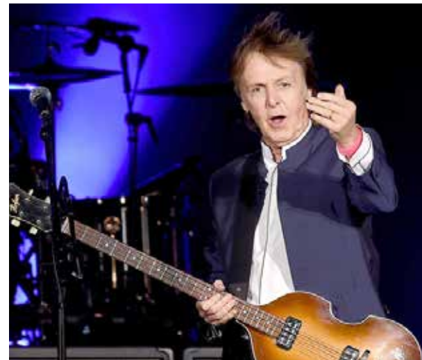
REGRETTING IT:: Macca with the dye job

After a momentous 2018 which saw Sir Paul release his 17th solo album Egypt Station and embark on an international tour which included a homecoming gig in Liverpool last month - this year promises to be just as busy with an upcoming tour of South and North America and the release of his first children's book Hey Granddude! The picture book about a magical old man and his four grandchildren, was inspired by his family. Explaining the