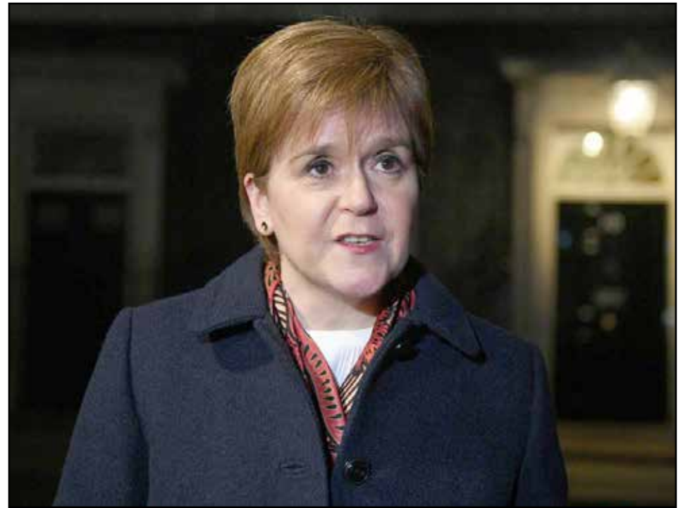
NOT OPTIMISTIC: the First Minister outside 10 Downing Street on Thursday