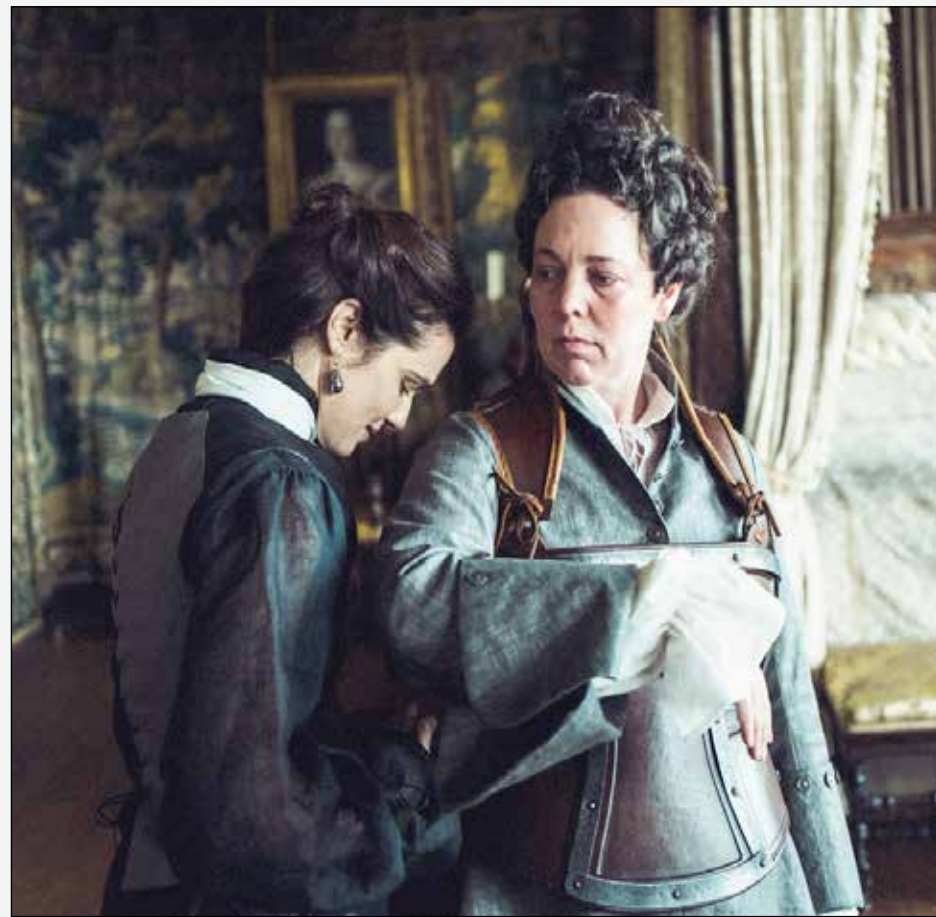
DOUBLE ACT: Rachael Weisz and Olivia Colman star in The Favourite

The 91st Academy Awards will take place at the Dolby Theatre in Los Angeles on February 24th.