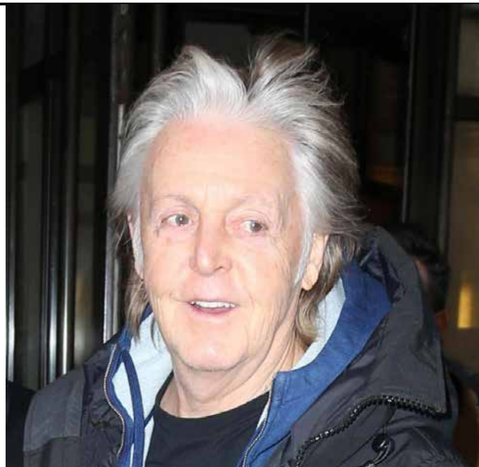
OWNING IT: Macca let his grey locks flow in New York this week

Sir Paul's not the only celebrity to let Mother Nature take her course.