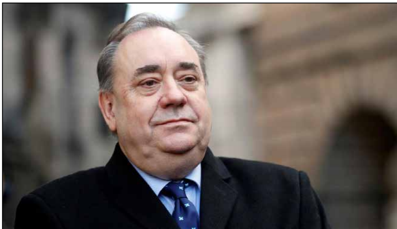
ALEX SALMOND: "I have got great faith in the court system of Scotland."

Mr Salmond was accused of two charges of attempted rape, nine of sexual assault, two of indecent assault and one breach of the peace.