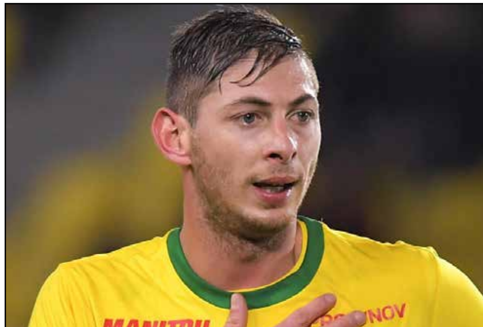
TRAGIC STORY: Emiliano Sala is feared dead after the Piper Malibu (below) in which he was flying to Cardiff disappeared over the Channel on Monday

Sala grew up in Progreso, a town with only 3,000 inhabitants in Santa Fe province.