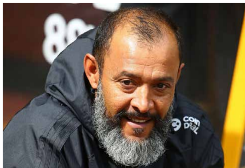
Nuno Espirito Santo: "in that moment it is difficult to contain your emotions."