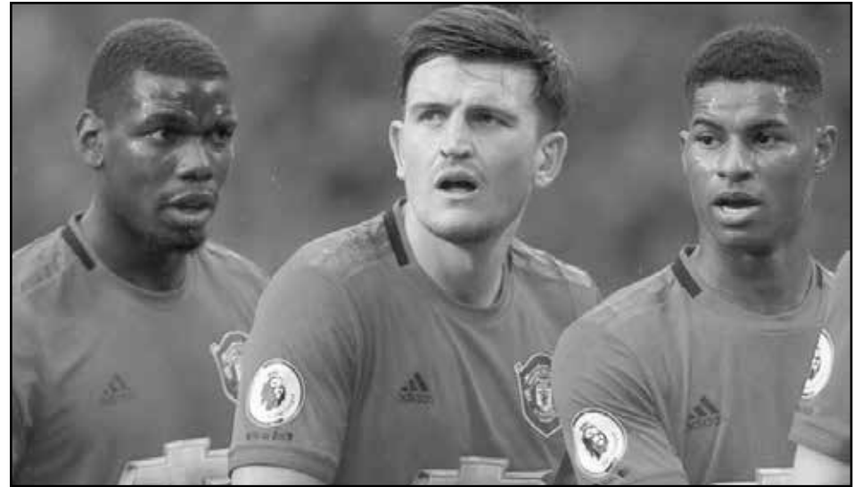
Pogba was supported online by teammates Harry Maguire and Marcus Rashford

In July, football's anti-discrimination charity Kick It Out published a report that stated incidents of racist abuse increased by 43% last