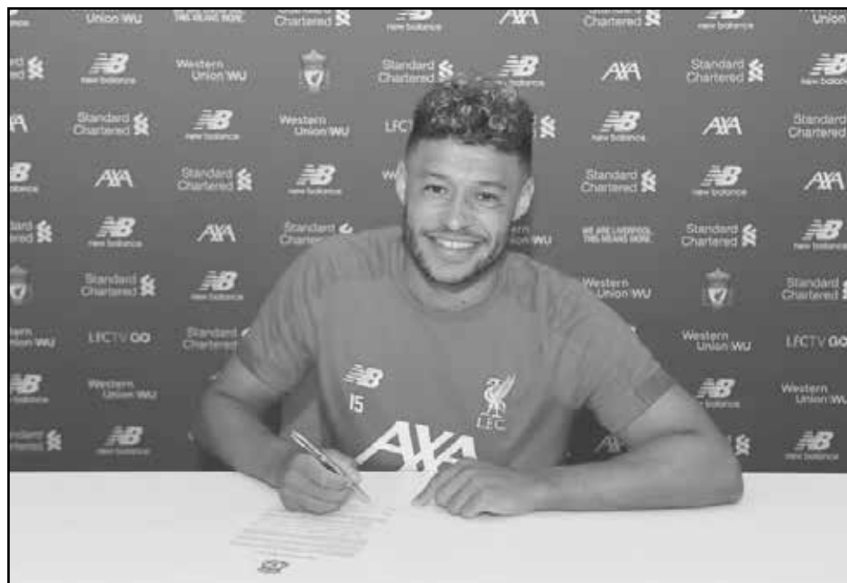
ALL SMILES: Oxlade-Chamberlain signed a new deal at Liverpool this week

Oxlade-Chamberlain made his first Premier League start since April 2018 against Southampton on Saturday, playing 89 minutes. He also started the Super Cup win against Chelsea on 14 August.