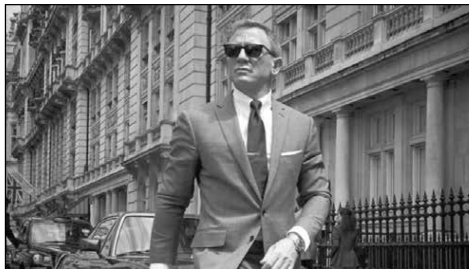
ONE LAST HURRAH? Daniel Craig plays Bond for the fifth time

Up until Monday night the film, which has been partly shot on location in the Caribbean, had only been referred to as Bond 25 . Shatterhand was widely mocked as the film's working title but No Time To Die appears to have found favour with The James Bond International Fan Club. A spokesman said: "Not culled from any Fleming