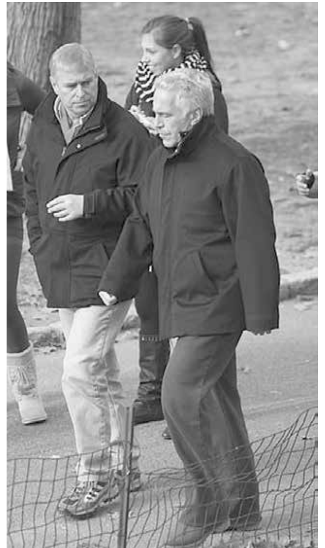
AWKWARD: Prince Andrew pictured with Jeffrey Epstein in New York in 2012, four years after the American financier's initial conviction for sex crimes

He has previously denied claims by one young woman, Virginia Roberts, now Giuffre, that she had sex with him "three times, including one orgy" when she was 17, under the age of consent in the state of Florida. But he has never explained how he came to be pictured with