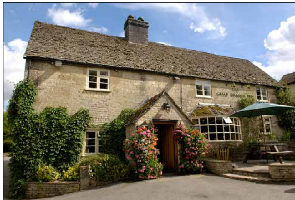
THE GREEN DRAGON INN: ticking all the boxes for an English country pub