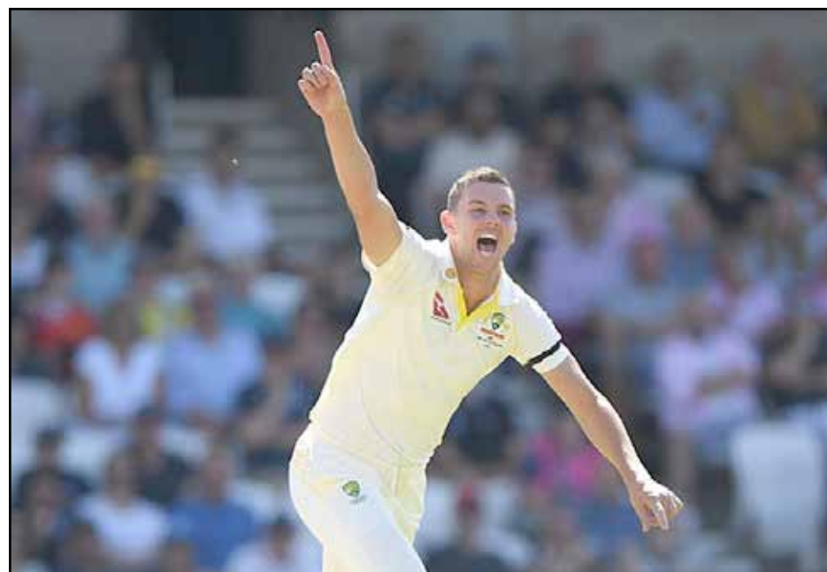
DANGER MAN: Josh Hazlewood took 5-30 for the Aussies on Friday

Stokes and Stuart Broad did remove Matthew Wade and Tim Paine respectively in consecutive overs late