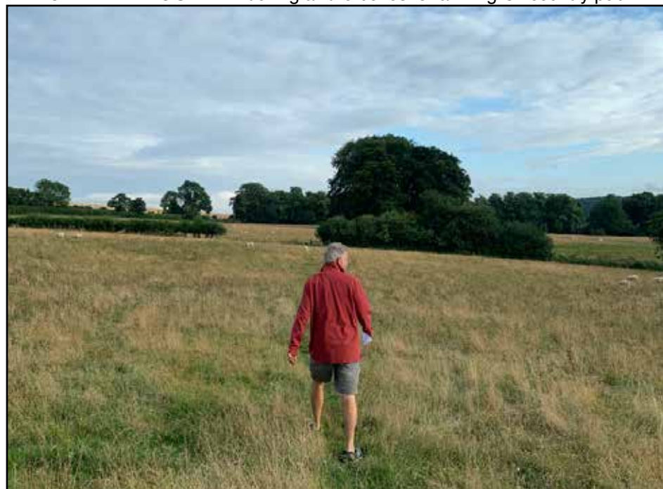
GONE YOMPING: the author on the Cotswold Way in search of a pint...

with my family - it seemed like a moment to savor.