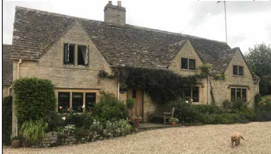
CLOSE COTTAGE, COBERLEY: where Phoebe the cockapoo will welcome you

So mission accomplished. England isn't so bad, after all. And if you're thinking of visiting the region, Close Cottage is a very good place to start.