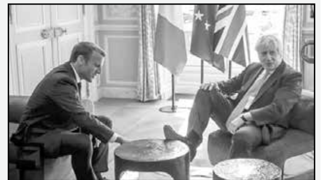
PUTTING HIS FOOT ON IT: Macron and Johnson enjoy a light-hearted moment this week

"They clearly don't teach good manners at Eton," wrote another, using the hashtag #yob.