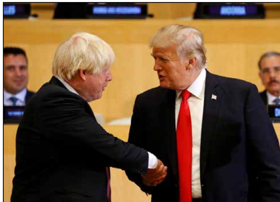
JOHNSON NOT FOR SHRINKING? The Prime Minister insists Britain will "not retreat" from the international stage after leaving the European Union.

Britain is planning to push ahead with a "digital services tax" for internet giants despite