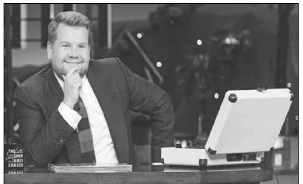
IN THE MONEY: Corden's new deal makes him one of the most successful Brits in American TV history.

and Stacey & Stacey star was previously on £3million a year to present the 12.30am slot until next March. London-born Corden hit the US airwaves in 2015, just as late-night TV saw a big overhaul. But two months ago, while speaking to Chris Evans in London, he hinted he might bring his family back to "this glorious island" for personal reasons. CBS said: "James and his shows are a great source of pride to us and it's exciting to extend our relationship well into the future."