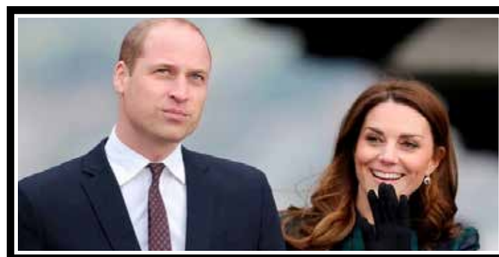
Royal couple fly coach to visit grandma - page 3

California's British Accent™ - Since 1984