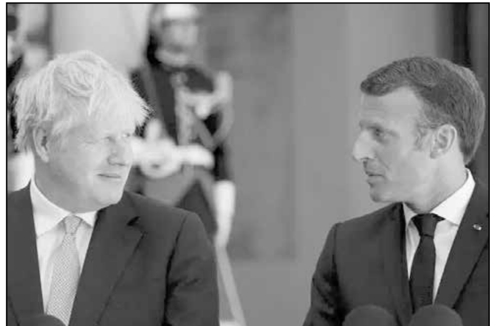
FRENCH WITHOUT TEARS: Johnson's meeting with Macron was described as 'cordial' but without any concessions from either side

that the withdrawal agreement does not need to be reopened if a practical solution to the backstop crisis can be