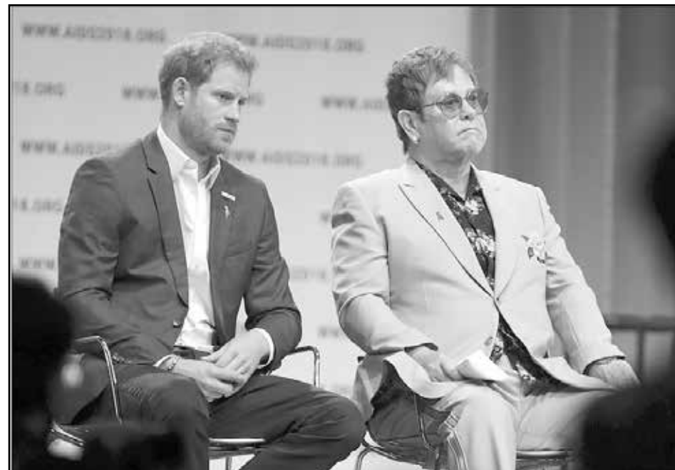
The Duke of Sussex with Sir Elton John aduring the Aids 2018 summit in Amsterdam. Sir Elton said he provided the royal couple with a private jet flight to his home in Nice to give them a ‘high level of much-needed protection’

“To maintain a high level of much-needed