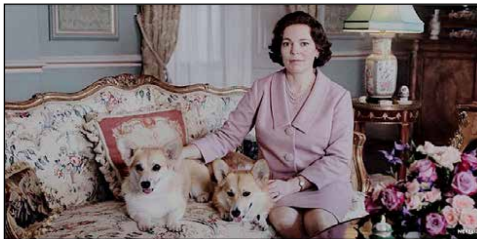
THE NEW BOSS: Season Three of The Crown on Netflix, starring Olivia Colman as Queen Elizabeth, covers the time period between 1964 and 1977

"Through doing this I have to say I've fallen in love with the Monarchy a bit. It's not a job I'd want but I think the Queen certainly is a solid rock for us all. If you're