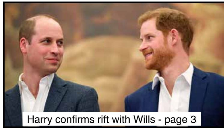
Harry confirms rift with Wills - page 3

California's British Accent™ - Since 1984