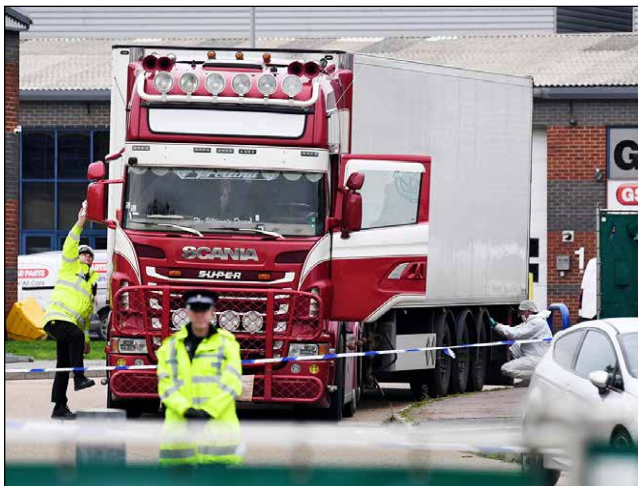
COLD WELCOME: the victims are believed to have frozen to death in the refrigerated truck

Essex Police said the tractor unit (the front part of the lorry) had entered the UK via Holyhead - an Irish Sea port in Wales - on Sunday 20 October, having travelled over