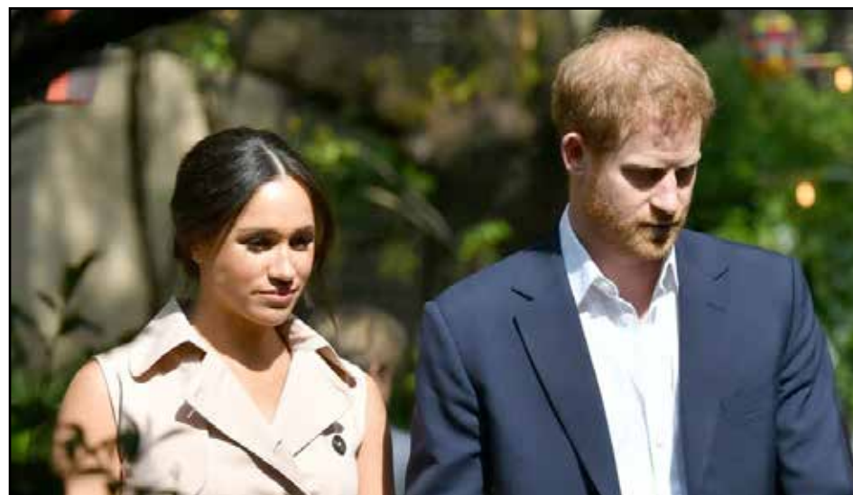
'Bruising year': the Duke and Duchess described their struggles since their marriage

the birth of son Archie, aged five months, he has wanted to live in Africa and use it as a base for work with young people in the Commonwealth. Aides, however, insist they only looked at the