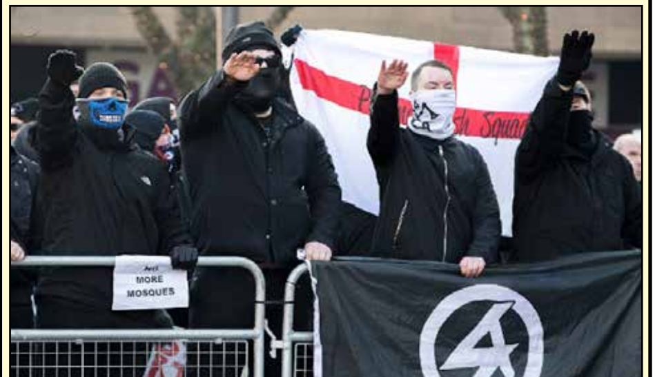
SIGN OF THE TIMES: far-right terror groups are the UK's fastest-growing threat

POLICE and MI5 have foiled 24 terror plots in the UK since April 2017, Britain's top police officer said this week.