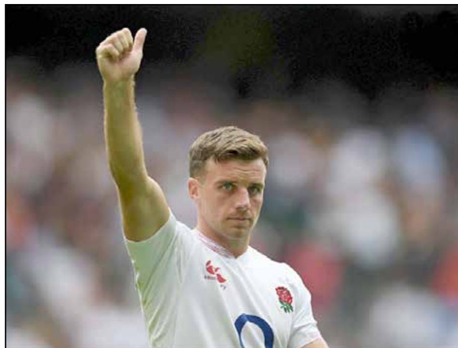
GEORGE FORD: the Leicester and England fly half is back for England's biggest game since they lost the 2007 World Cup Final to South Africa

Maro Itoje and Courtney Lawes stay together in the second row, with George Kruis among the replacements with back row Mark Wilson - in for Lewis Ludlam - and centre Jonathan Joseph.