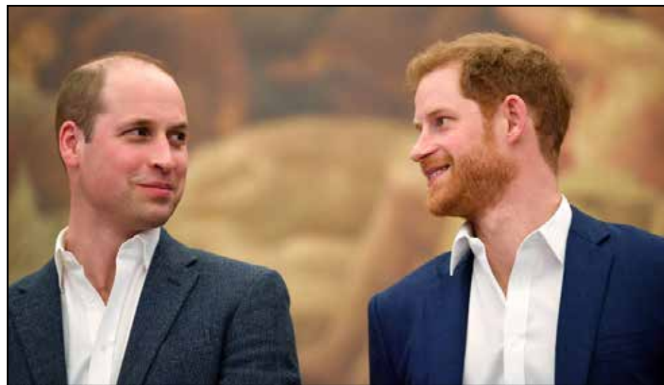
Harry on Wills: 'As brothers, you know, you have good days, you have bad days.'