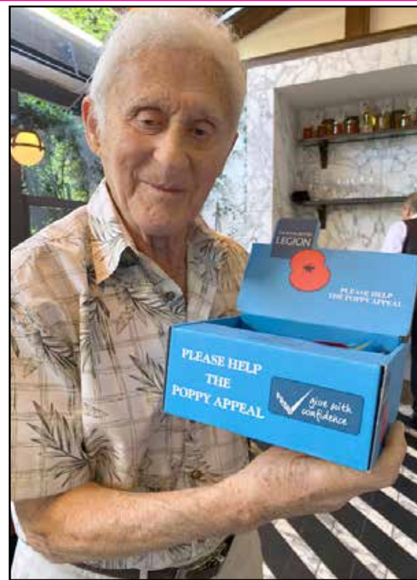
POPPY TALK: From now until November 5th you can buy your British Legion poppy at our Breakfast Club and Pub Quiz

Rent control will be applied mostly to apartments and smaller multi-family buildings, with some exceptions, along with some single-family homes. Condos and single-