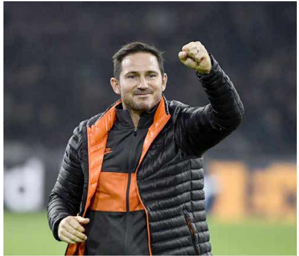
"I think we're allowed to be excited tonight." - Frank Lampard

Frank Lampard felt his Chelsea "babies" came of age as the Blues claimed a memorable 1-0 win at Ajax in the Champions League. Substitute Michy Batshuayi struck with four minutes remaining to hand Chelsea their second win in Group H. Lampard has shown his faith in young players this season and has now been rewarded with the biggest result of his Chelsea managerial career. "I'm delighted with every element of the performance," said the Blues boss. "I think we're allowed to be excited tonight. That's the blueprint. There are no excuses for us now. That's the standard and we can't drop it. "The young players are still babies in terms of Champions League minutes so this was a huge test for them. "There was a good balance of young players and experience. We need to realise the things that made that happen tonight because Ajax are a top, top team." It was a first loss in this season's Champions League for Ajax, who reached the semi-finals of the competition last year. They had a goal ruled out by the Video Assistant Referee when Quincy Promes was adjudged to have been offside, while Edson Alvarez hit the post with a header. However, the game changed when Lampard sent on Christian Pulisic and Batshuayi midway through the second half. USA winger Pulisic provided the assist for Batshuayi, who recovered from a bad miss earlier to score the winner. "The subs were second to none," added Lampard.