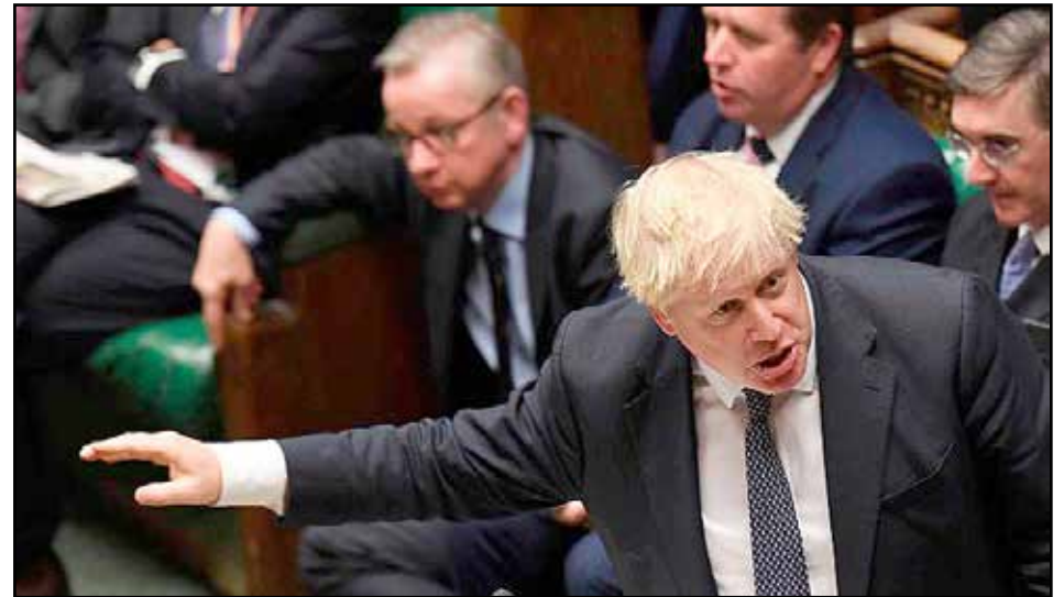
CHRISTMAS JEER? the Prime Minister is aiming for a December 12 election

One Labour MP said: "I don't think the party will go for this. It's a dead cat because he hasn't achieved his "do or die" or "dead in a ditch" promise on leaving by 31 October. You can't put off democracy because it's dark nights, but we do need to think very carefully in this climate about having to go out and campaign in the dark."