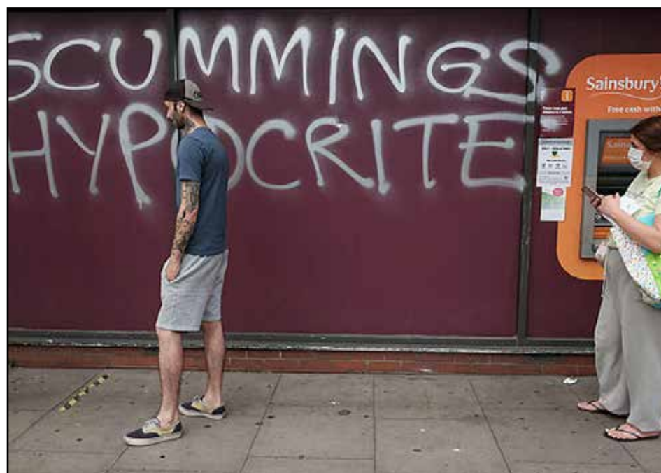
ANGER IN THE STREETS: Dominic Cummings divides opinion sharply in the UK

Downing Street will note that the momentum of the rebellion is picking up. One senior Tory MP expected twice as many Tory MPs to go public by the end of the week with calls for Mr Cummings to go. "We're getting