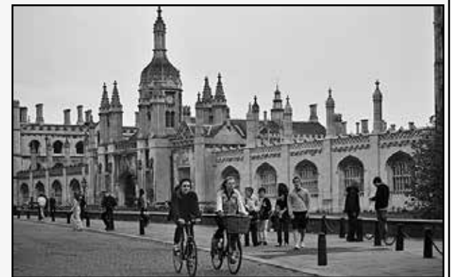
DREAMING SPIRES: Cambridge won't be the same

And the financial hit will be even greater if British universities are also shunned by foreign students, collectively worth £7bn in income. "Survey evidence suggests only 39% of Chinese students, the biggest group from overseas by far, are likely to come