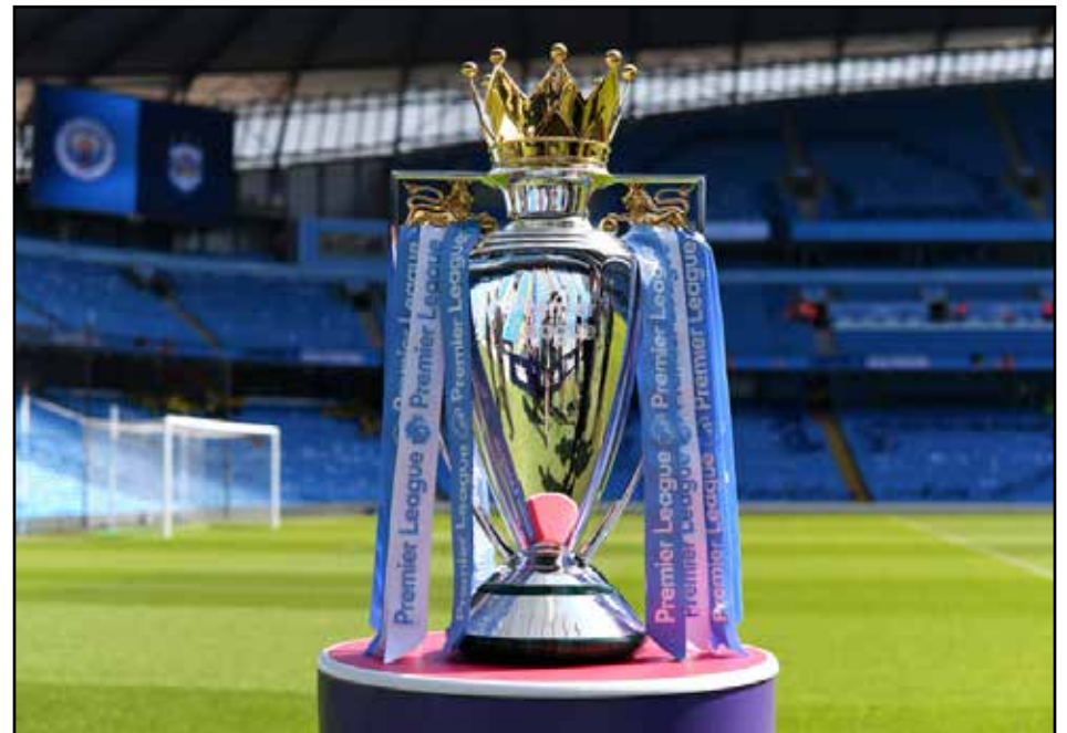
KICKING OFF AGAIN? The Premier league is slated to restart in June

Squads started non-contact training last week for the first time since the Premier League was suspended on 13 March because of the pandemic.