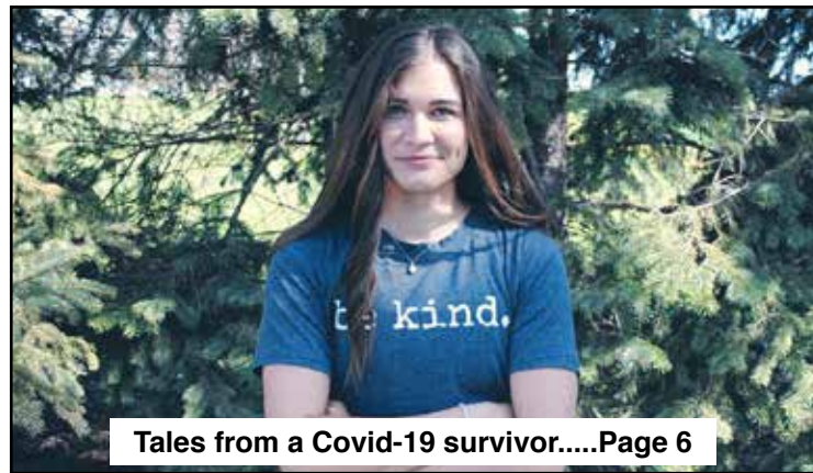
Tales from a Covid-19 survivor.....Page 6