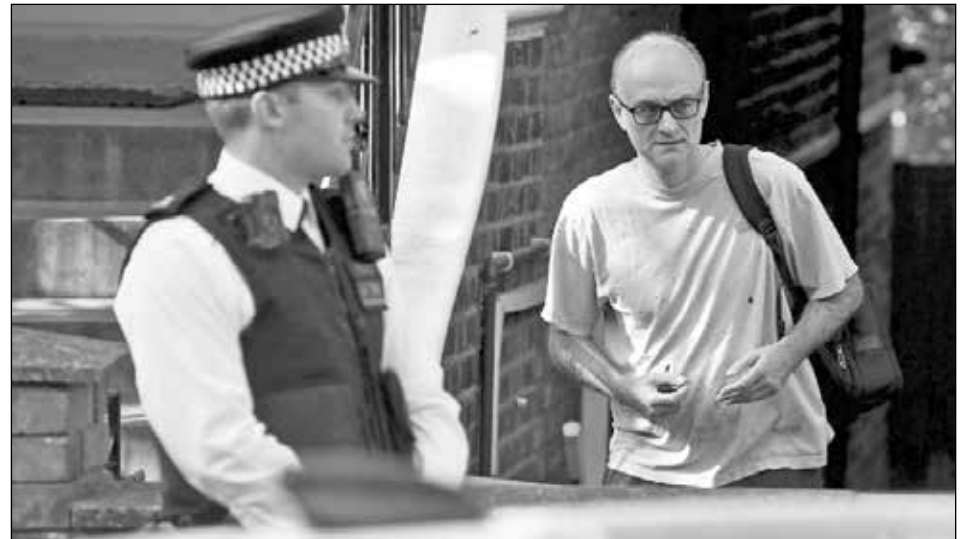
AM I BOVERED? Dominic Cummings remained unrepentant this week