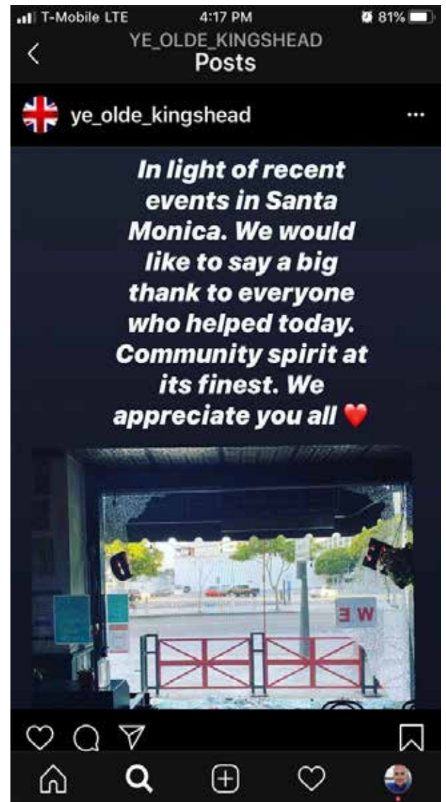
SCARCELY BELIEVABLE: The Ye Olde Kings Head' Instagram feed this week

but customers should call ahead to check the situation. The Kings Head Shoppe can be reached at 310/394-8765.