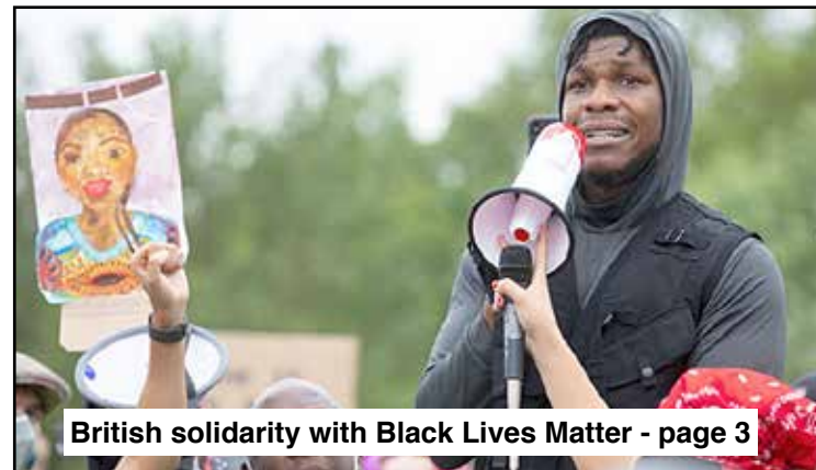
British solidarity with Black Lives Matter - page 3