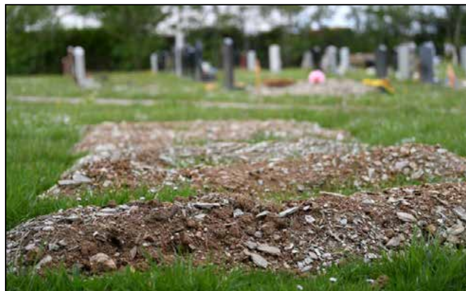
SIGN OF THE TIMES: pre-dug graves in a Somerset cemetery

An early plan to contain the virus with mass testing and tracing was ended on