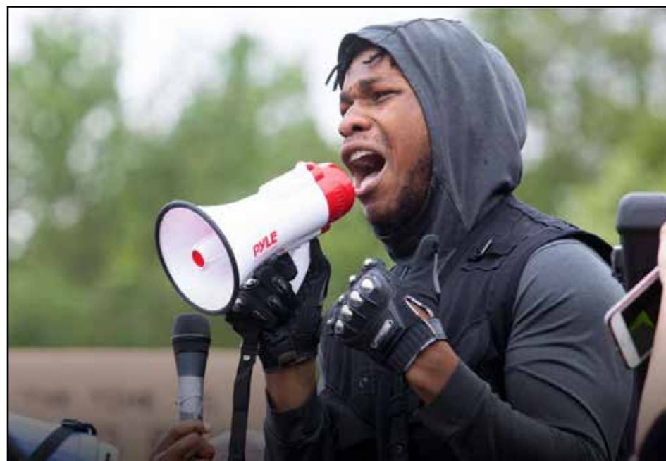
"We are a physical representation of our support for George Floyd." - Star Wars star John Boyega in Hyde Park this week

He said it was one of three new commitments by the region's political