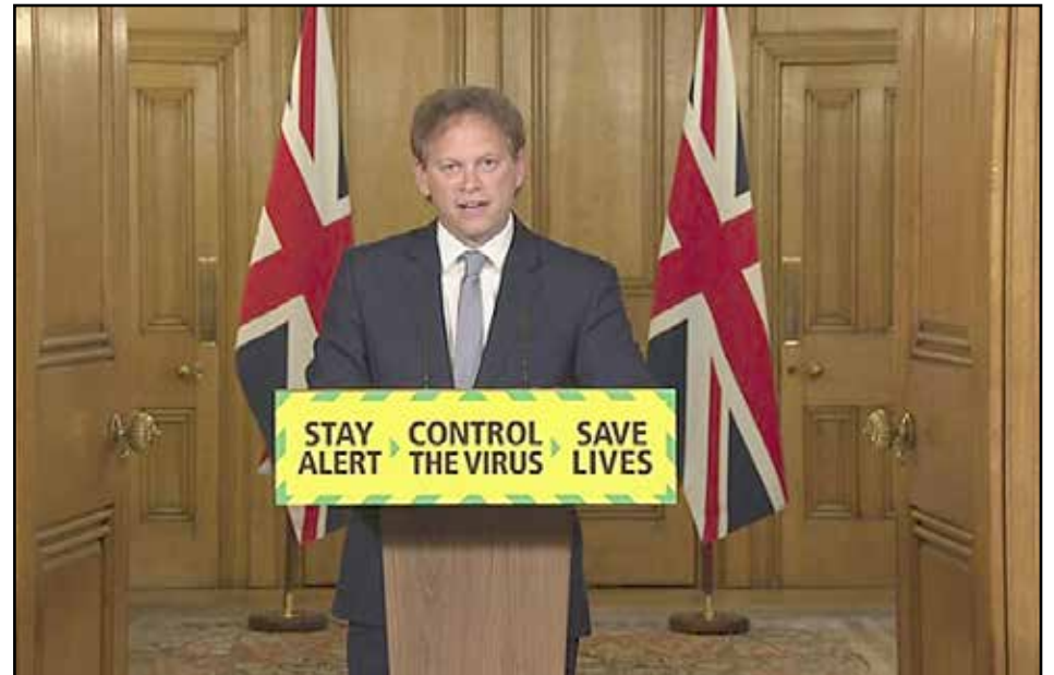
GRANT SHAPPS: "Why wouldn't people want to do the right thing?"

London Mayor Sadiq Khan said he was pleased "the government has finally seen sense" after he had lobbied for the change.