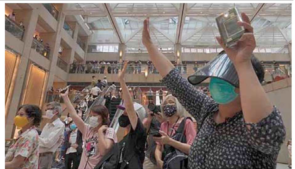
Hong Kong protesters demonstrate against China's new legislation for the city

Hong Kong's legislature - is needed to tackle "terrorism" and "separatism" in a restless city it now regards as a