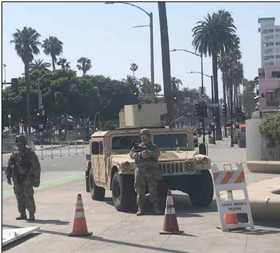
SIGN OF THE TIMES: National Guardsmen at Colorado and Ocean in Santa Monica on Thursday afternoon