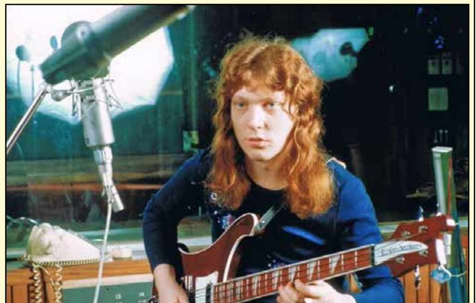
Steve Priest: founding member of the seminal 1970s British band

bass player I ever played with. The noise we made as a band was so powerful. From that moment in the summer of 1970 when set off on our Musical Odyssey the world opened up and the rollercoaster ride started! He eventually followed his heart and moved to the USA. First New York then LA. Rest in Peace brother. All my love."