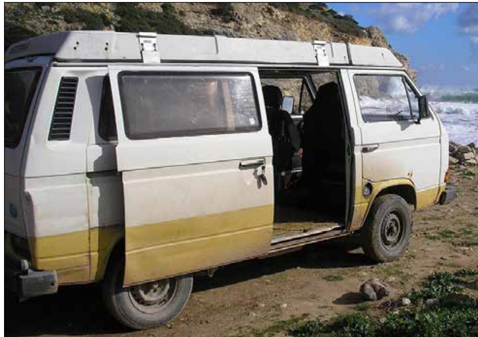
ON THE MOVE: the VW Camper van used by Brueckner in the Algarve

"Someone out there knows a lot more than they're letting on,"