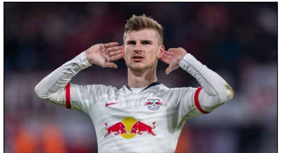
TIMO WERNER: Chelsea target

Werner scored a hat-trick in Leipzig's recent 5-0 victory over