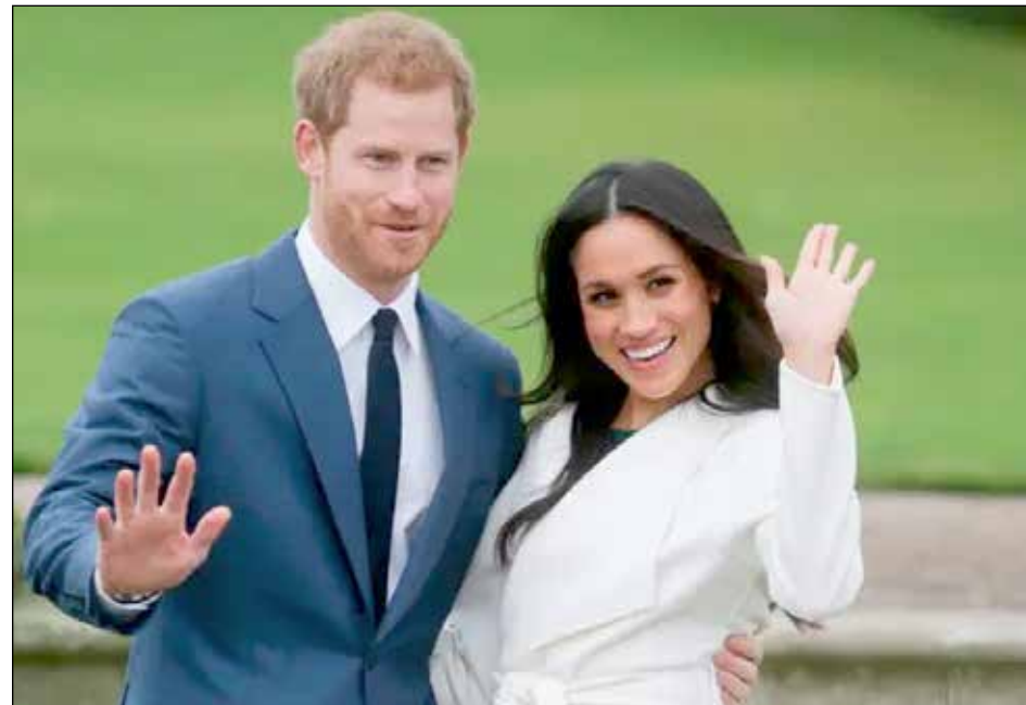
Meghan is suing for breach of privacy, copyright and under data protection laws.

Last month at a preliminary hearing, Mr Justice Warby struck out parts of Meghan's claim, including allegations that the newspaper dishonestly "stirred up" issues with her father and had an agenda against her. In the same court documents her legal team also claimed that Harry and Meghan's wedding at Windsor Castle in May 2018 raised £1billion in tourist revenue. Although there is little concrete evidence to support the claim – a figure of £300million