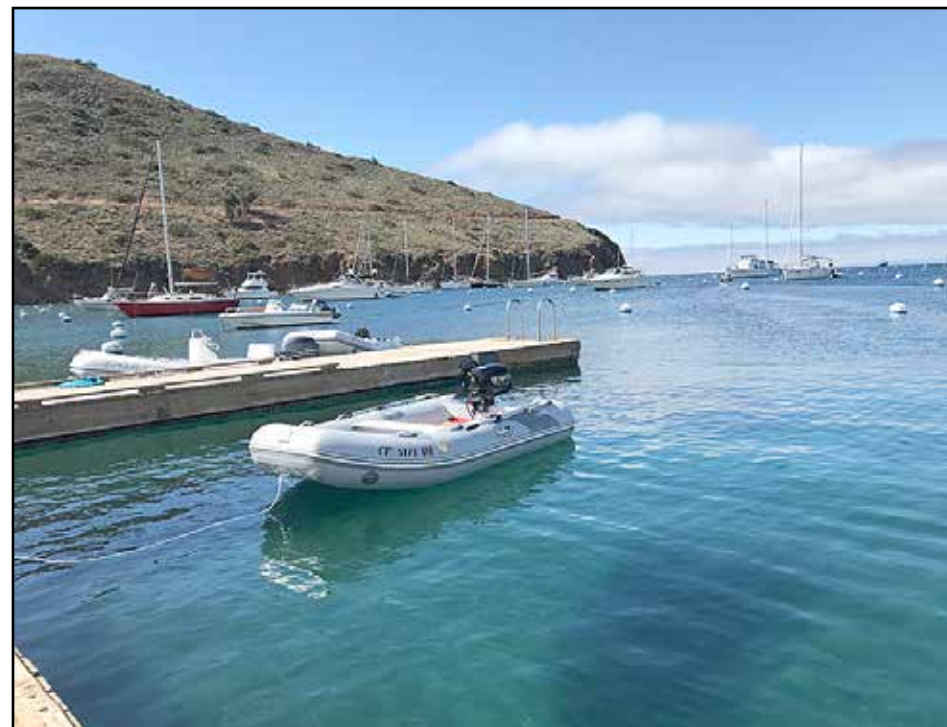
WHERE IS EVERYBODY? Two Harbors was almost deserted at the end of May

Our second and third visit was on Macondo, a 48 foot Beneateau on which I regularly race. A crew of six of us enjoyed much the same routine – leave LA on Friday at noon, arrive about 5pm. Pick up a mooring, inflate the dinghy and visit the island for a quick hike before heading back to the boat for drinks and dinner. Watching the stars and moon come out over a classic California landscape while on the horizon spying the distant glow from Long Beach and Palos Verdes is a memorable experience. And there's nothing quite like falling asleep to the gentle rocking of a sailboat and waking early to see dawn break over a glassy sea. The arid island cliffs rise sharply all around the harbor, covered in scrub and cactus, and if