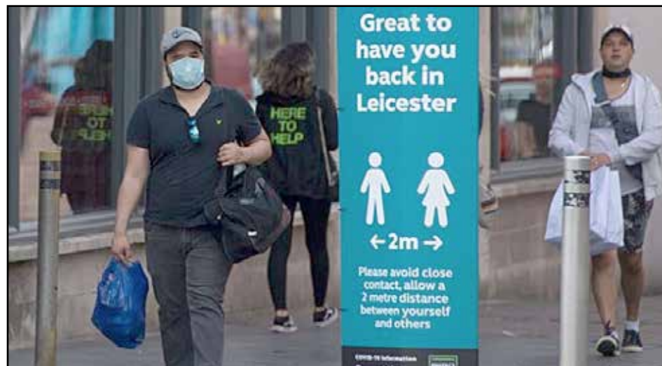
NOT NEARLY OVER: other towns and cities may soon follow Leicester's lead