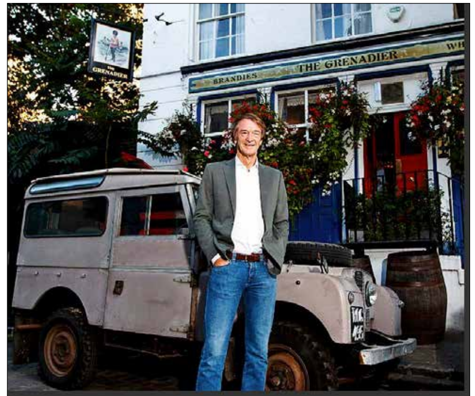
PIONEER SPIRIT: Billionaire Sir Jim Ratcliffe in front of the Belgravia boozier where he hatched his plan for a worthy successor to the Land Rover