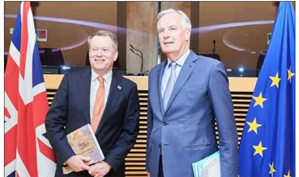
Our man in Brussels: David Frost (left), with EU counterpart Michel Barnier

rounds, the EU has refused to budge from its hardline demands for a regulatory level-playing field, a role for the European Court of Justice and continued access to Britain's fishing waters. After the first day of talks Mr Barnier said: "We will make the most of our