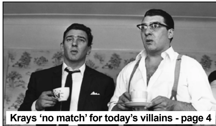
Krays 'no match' for today's villains - page 4

California's British Accent™ - Since 1984