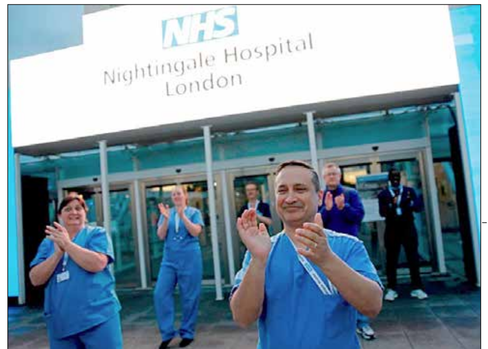
NEEDING A HAND: the waiting list for procedures may reach ten million

fear they will be unable to return to previous levels of service. Only seven per cent of chairmen and chief executives surveyed said they would immediately be able meet the needs of all patients. A quarter said they could return to meeting needs within