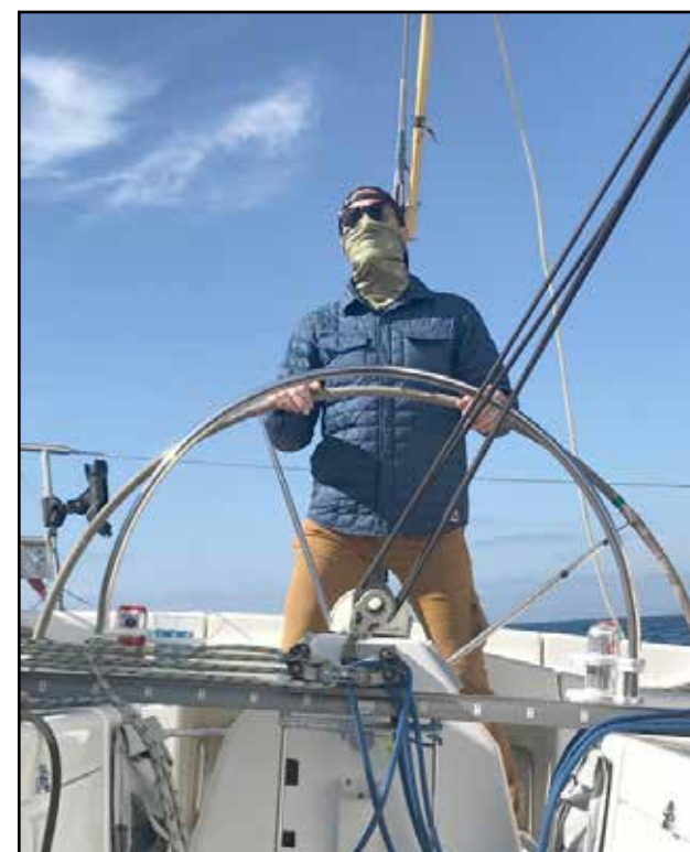
SAFE SAILING? Masks were required on the boat

We usually left for home around noon on Sunday, casting off and heading regretfully – but divinely relaxed – back across the channel to arrive at Marina del Rey in the early evening. But even if you don't have access to a boat, there are ways to access the island. The Catalina Express ferry offers a regular schedule to both Avalon and the Isthmus