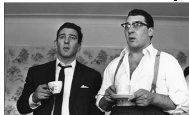
SMALL FRY? the Krays enjoying a cuppa