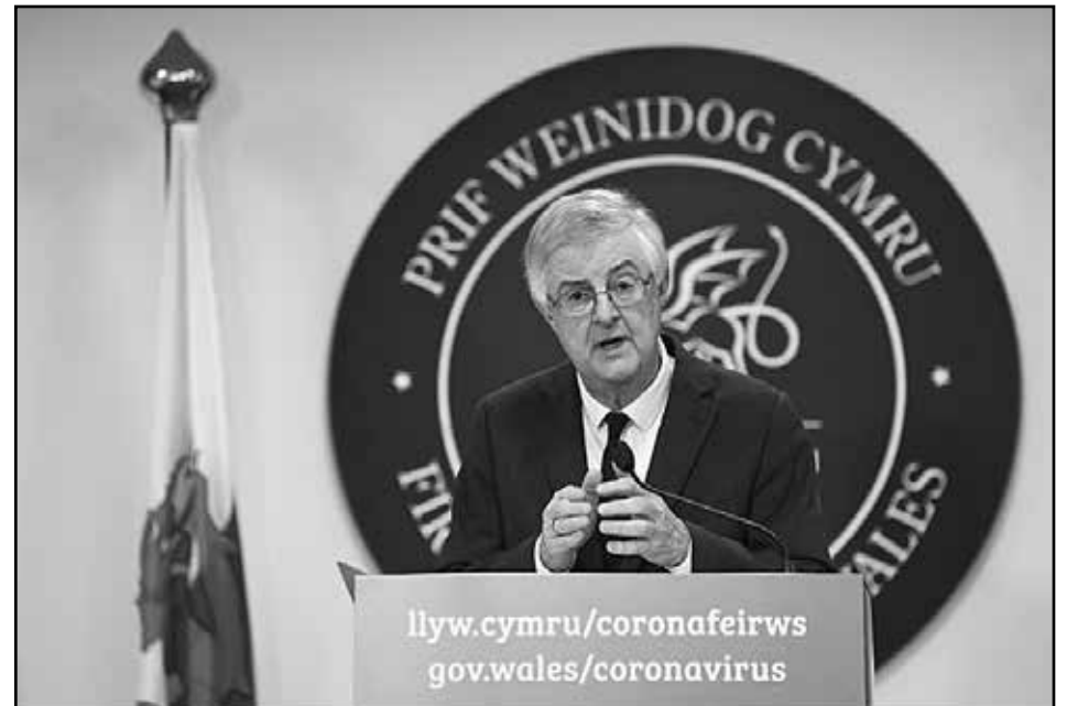
The rate of infection is currently 1.4, and the seven day rolling incidence rate for Wales stands at more than 120 cases per 100,000 population

During the lockdown, all non essential retail, leisure, hospitality and