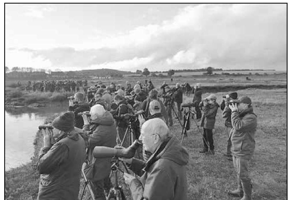
TWITCHER ALERT: the scene at Stiffkey, Norfolk

Yet bird lovers are still all of aflutter, because the rufous bush chat has not been seen on UK shores for 40 years. It is more used to spending its winters in