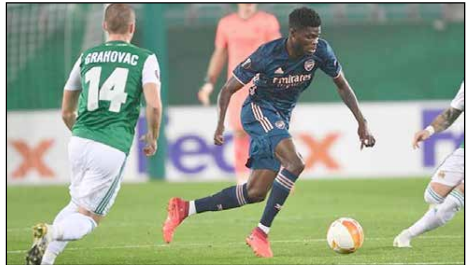
PARTEY TIME: The Ghanaian midfielder shone for Arsenal in Vienna

Another error by Leno almost gifted the Austrians a second when