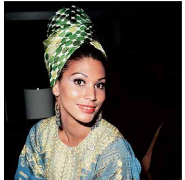
Jennifer Hosten (above) was the first Black Miss World, while Evelyn Dove (below) was the first Black woman to perform on BBC Radio

Evelyn educated privately until she studied singing, piano and elocution at the Royal Academy of Music. As a trained contralto in the early 1920s she hoped for a career on the concert platform, but this was almost impossible in Britain for a black singer at that time. Evelyn worked in London cabaret shows instead and the all-black cast jazz revues that toured Britain and eventually took her to Europe where she was a sensation.