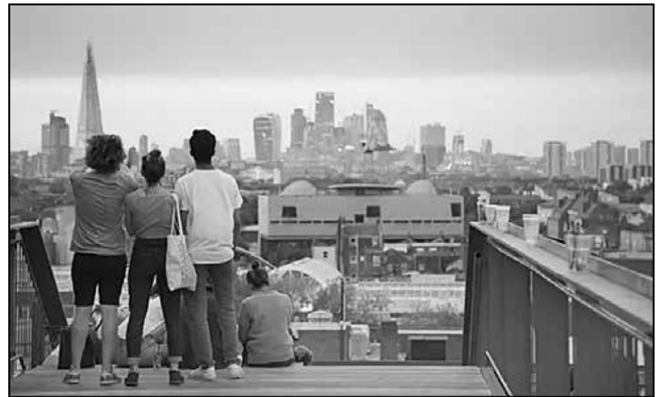
THE GOOD OLD DAYS: young people at Frank's Cafe, a roof top bar in Peckham, south-east London

The government believes that tighter measures imposed on the region a month ago are starting to have an