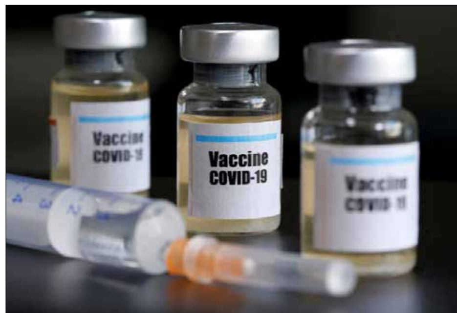
The Government had so far invested £47million in vaccine programs

"Alongside the acceleration of vaccine development, the Vaccine Taskforce is ensuring the country's