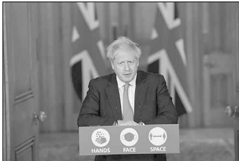
Mr Johnson spoke at a Covid-19 press conference on Tuesday

Mr Johnson said he hoped the mayor and other council leaders "will now work with