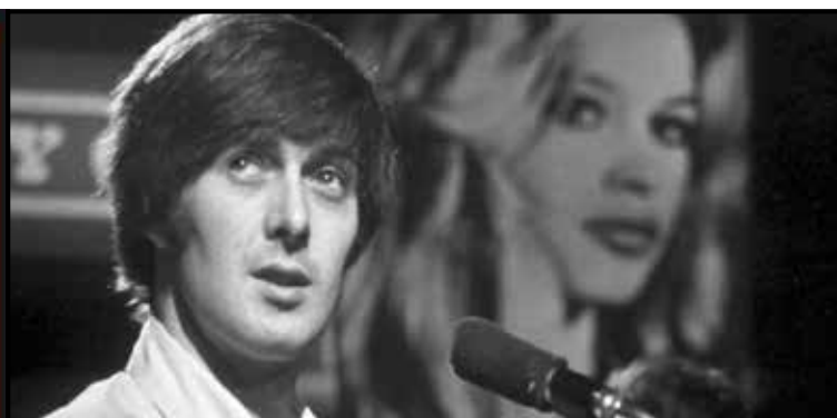
Spencer Davis dead at 81 - p4

California's British Accent™ - Since 1984