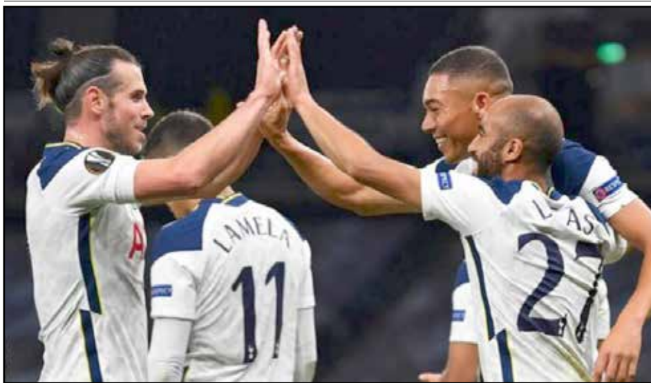
ANOTHER PROMISING DEBUT: Vinicius, Bale and Moura celebrate the opening goal for Spurs against LASK on Thursday night

"It's something we have to keep working on because we want to play the way I want to. It's necessary that I keep using both in our build-up play."