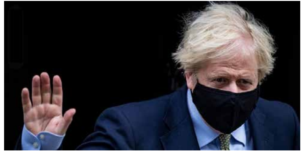
BORIS JOHNSON: "No one, least of all me, wants to impose these kinds of erosions on our personal liberty...."

He added: "We'll do our absolute best to try to