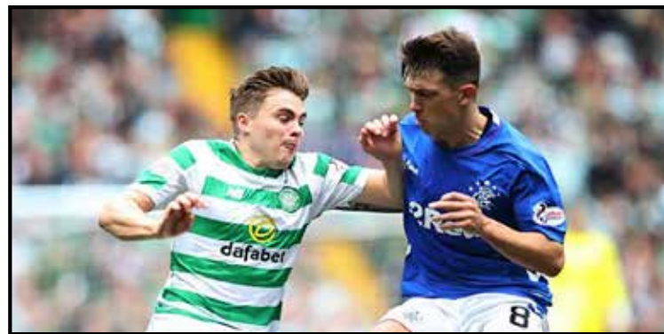
Sturgeon to Sky: make Old Firm game free - p5

California's British Accent™ - Since 1984