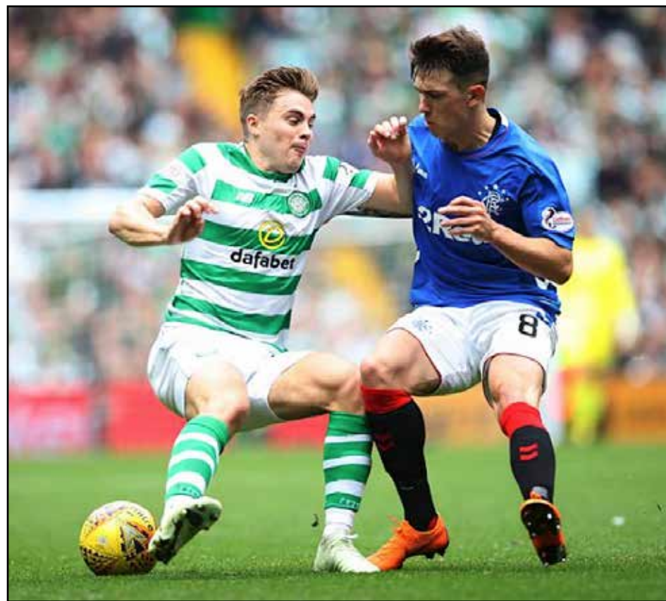
BIG DEMAND: one pub in Blackpool received 1,500 booking requests

Sky Sports to make the match free to view for supporters, "as a small but important contribution that they could make in helping keep people safe right now".