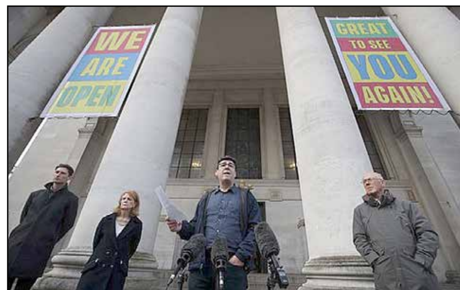
"...any restrictions will choke off trade to our pubs, restaurants, even our shops so [they] must come with a full economic support," said Andy Burnham, Mayor of Manchester (center)