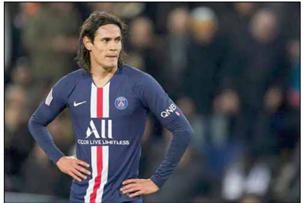
CAVANI: "Any player who is competitive by nature always wants to be able to win silverware."

He is unavailable for Saturday's trip to