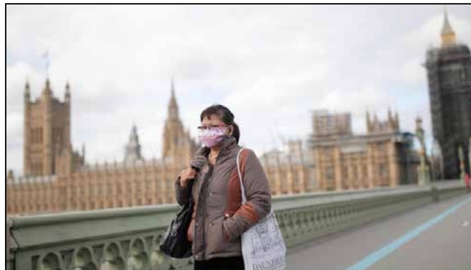
London moved from its current 'medium' alert level to 'high' on Friday

closures and a ban on household mixing indoors, in private gardens and in most outdoor hospitality venues and ticketed events.