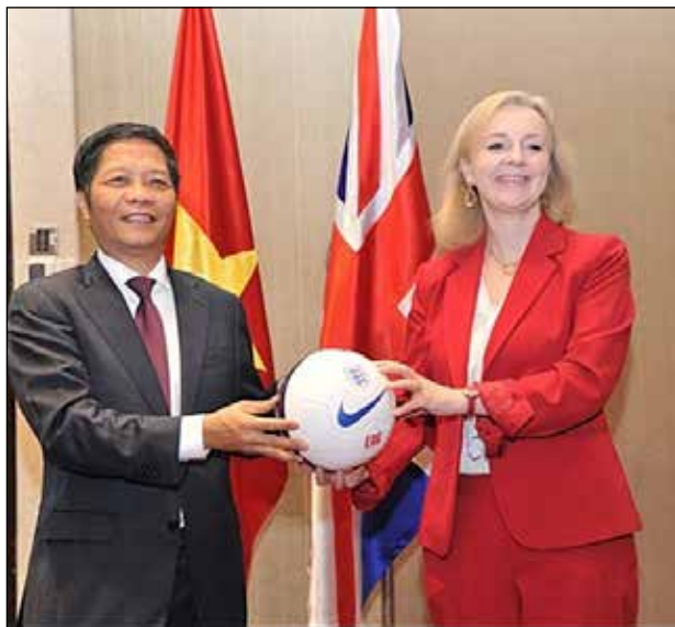
'ECONOMIC DYNAMISM': a trade deal with Vietnam was just one of the agreements unveiled by Liz Truss this week

"While we were not able to unleash the full potential of our innovators in the past, we are now championing the industries of the future with innovation-loving