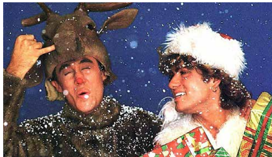
THE WAY THEY WERE: George Michael and Andrew Ridgeley in 1984

subsequently recorded in the middle of August at London's Advision Studios, which Michael plastered in Christmas decorations to set the mood.