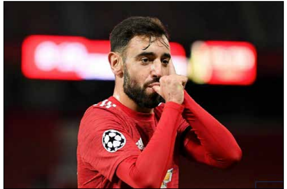
KIDS' STUFF: Fernandes has scored 11 league goals for United this term

But they were even more impressive in the early stages of the second period, Grealish crossing for the Watkins header that was saved by De Gea before collecting a quick free-kick and finding