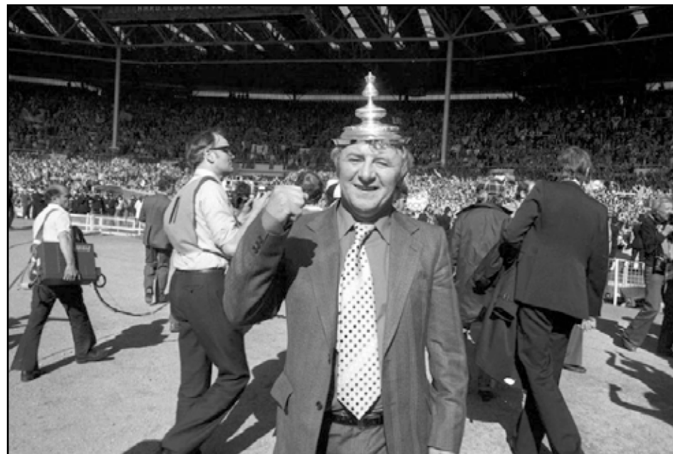
HIS FINEST HOUR? celebrating victory in the 1977 FA Cup final over Liverpool

Docherty's time at Old Trafford also saw George Best fail to revive his United career, the retirement of Bobby Charlton, and the