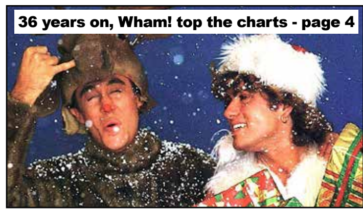
36 years on, Wham! top the charts - page 4

California's British Accent™ - Since 1984