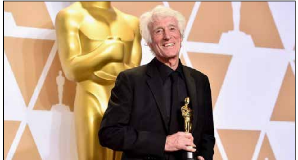
SERIAL NOMINEE: Deakins has been nominated for an Academy Award fifteen times, dating back to The Shawshank Redemption in 1995

relationship was with Sir Sam Mendes and included working on the James Bond film Skyfall.