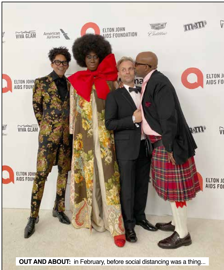
OUT AND ABOUT: in February, before social distancing was a thing...