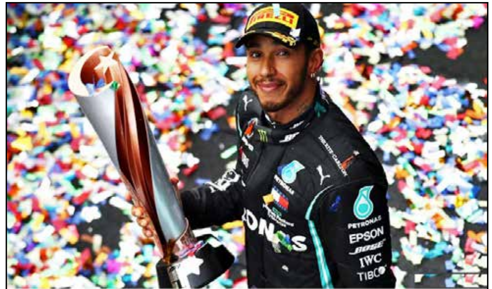
BEST OF BRITISH: Lewis Hamilton recently overtook Michael Schumacher as the most successful Formula One driver of all time

Among the other new dames are Jane Glover, conductor and musicologist, and Pat McGrath, described by Vogue magazine as the most influential makeup artist in the world.