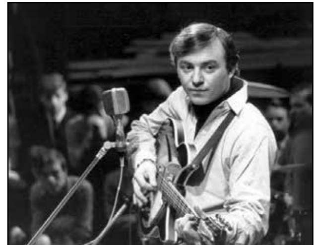
HEYDAY: Gerry performing in Germany in 1966

The Beatles manager Brian Epstein signed