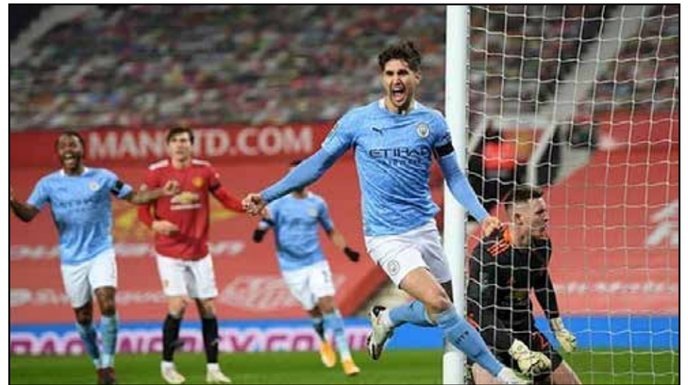
HAIL STONES: the revitalized City defender put in an eye-catching performance Wednesday night, including opening the scoring for Pep Guardiola's side

The Belgian's shot, which thudded off the post at such pace it bounced straight out to Wan-Bissaka, who was fully 12 yards away from his goal, was majestic in its brutality.