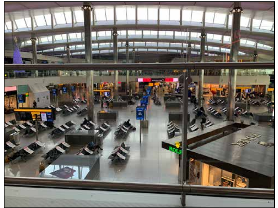
SIT ANYWHERE: a deserted departure lounge at Heathrow last week

I had my Green Card in hand, holding it up so every camera would see it and hopefully stop watching me. A wave of joy washed over me as I entered the Customs Hall and saw that those hideously useless passport machines that do little other than photocopy your passport and give you a bad selfie were switched off. I was beckoned to one of the Customs desks, thankfully getting the rather jovial chap out of