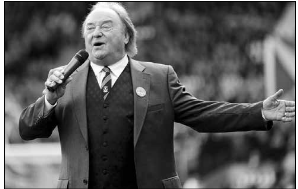
Gerry Marsden leading the crowd in a rendition of "You'll Never Walk Alone"

Singer Elvis Costello posted a link to the song Away From You and added: "His voice will