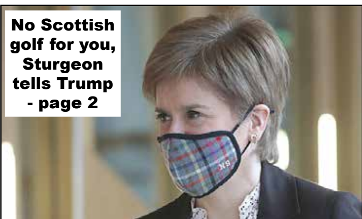
No Scottish golf for you, Sturgeon tells Trump - page 2

California's British Accent™ - Since 1984