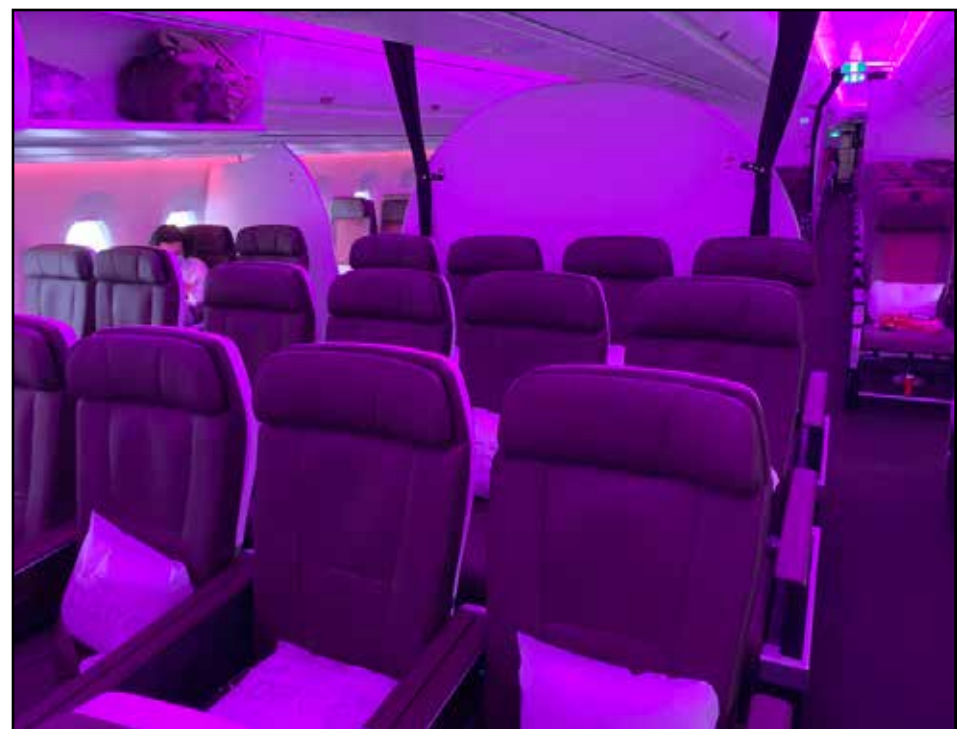
SOCIAL DISTANCING the scene inside Chris's Airbus plane en route to LAX

the group instead of one of the more aggressive ones. I was through in about three minutes and almost exploded with happiness when I saw the baggage carousel downstairs already had our luggage coming out - fastest unload EVER.