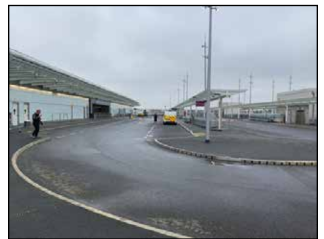
EMPTY: drop off at Heathrow last week

I walked out of the secure area, one of the Customs dogs sniffing at my WH Smith bag that was now bereft of sandwiches, and past a group of Customs officers who were yammering to each other and grabbing anyone who literally looked them in the