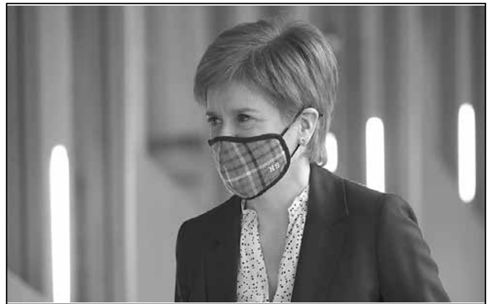
"Coming to play golf is not what I would consider to be an essential purpose.' - Nicola Sturgeon on Trump's rumored plans to visit Scotland this month

Scotland's Sunday Post reported that Prestwick airport - less than an hour's drive from Trump's Turnberry golf resort - has been told to expect the arrival of a U.S. military aircraft on January 19 - the day before Biden is due to be inaugurated in Washington DC.