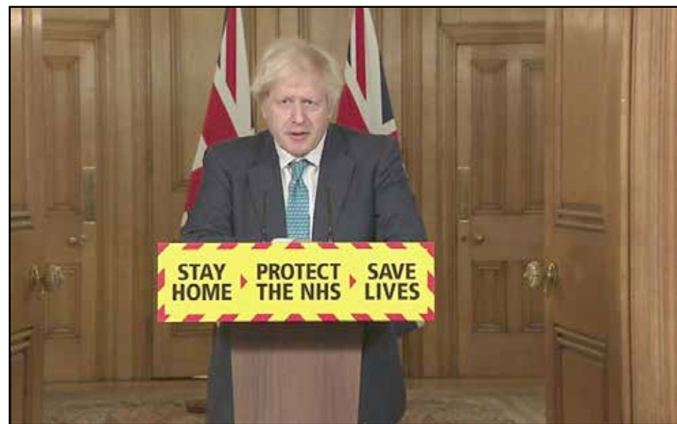
BORIS JOHNSON: “I believe what President Trump has been saying about that has been completely wrong and I unreservedly condemn encouraging people to behave in the disgraceful way that they did in the Capitol.”

She added: “He basically has made a number of comments yesterday that helped to fuel that violence and he didn’t actually do anything to de-escalate that whatsoever... what we’ve seen is completely unacceptable.”