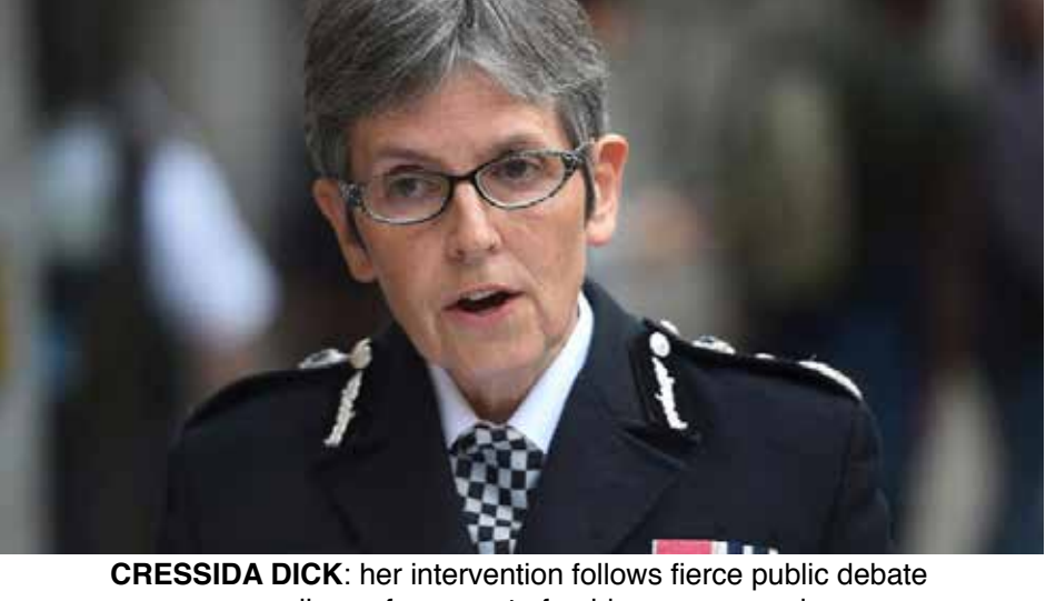
over police enforcement of guidance on exercise

Dame Cressida says that people are still holding house parties, meeting in basements gamble attending unlicensed raves in the teeth of the pandemic's most deadly phase. Writing