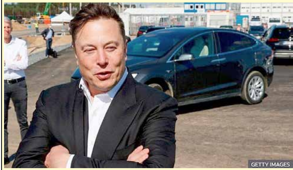
ELON MUSK: the Tesla founder plans to make broadband available worldwide

The world's richest person has been invited to consider setting up a new manufacturing site in Swindon.