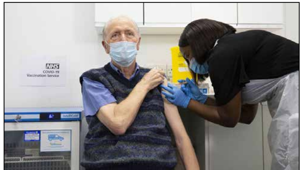
BIG NUMBERS: the NHS is administering almost 1,000 jabs a minute (STORY: Page 2)

So, that being the case, it's not going to kind of overrun or overtake the current B1.1.7 virus in the next few months, or