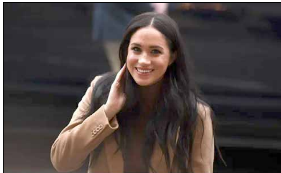
The Duchess of Sussex's lawyers had argued Associated Newspapers had 'no prospect' of defending her claim against them

The judge said "the only tenable justification" for publication would be to correct some inaccuracies about the letter contained in an article in People magazine that had featured an interview