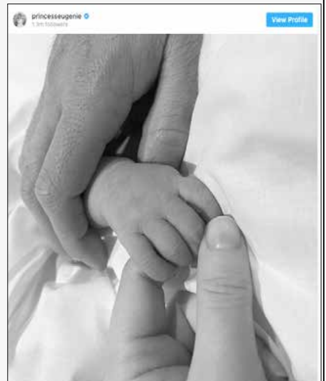
TOUCH OF LOVE: the Princess's Instagram post

However, he is expected to be known as Master Brooksbank as Jack has no title and his son has been born down a female line of the Royal Family. Under rules from King George V in 1917, he will be neither an HRH nor hold a title unless the Queen gives Jack an earldom or