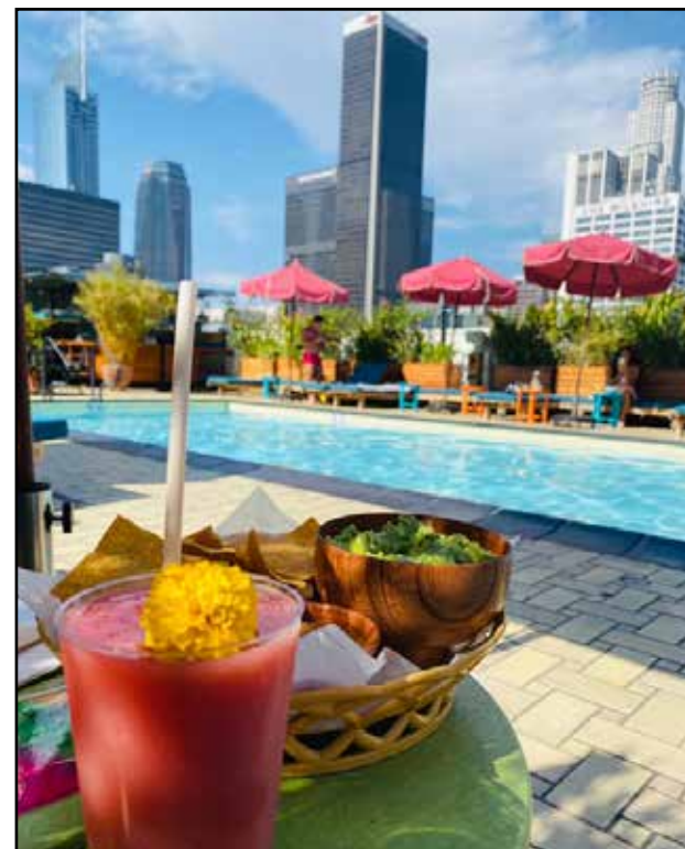
DRINKS WITH A VIEW: downtown's Freehand Hotel