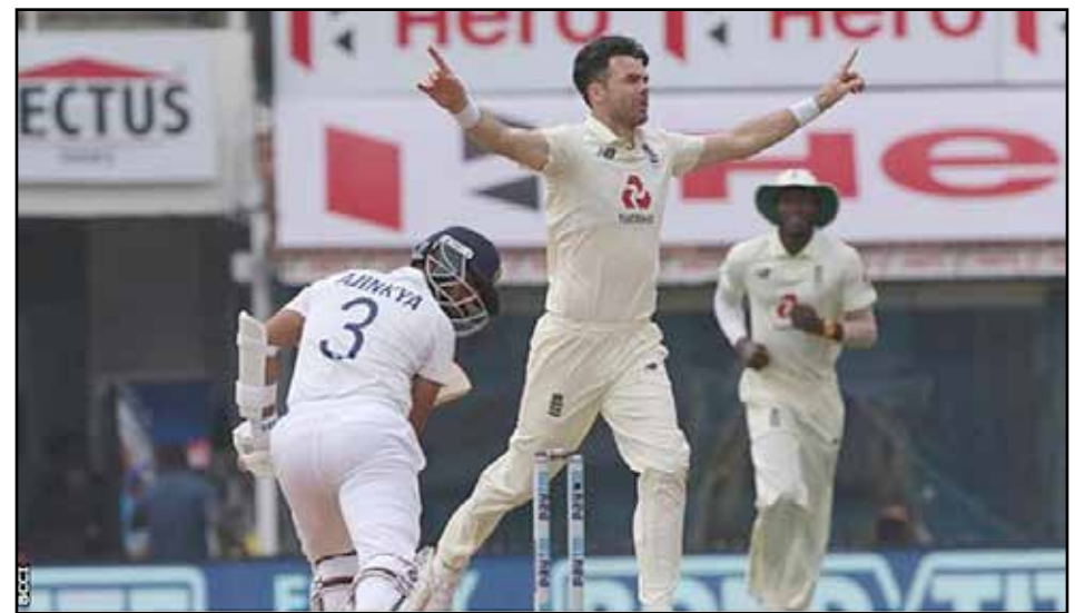
MAGIC MAN: Anderson's first over was a double wicket maiden and turned the match in England's favor in Chennai