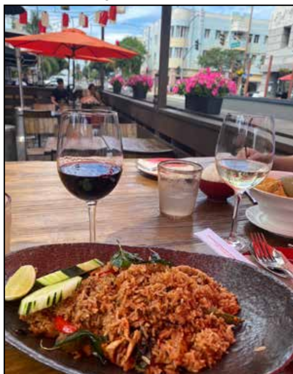
FAVORITE SPOT: Long Beach's Thai District