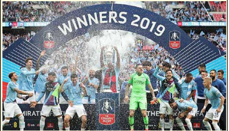
A BIT OF PREVIOUS; City won the FA Cup final in 2019, beating Watford 6-0

Everton will host Premier League leaders Manchester City and Leicester City face Manchester United in the quarter-finals of the FA Cup.