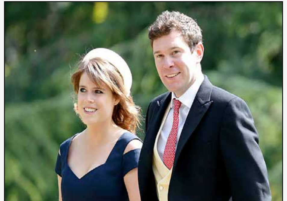
PROUD PARENTS: Princess Eugenie and Jack Brooksbank

His birth makes Eugenie's parents, Prince Andrew and Sarah, grandparents for the first time.