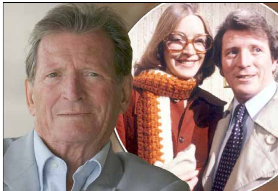
STREET STALWART: Johnny Briggs made his Coronation Street debut in 1976, and his character Mike Baldwin quickly became the man many Corrie viewers loved to hate...especially when he hooked up with Dierdre Barlow (inset)