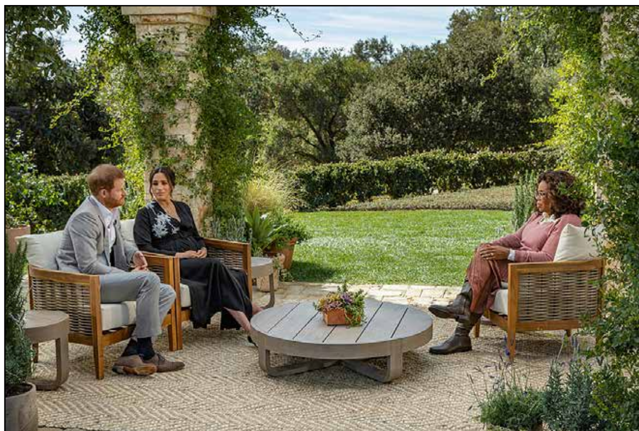
STORM CLOUDS BREWING: Oprah's interview with the couple airs on Sunday night

In a statement later, Buckingham Palace - which is responsible for the hiring of royal staff - said it was "clearly very concerned about allegations in the Times" and its HR team would look into the