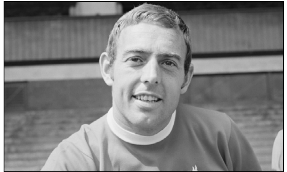
TRUE LEGEND: St. John joined Liverpool in 1961 and enjoyed a long career before making a successful transition to TV pundit

Reds legend Jamie Carragher grew up watching St John on ITV's 'Saint and Greavsie' on Saturday