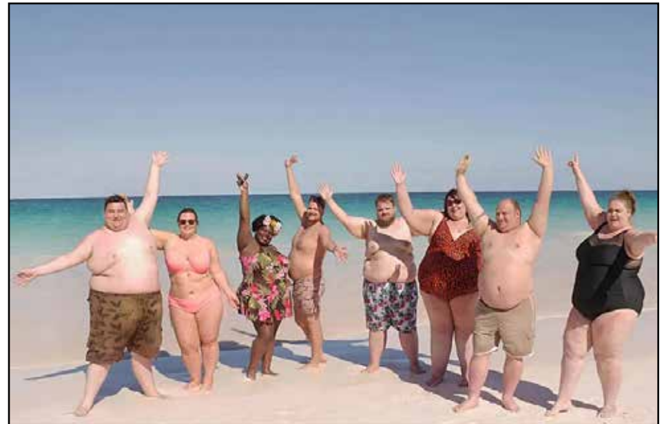
NO LAUGHING MATTER: Britain has the highest rates of obesity in Europe

No country where less than 40 per cent of the population is overweight