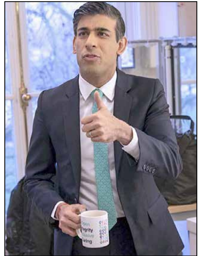
"I know the British people don't like tax rises, nor do I." - Chancellor Rishi Sunak

The Resolution Foundation, another think tank, said that