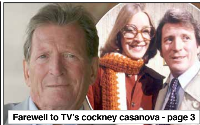
Farewell to TV's cockney casanova - page 3

California's British Accent™ - Since 1984