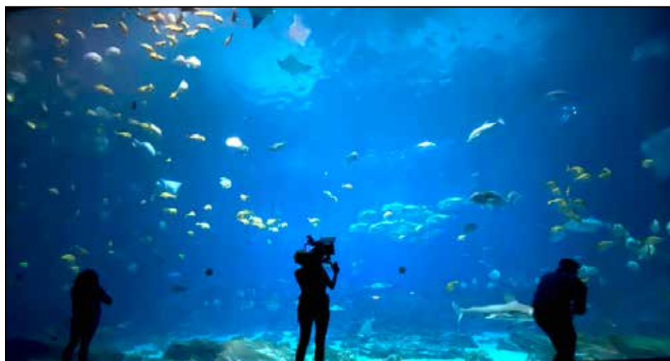
DEEP DIVE: The Georgia Aquarium