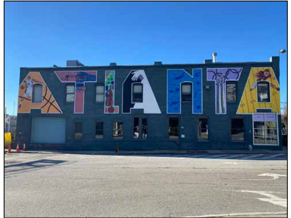
Atlanta: the capital of the Peach State has plenty to recommend it, including a very cool motorcycle museum (below)

However on the upside of Atlanta, I can see that when the sun's out the town comes alive and the rhythms of the city slowly awake...I did get to experience some of the local attractions thanks to my work. Like the Georgia Aquarium, a Roller Rink, and amazing dance collaboration, an air traffic control tower, a motorcycle museum and a speedway. So even in the darkest of