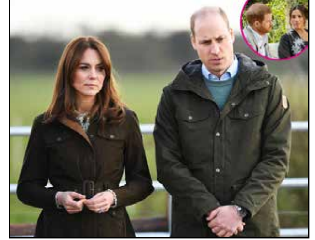
MORE IN SORROW THAN ANGER? William said he had not spoken to Harry since the interview

The duke replied: "We're very much not a