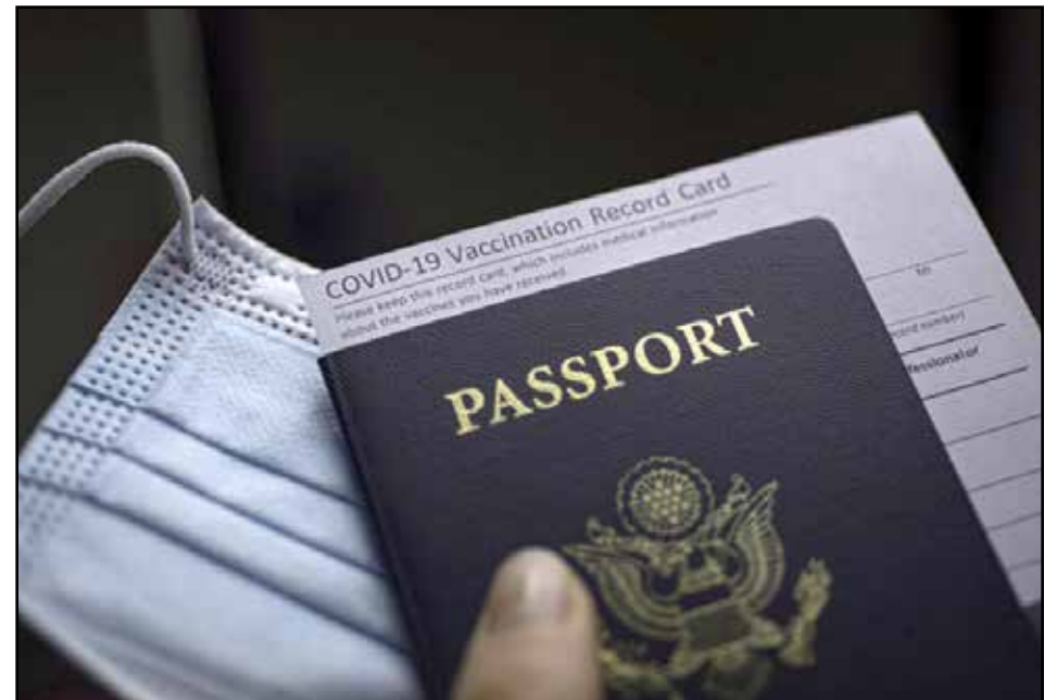
TICKETS, MONEY, PASSPORT...MASK, JAB CARD?

"We're looking at the role of vaccination passports for overseas