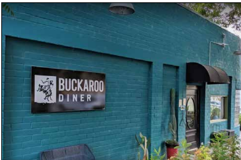
LOCAL FAVORITE: the Buckaroo diner in Three Rivers

Affordable Elegance ... There's a reason our residents call us Home!