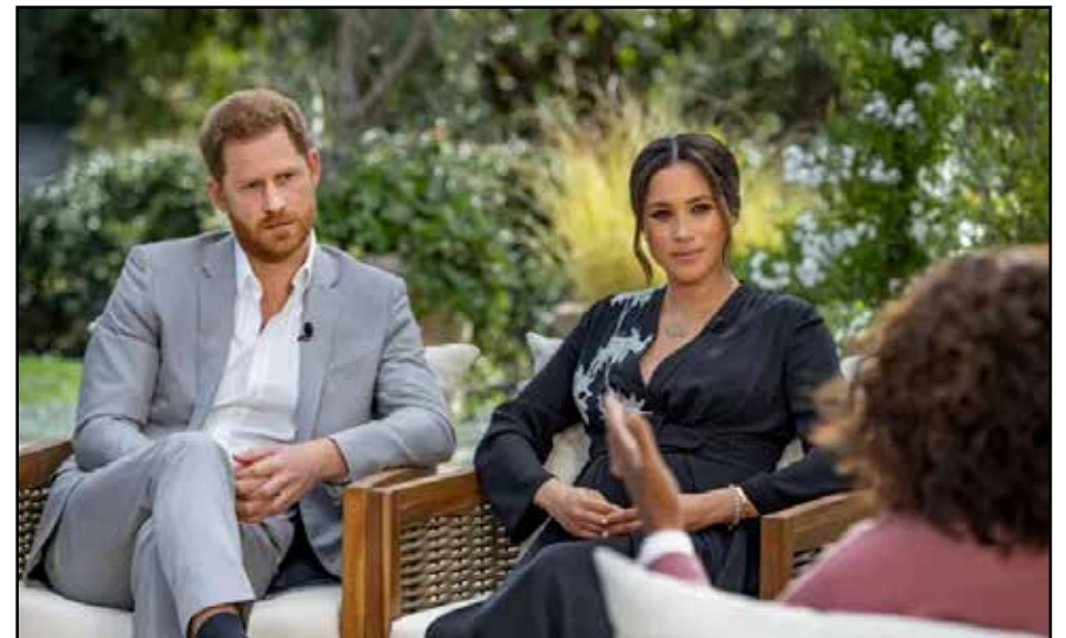
UNDER THREAT? The couple disclosed they had put in place "privately funded security arrangements" since their move to California

The couple disclosed they had put in place "privately funded security arrangements" for their move to the US, after the then president,