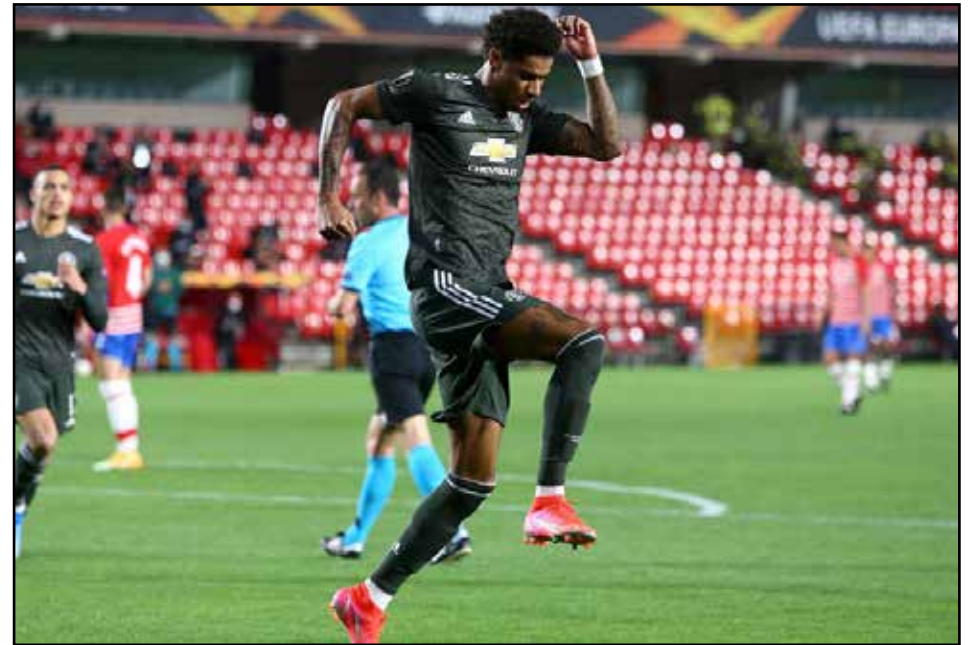
STRIKE ONE: Rashford celebrates his opener for United Thursday night

Fernandes had a shot from the corner of the