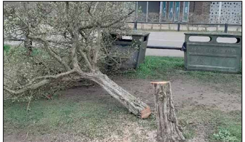
CUT DOWN IN ITS PRIME: a former tree in Walton-on-Thames

The first reports of the fellings were made on