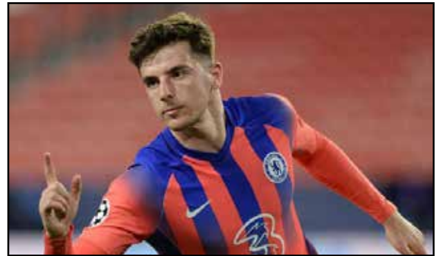
REPUTATION MOUNTING: the Chelsea star was on target again this week in the Champions League

In 2020-21, he has found the net for club and country in the Premier League, Nations League,