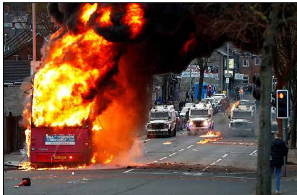
A RETURN TO ALL THAT? Northern Ireland's power-sharing executive said it was "gravely concerned" by recent street violence

The disorder seen this week has been linked to the loyalist anger over the Northern Ireland protocol, with checks on goods being shipped from Great Britain reinforcing fears over