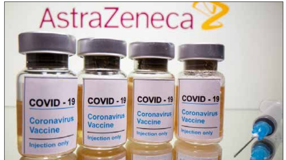
SAFE AS HOUSES? the type of clot caused by the vaccine is "vanishingly rare".

• The Royal College of Psychiatrists said that the country was in the grip of a mental health crisis, with referrals rising sharply during the pandemic.