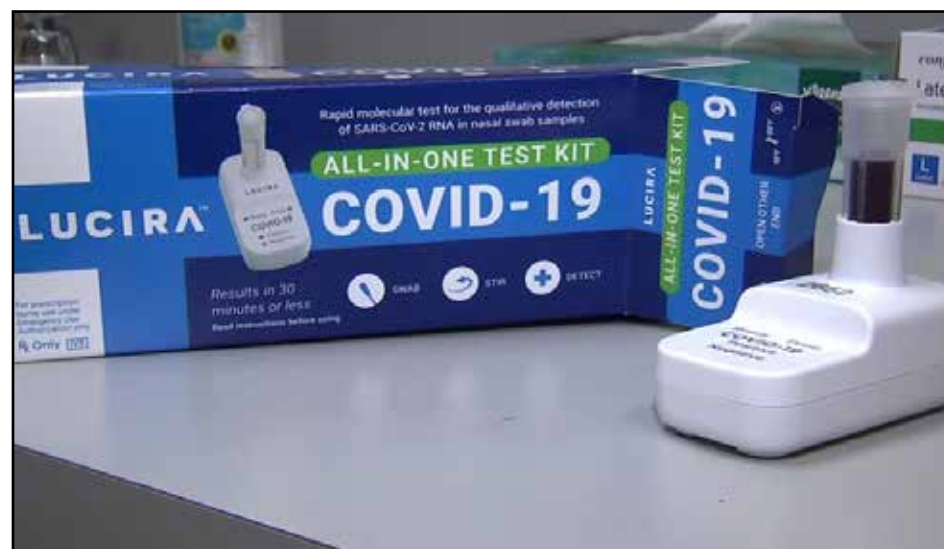
THE WAY OUT? A Government advertising blitz was launched on Friday to raise awareness of the availability of the tests to all UK adults

increased testing will help break the chains of Covid transmission and save lives.