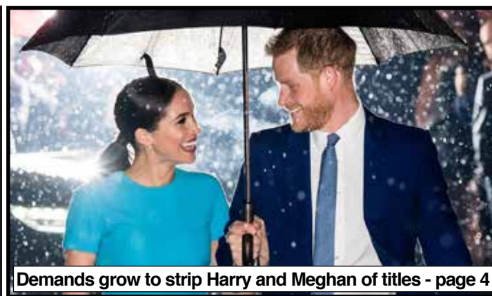
Demands grow to strip Harry and Meghan of titles - page 4

California's British Accent™ - Since 1984