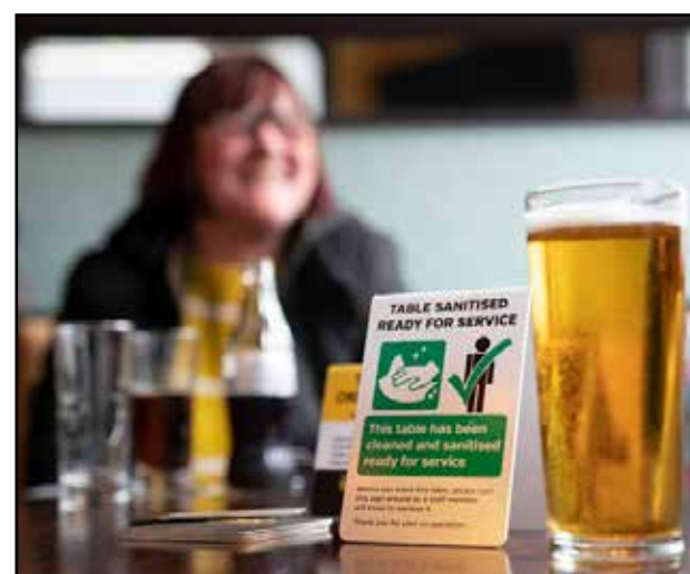
Around 104 million people were expected to head out to pubs, restaurants and cafes this week

taken as to whether the can go ahead as planned last step out of lockdown on June 21.