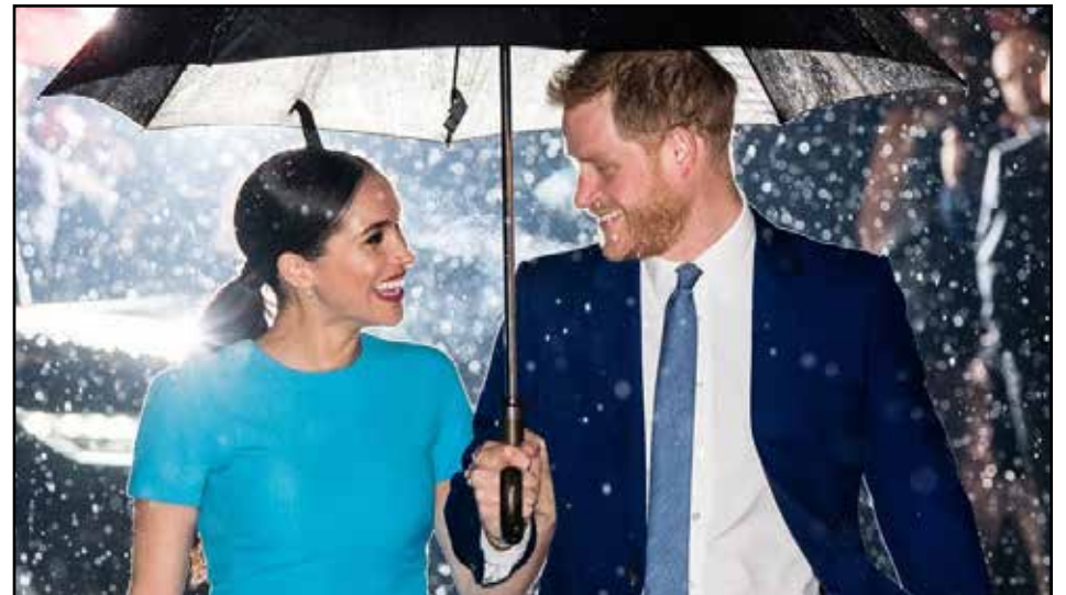
OUTLOOK GLOOMY: a further sequence of escalation and payback between the Sussexes and their estranged family seems likely

The Sussexes agreed not to use their HRH