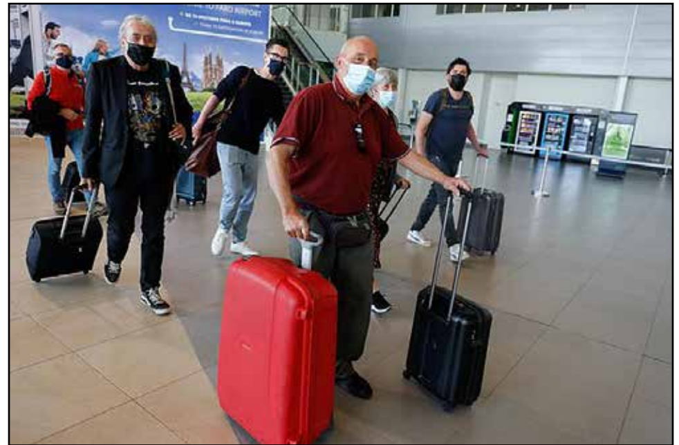
Portugal was the most popular destination for Britons this week, with 30 flights leaving for the country on Monday alone

British Airways has been haemorrhaging £1million an hour during Covid – worse than 9/11, Sars and the