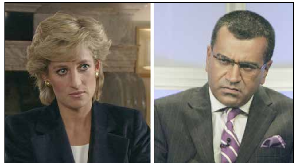
Martin Bashir's interview with Princess Diana was the first time a serving royal had spoken so openly about life in the Royal Family

And as media interest in the interview increased, the BBC covered up what it had learnt about how Bashir secured the interview. Lord Dyson said this "fell short of the high