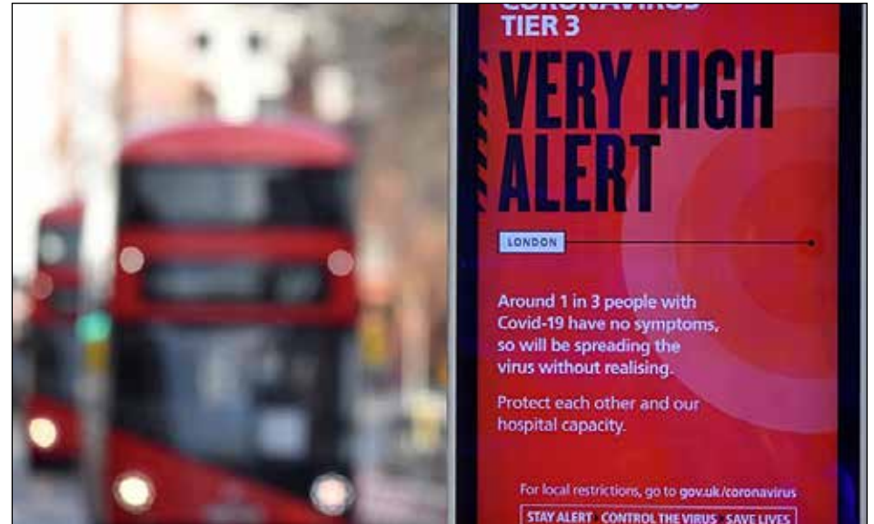
In the last seven days, there have been 44,008 new positive coronavirus tests in the UK. That's a rise of 17,036 - or 63.2% - from the previous week.

The variant is also spreading in the U.S. The White House said Thursday that the Delta variant now makes up 6% of coronavirus infections, but highlighted the efficacy of vaccinations against the Delta strain. The U.S. is reporting record low hospitalizations, deaths and cases since the start of the pandemic.