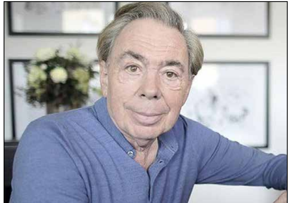
The theatre mogul said he may have to sell his six West End venues if the government does not relax its restrictions.

Audience members at the Brits, held at London's O2 arena, were not required to wear masks or socially distance as they had all been required to take a Covid test.