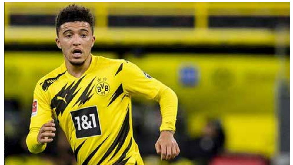
JADON SANCHO: the German club want £77.5m for the 21-year-old

Among their major young stars, including Erling Braut Haaland and Jude Bellingham, Sancho is the only one