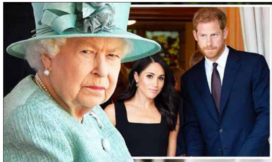
At the weekend, the couple announced that Lilibet "Lili" Diana Mountbatten-Windsor had been born at a hospital in Santa Barbara in on Friday morning.

Lilibet has been the Queen's nickname among her family since her childhood.