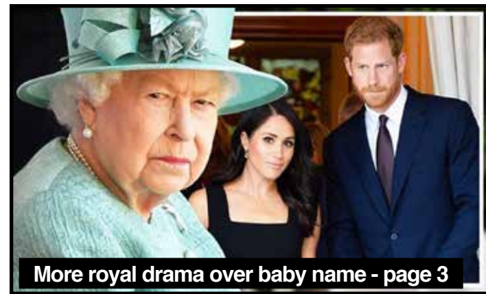
More royal drama over baby name - page 3

California's British Accent™ - Since 1984