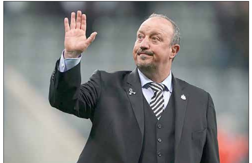
BENITEZ: the Spanish manager has a house on Merseyside

The question for Moshiri is how palatable that would be to his fanbase. There are numerous examples of players switching their allegiances, but no manager has ever led both clubs.