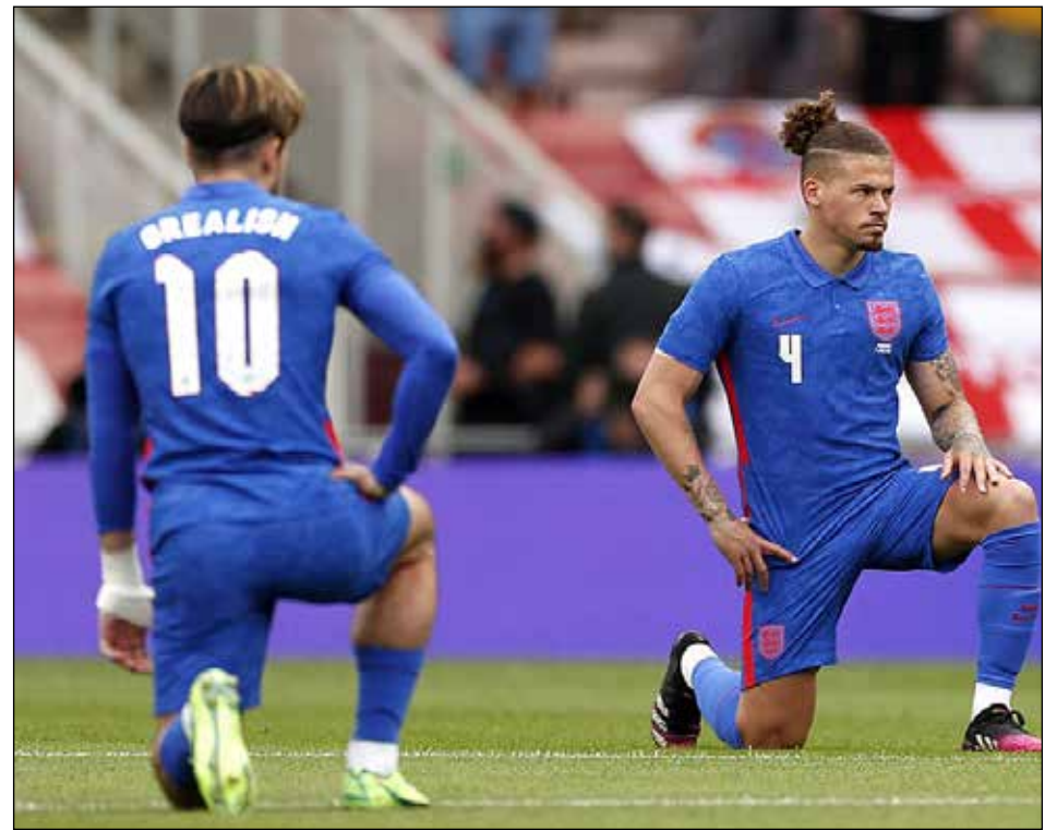
England players taking a stand (sort of) ahead of a recent friendly

"I'd shout to the fans to make sure you continue