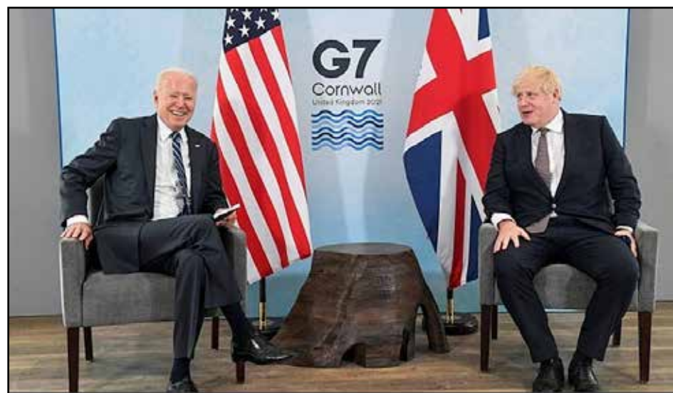
WESTERN APPROACHES: Mr. Biden said he was 'thrilled' to be in Cornwall

Biden said: "It's gorgeous - I don't want to go home."