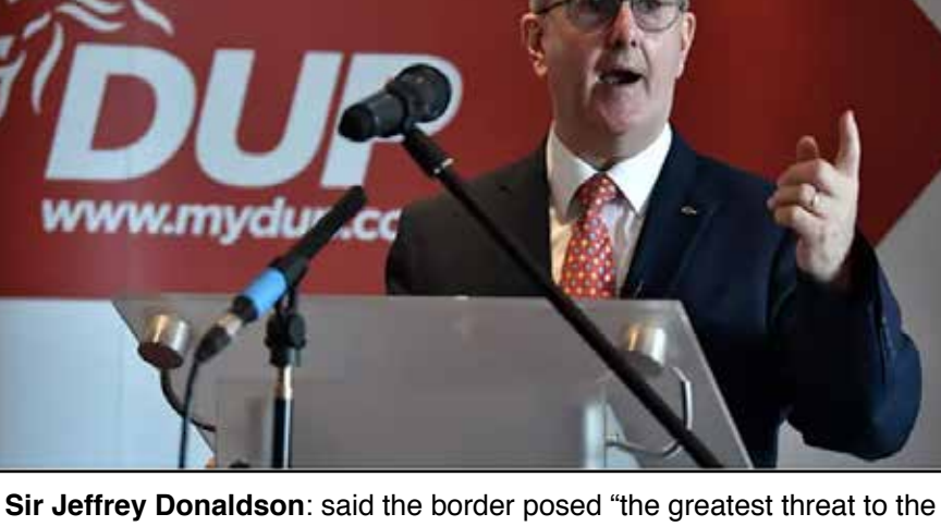
economic integrity of the United Kingdom in any of our lifetimes".

The rows had strained the patience of the public and the party's