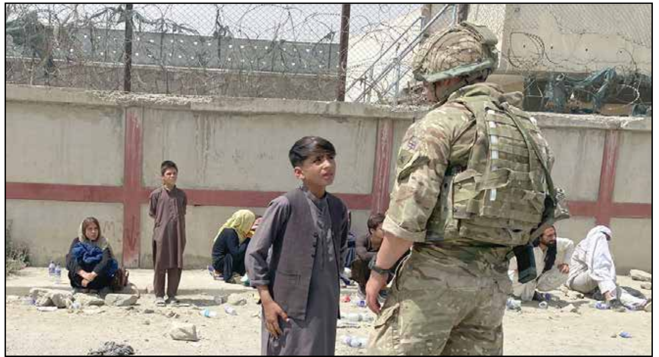
THE CENTER CANNOT HOLD: The PM this week sent in 200 soldiers from 2nd Battalion, Parachute Regiment (2 Para) to bolster the evacuation to the UK of Britons and key Afghan aides

"That means providing whatever support we can to the Afghan people who have worked so hard to make the country a better place over the last twenty years."