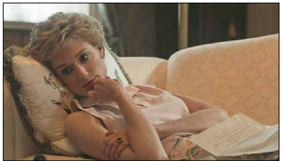
BIG DOWN UNDER: Australian star Elizabeth Debicki will play Princess Diana

Australian Elizabeth, 30, who starred in the smash BBC adaptation of John le Carré's The Night Manager , appears pensive lying on a sofa with her head propped up on a pillow. Dominic, 51, sports a smart olive-coloured suit and bold striped tie.