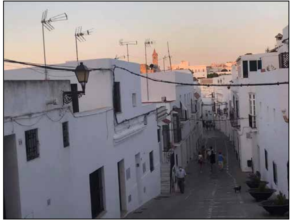
VEJER DE LA FRONTERA: a whitewashed gem

After a couple of hours bronzing and chilling we headed off on the 45-minute ride to Vejer de la Frontera, a charming hilltop town full of whitewashed buildings and fabulous small, inexpensive restaurants. I had been here before in