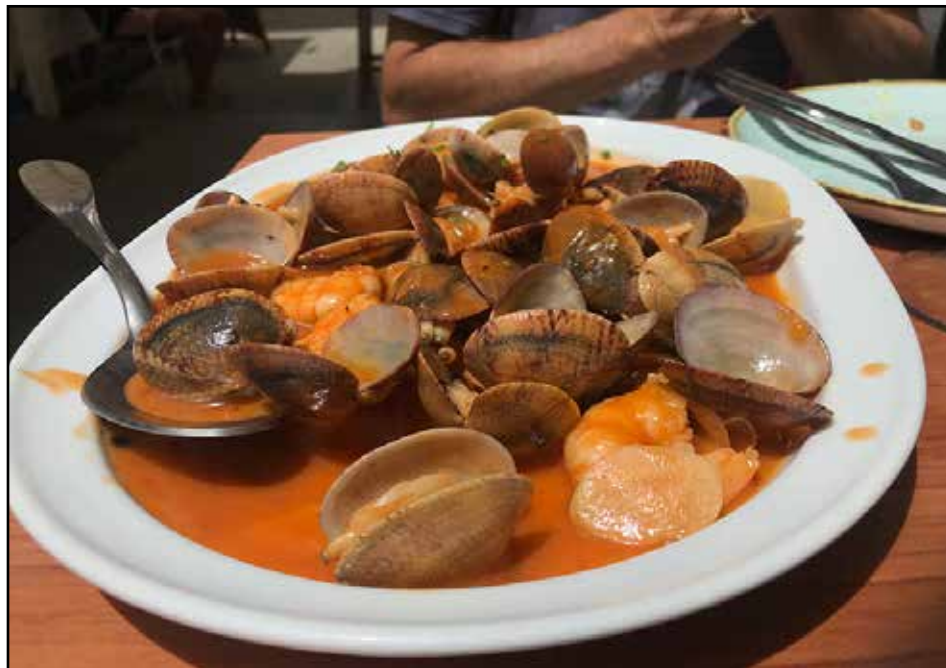
SIMPLY IRRESISTIBLE: the clams in Tarifa