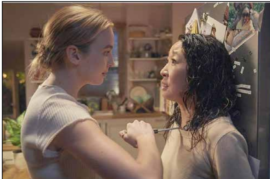
SEXUAL TENSION: Jodie Comer and Sandra Oh star in the BBC global smash