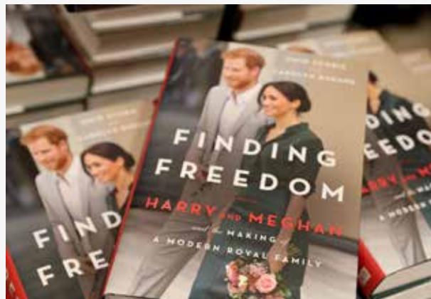
TROUBLE AHEAD: 'Finding Freedom' is causing headaches