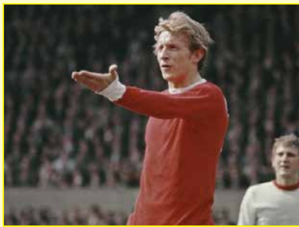
Dennis Law won the Ballon d'Or in 1964

is happening and that is why I want to address my situation now whilst I am able, because I know there will be days when I don't understand and I hate the thought of that right now."