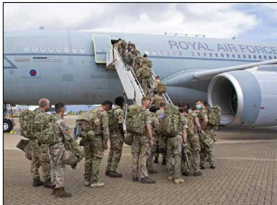
INTO HARM'S WAY: British paras at RAF Brize Norton en route to Kabul

The latest UK flight from Afghanistan landed at RAF Brize Norton in Oxfordshire in the early hours of Thursday