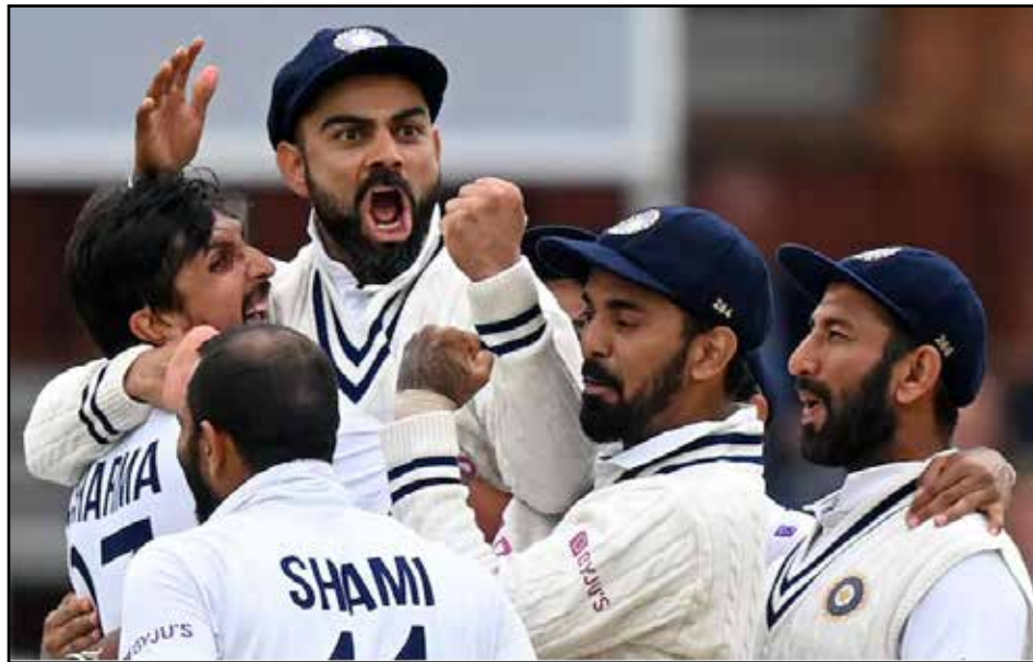
CAPTAIN FANTASTIC: a fired-up Virat Kohli led India to victory at Lords