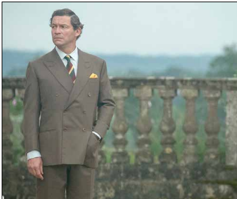
POSH MEETS POSH: Old Etonian Dominic West plays Prince Charles

STARS Elizabeth Debicki for the first time as Princess Diana and Dominic West have been seen for the first time as Prince Charles in the first official snaps from the new series of The Crown.