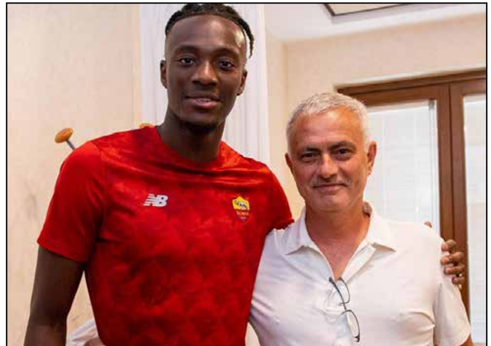
PASTURES NEW: Abraham with Roma boss Jose Mourinho

"We have all enjoyed watching his progress through our academy and into the first-team squad, and are grateful for his contribution to our successes. His many goals in a Chelsea shirt and, of course, his part in our Champions League