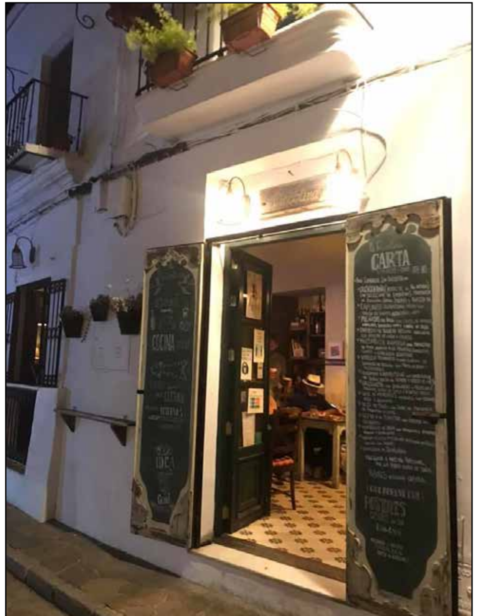
WORTH A STOP: Piccolino's in Vejer's Plaza de Espana

endive cooked on the grill and tomato confit, and an entrée of pulpo (octopus) a la plancha. With four glasses of tinto de Verano (summer wine – basically