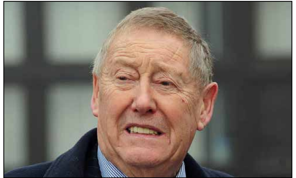
Austin Mitchell was so devoted to Grimsby that he changed his last name to Haddock