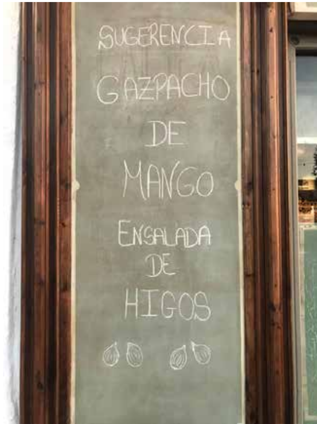
ALWAYS INVITING; the menu at Tapas de Vejer