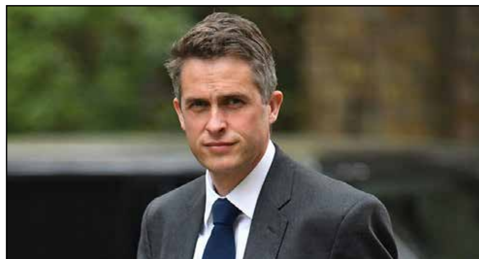
ON THE OUTS: Gavin Williamson was fired as Education Secretary

In a direct plea to Boris Johnson she said: "I could very much help you in your fight against terrorism because you clearly don't know what you're doing."