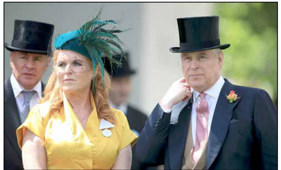
HOT UNDER THE COLLAR? Andy and Fergie have been staying at Balmoral

She is suing the Queen's son for allegedly sexually assaulting her when she was a teenager, seeking unspecified