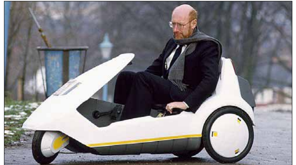
AHEAD OF HIS TIME: Sir Clive with the C5 electric car in 1985, and (below) with the Sinclair TV80, a pocket TV

Sinclair became a household name as his products flew off the shelves and was awarded a knighthood in 1983. But he would also become synonymous with one of his less successful inventions – the Sinclair C5 – which would cost him financially. The C5, a battery-powered electric trike, was launched in January 1985, with Sinclair predicting sales of