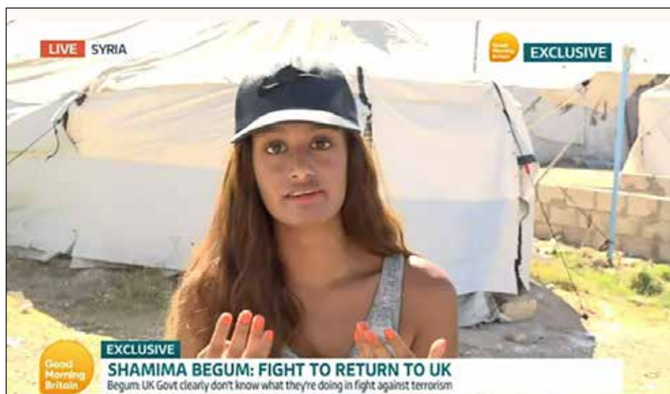
Shamima Begum: blocked from returning to the UK this week