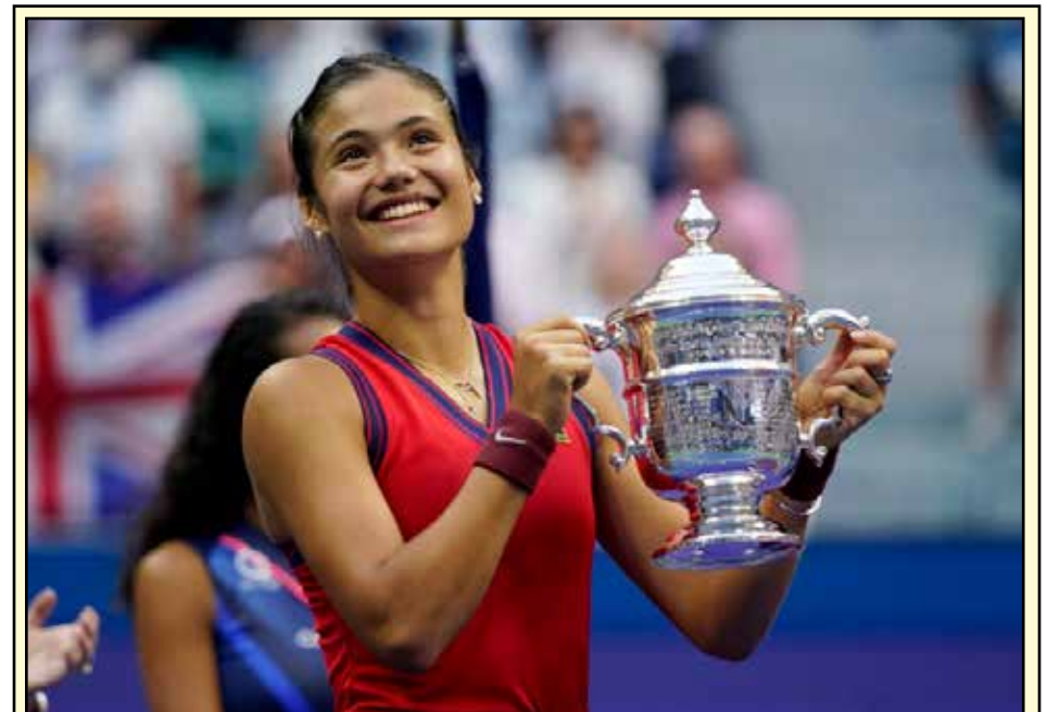
JUST CHAMPION: Emma Raducanu with her US Open trophy on Saturday

EMMA RADUCANU admits she was dreaming of becoming US Open champion long before she made it come true.