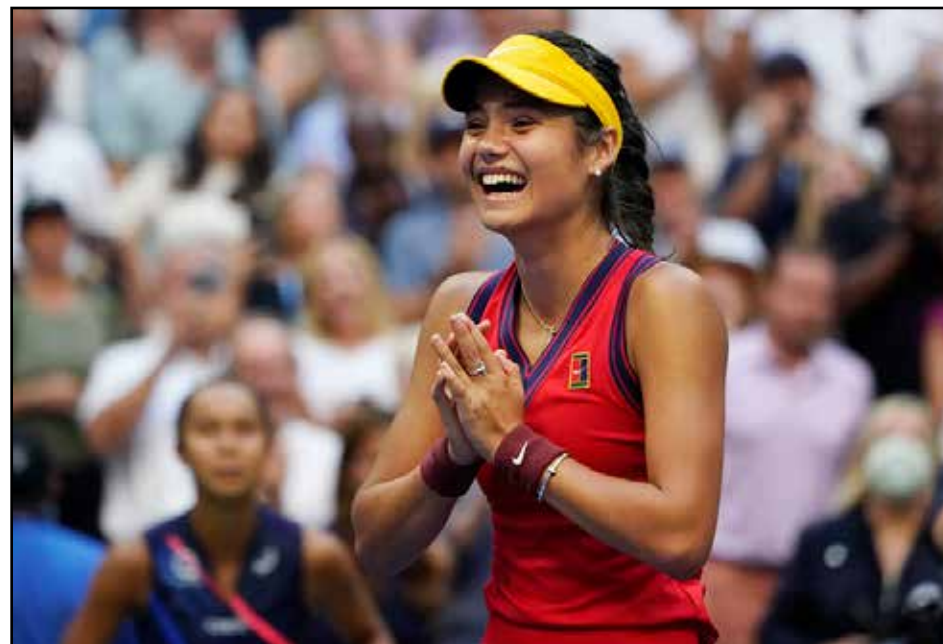
THE NATION'S SWEETHEART: 18 year old Emma Raducanu, who was ranked 150th in the world just two weeks ago, won the US Open tennis title on Saturday,

And by the end of an injury-free career she could even be worth a mind-blowing billion dollars – thanks to her sporting talent, unique