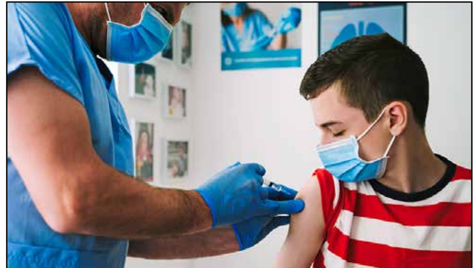
STICKING POINT: British youngsters will be able to have the final say on whether they receive the vaccine even if their parents refuse consent