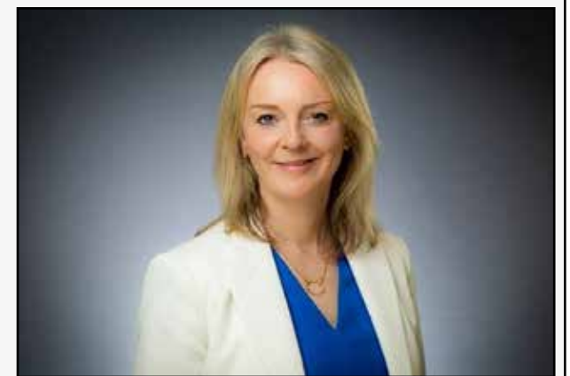
LIZ TRUSS: first Tory female Foreign Secretary

He told voters: "The Cabinet I have appointed today will work tirelessly to unite and level up the whole country. We will build back better from the pandemic and deliver