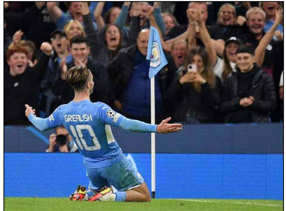
BEDDING IN NICELY: Jack Grealish scored a spectacular goal for City on Wednesday as they won a thrilling Champions League tie with RB Leipzig, 6-3

corner for Ake to score the first Englishman to debut since Wayne the game's opening both score and assist on Rooney in September goal, Grealish became their Champions League 2004.