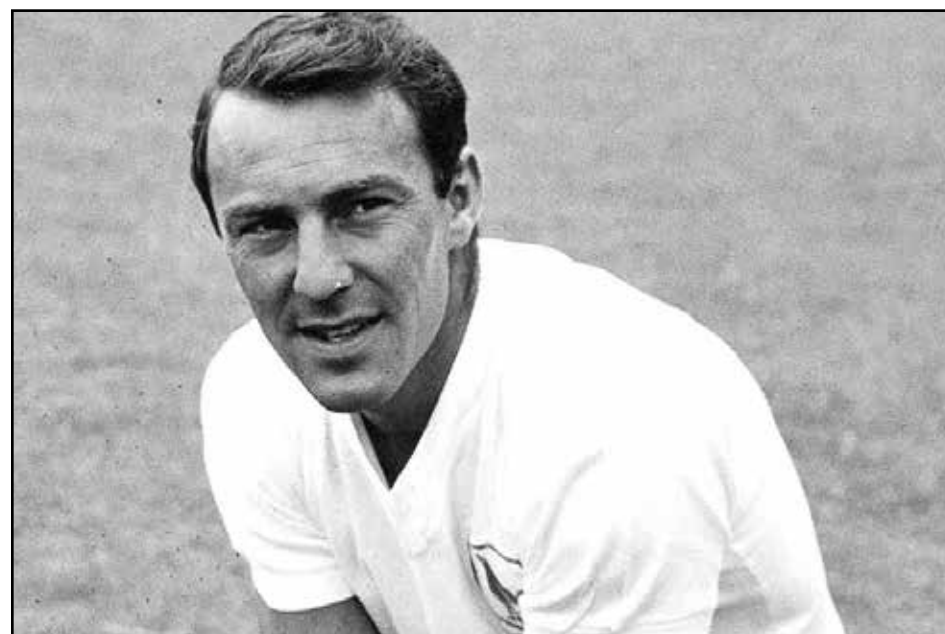
Greaves scored 266 goals in 379 games for Spurs

England manager Gareth Southgate confirmed that the Three Lions will put on a special tribute in their October internationals.