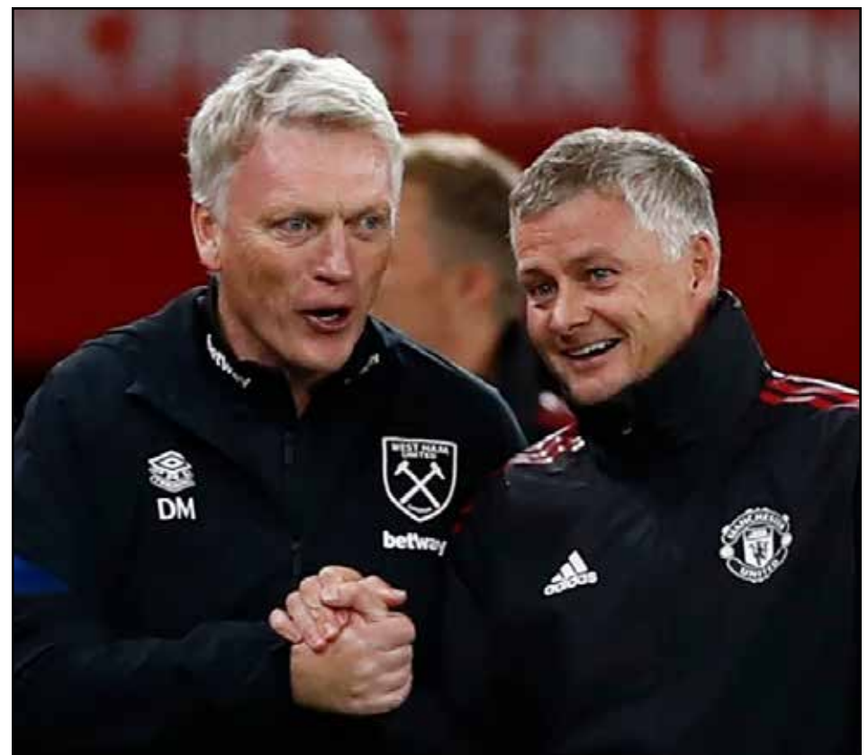
ALL SMILES: Moyes and Solskjaer on the touchline Wednesday night

United pushed for an equaliser after the