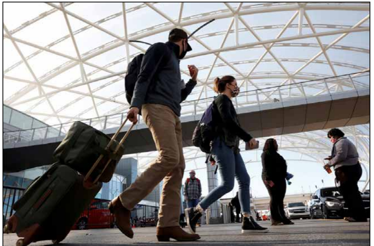
BOOM TIMES AHEAD? airline shares rose sharply on this week's news

rules came as a surprise to many, after the US government last week said it was not the right time to lift the restrictions.