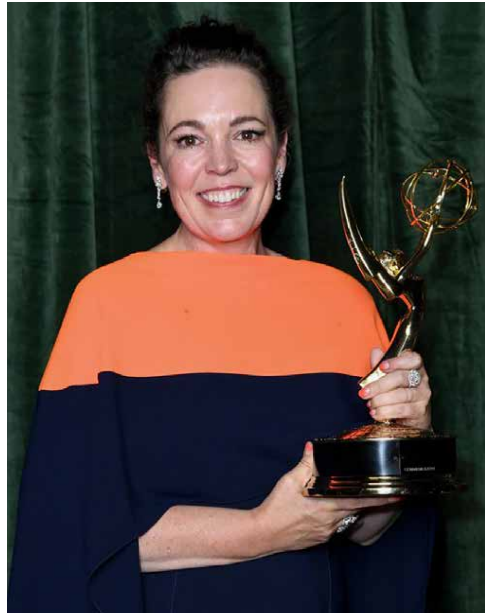
POPULAR CHOICES: Olivia Colman (above) took home the gong for Lead Actress for The Crown while (below), Jason Sudeikis got the nod for Ted Lasso

The Queen's Gambit took home Outstanding Limited Series.