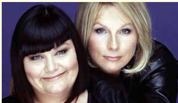
NATIONAL TREASURES: French and Saunders

But Vicar Of Dibley star Dawn admitted she would not be the most