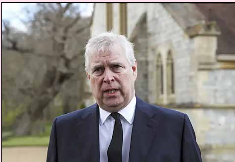
PRINCE ANDREW: the pressure continues to build