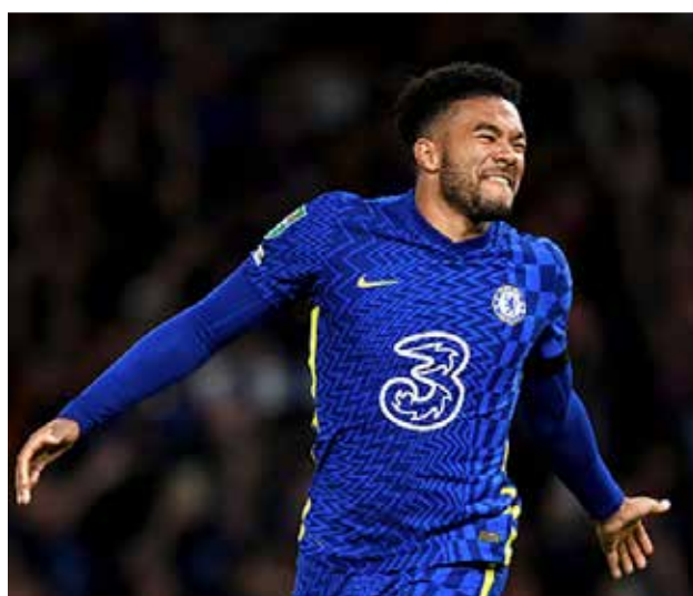
Breaking Villa hearts: Reece James

Buendia were on target for Villa but Chelsea's Kepa Arrizabalaga saved from Marvellous Nakamba, while Ashley Young crashed his shot against the bar.