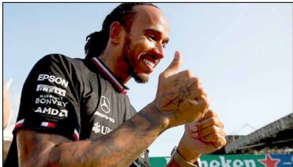
MASTER AT WORK: Hamilton produced an astonishing fight back in Brazil

"I cannot wait to meet the club's incredible supporters again and begin this new era for us all."