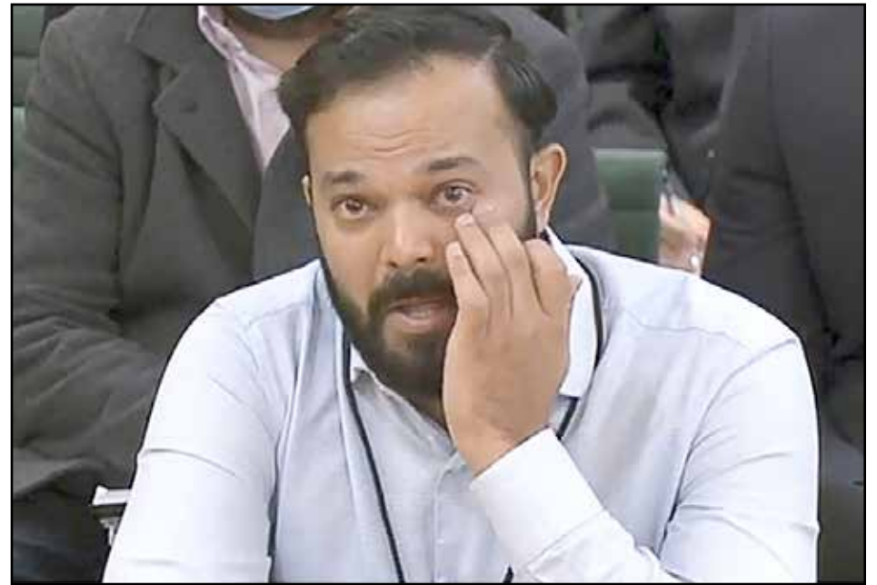
JUST NOT CRICKET? Rafiq said he would not want his son "anywhere near the game".

spinner Rafiq, who battled tears as he told MPs how he fought depression and thoughts of suicide, said he felt an element of "closure" after his appearance, but the same may not be true for those he has accused.