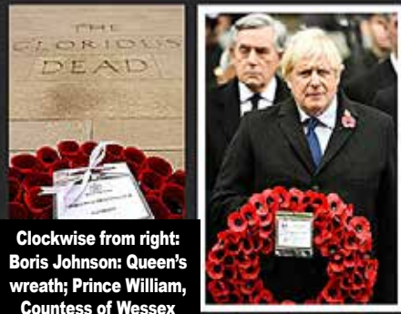
Clockwise from right: Boris Johnson: Queen's wreath; Prince William, Countess of Wessex