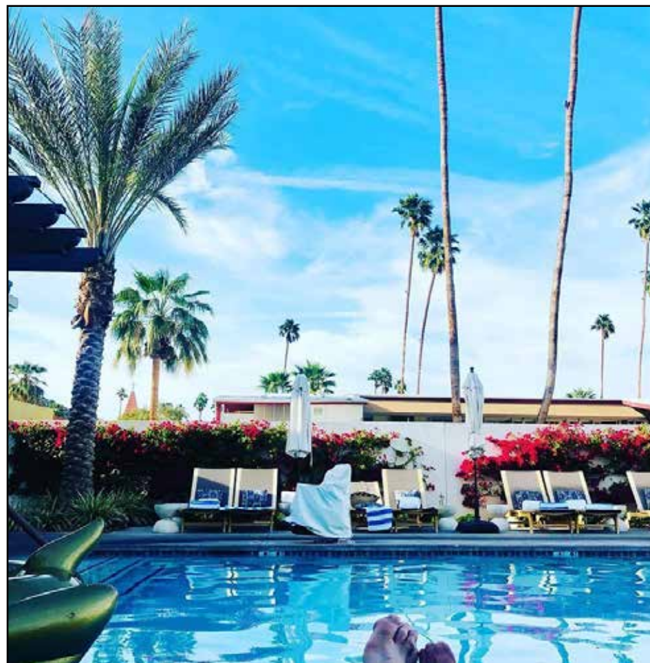
GOING SWIMMINGLY: another favorite local spot is Palm Springs, where La Serena Villas always provide some welcome R&R

There is always inspiration for places to visit found in shows like Californication, Entourage, Modern Family or Curb Your Enthusiasm. Whenever you visit or settle in LA, one thing's for sure is that all of these experiences are timeless in Los Angeles.