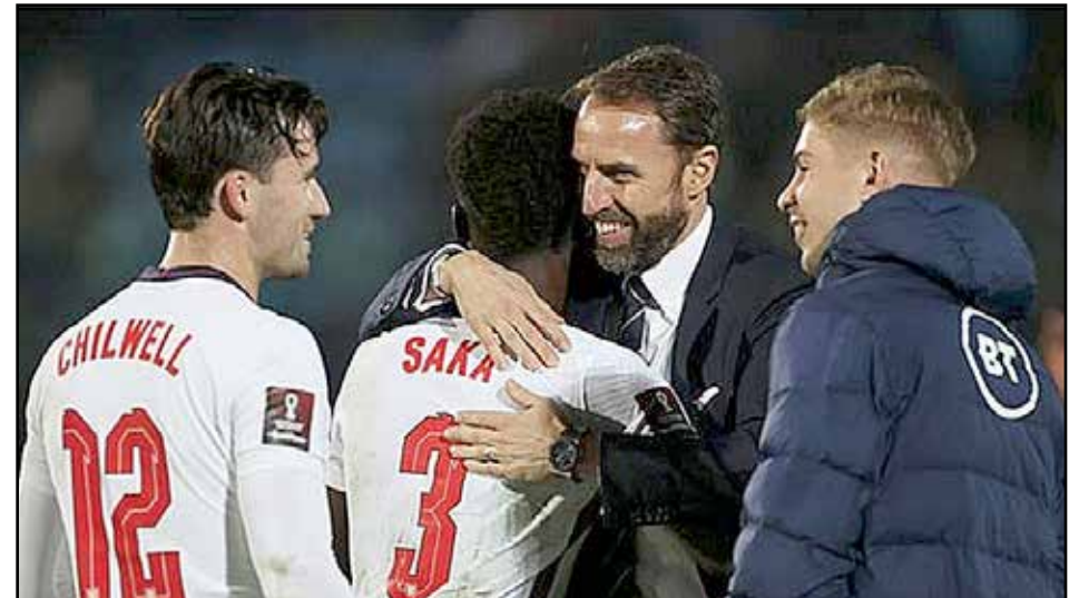
SAVORING THE MOMENT: England beat San Marino 10-0 on Monday

England's thrashing of San Marino, which saw Harry Kane score four first-half goals to move joint third in the scoring charts with Gary Lineker on 48, included debuts for Arsenal goalkeeper Aaron Ramsdale, 23, and Crystal Palace loanee