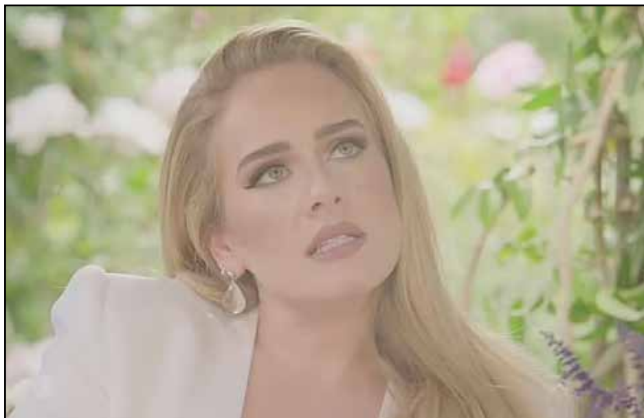
BOX OFFICE: Adele's sitdown with Oprah drew more viewers than this year's Oscars

'And no one really knows how he can live such an affluent lifestyle