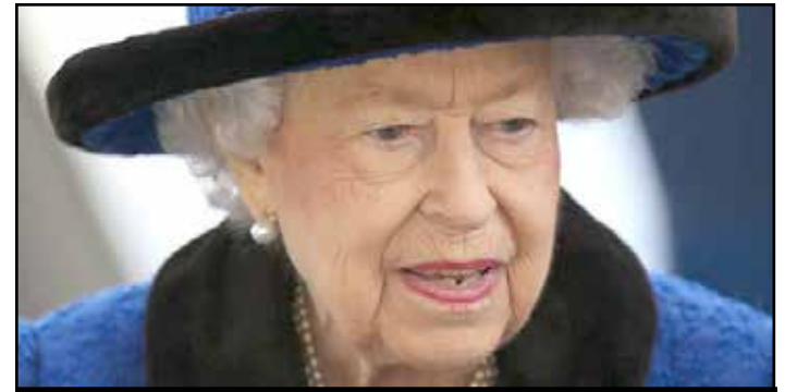
Queen back at work after missing Remembrance Sunday services - page 2