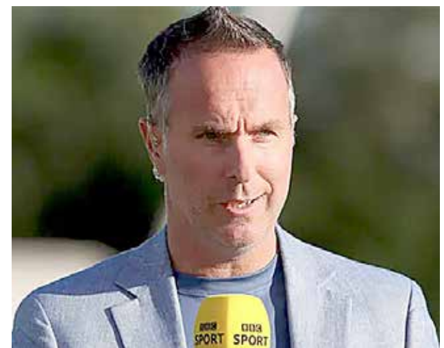
MICHAEL VAUGHAN: the former England captain denies allegations of racist remark

"As a result of Covid and travel restrictions BT Sport had made the decision to take our commentary feed from the Australian host broadcaster," a BT Sport spokesman