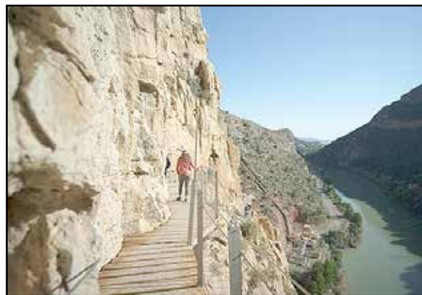
WATCH YOUR STEP: Sharon's hidden gem, the Caminito del Rey in Andalusia

and Gaitaneje falls. It was built early in the 20th century into a sheer cliff face to provide the transportation of materials, and to help facilitate inspection and maintenance of the channel. The walkway is just 3ft wide and rises over 330 feet above water. It was once considered one of the most dangerous routes in the world but these days it has been carefully restored. The views are unforgettable.