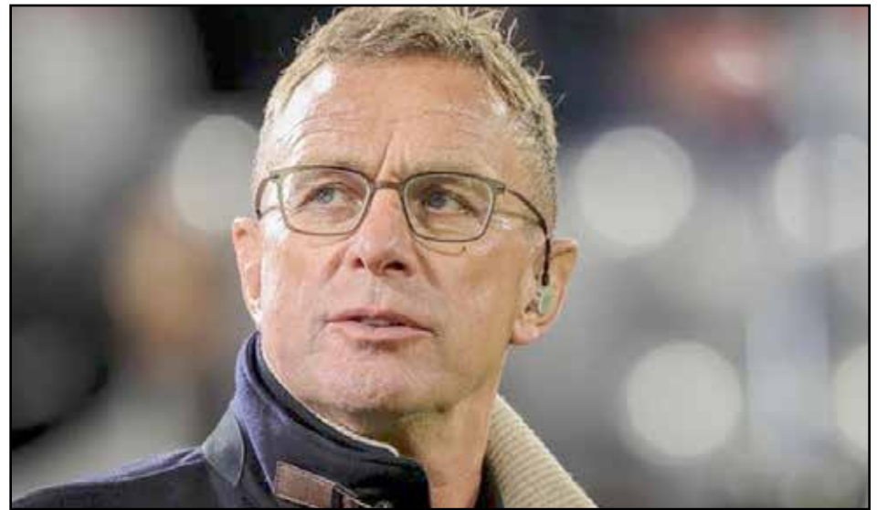
RANGNICK: another highly regarded German coach is coming to England

Carrick, Solskjaer's assistant, was in charge for the 2-0 win at Villarreal on Tuesday, a result that ensured they would finish top of