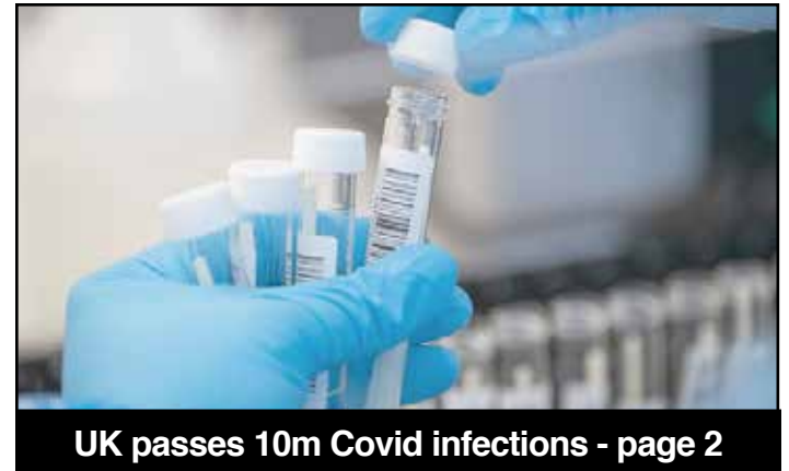
UK passes 10m Covid infections - page 2