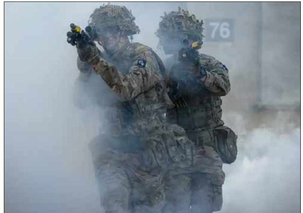
Under the new proposals, the strength of the regular army is to be reduced from 82,000 to 73,000 over the next four years

charged that the plans leave the fighting forces "too small, too thinly stretched, too poorly equipped".