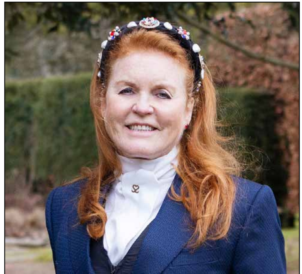
FERGIE: "If you leave the Royal Family, you can't have it both ways."

Princess Anne, 71, and husband Vice Admiral Sir Tim Laurence who were understood to be isolating at their Gloucestershire home after he tested positive for Covid.