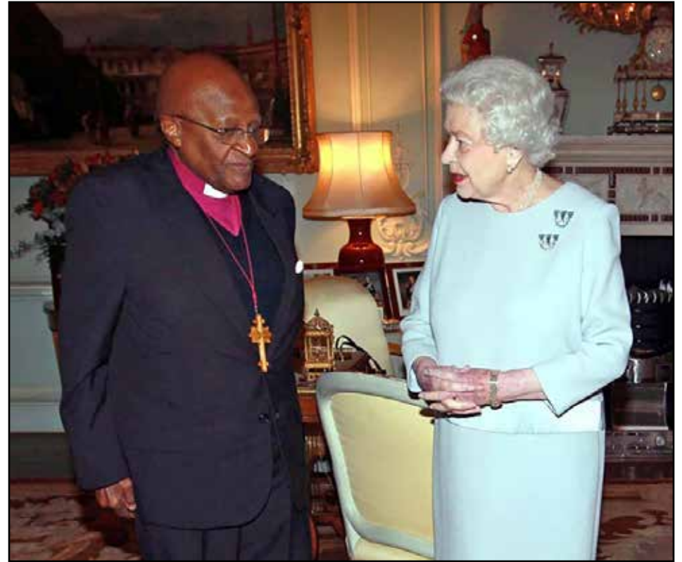
The Queen: "I am joined by the whole Royal Family in being deeply saddened by the news."

Justin Welby, the Archbishop of Canterbury, called him a "man of words and action". He said: "He was the rainbow leader. He didn't stick with one group. He defended the rights of LGBT people