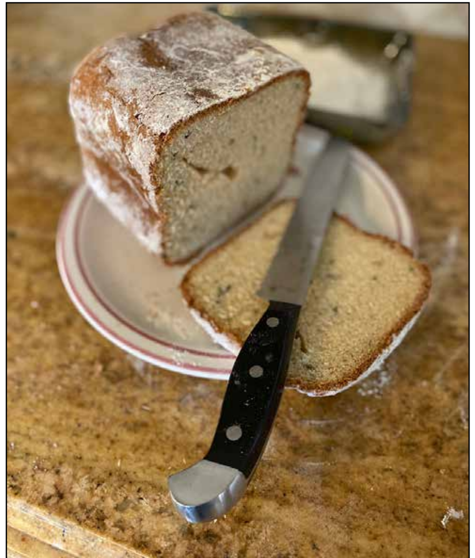
LET THEM EAT CAKE: works for me, actually

So with all of my recent postings telling everyone to be careful about COVID-19 I'm afraid to report - "well I only gone and blown the bloody doors off! and contracted it." We came into close contact with the virus via a house guest who had traveled