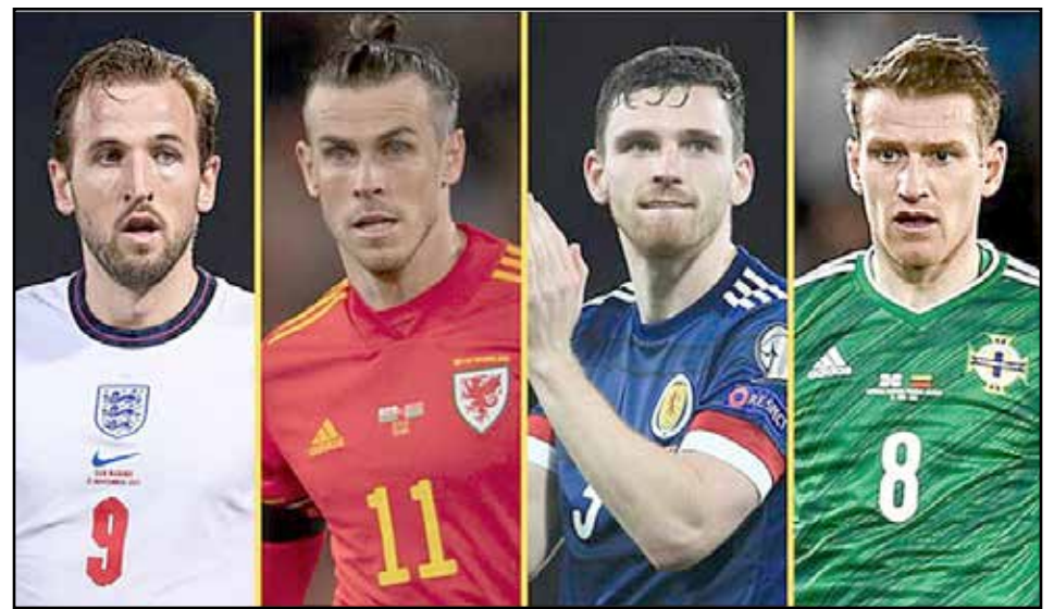
None of the home nations have been drawn together in the group stage

added: "They are exciting games. I think the Nations League format throws up these outstanding fixtures."