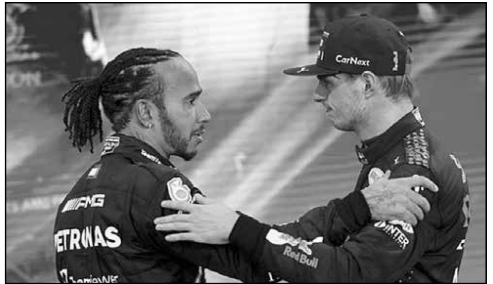
Hamilton congratulated Verstappen after his win on Sunday in Dubai

Mercedes constructors' championship trophy - which they have won