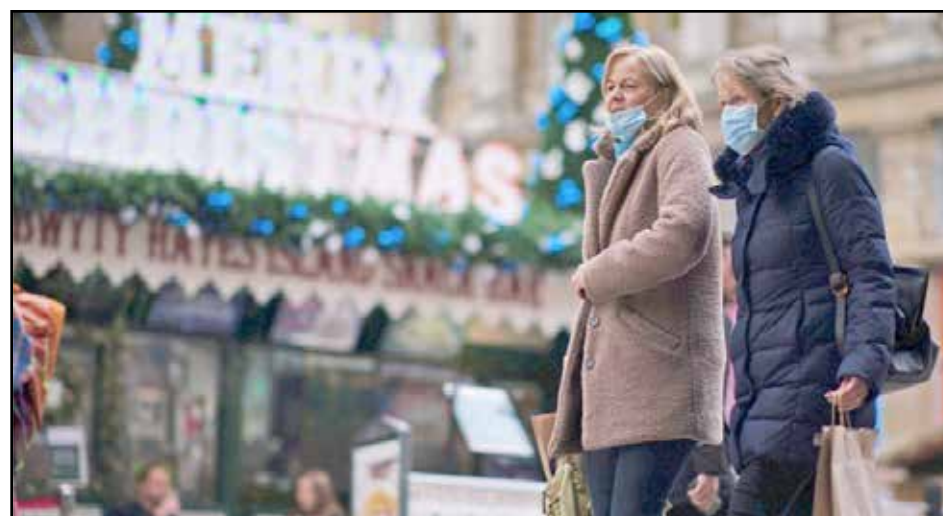
OUT AND ABOUT - FOR NOW: but almost 1m Britons are expected to be in quarantine by Christmas Day

Prof Whitty said "each six months will be better than the last six months"