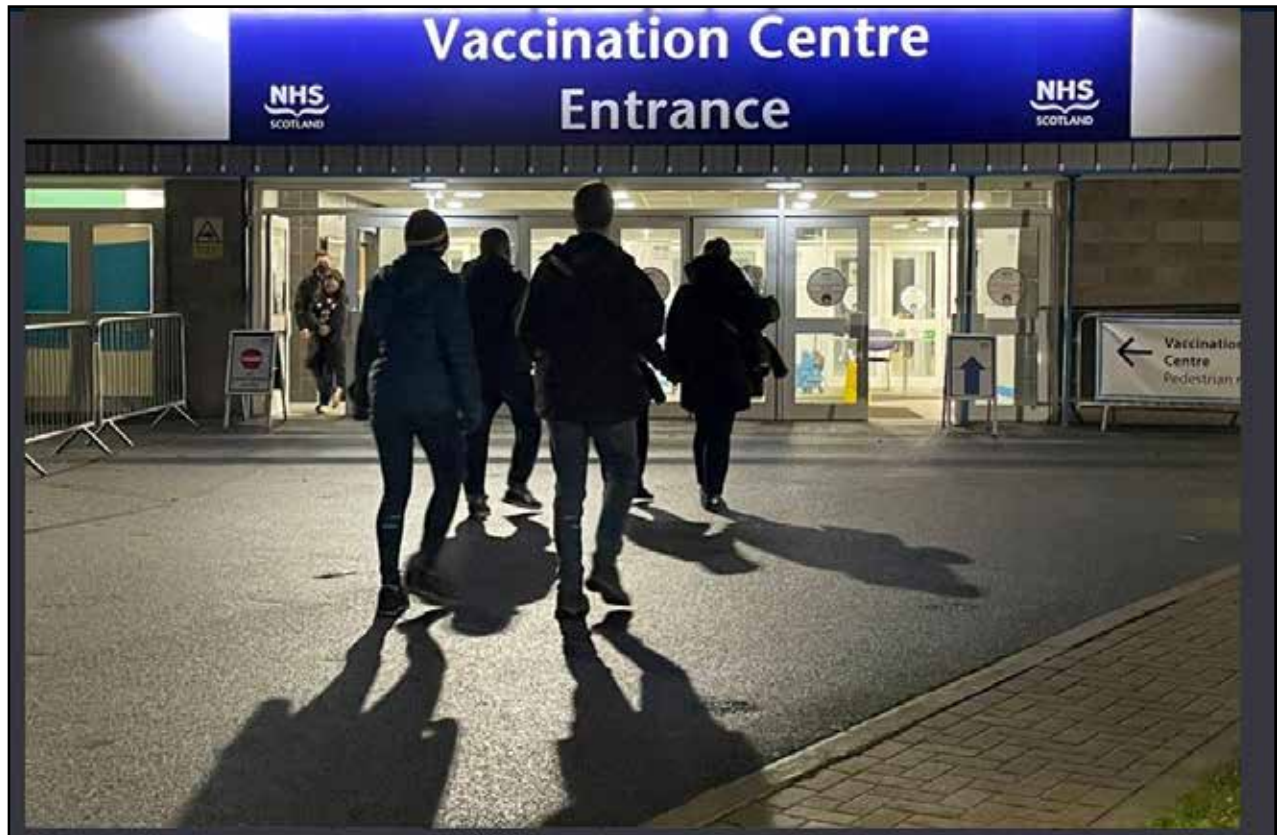
MIND THE GAP: there are long lines for booster shots at NHS office nationwide

Some people are unable to be vaccinated for medical reasons, such as those with severe allergies to all currently available jabs.