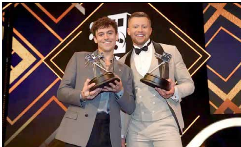
RUNNERS UP: Tom Daley (left) and Adam Peaty finished second and third

She paid tribute to her organisation's volunteers and insisted that "whatever happens, have hope".