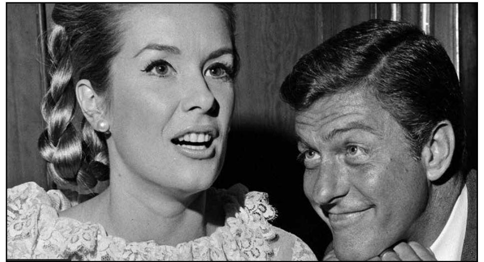
TRULY SCRUMPTIOUS: Sally Ann Howes with Dick Van Dyke on the set of Chitty Chitty Bang Bang

Later, in Chitty Chitty Bang Bang she played the daughter of a confectionery magnate, performing classic songs including Toot