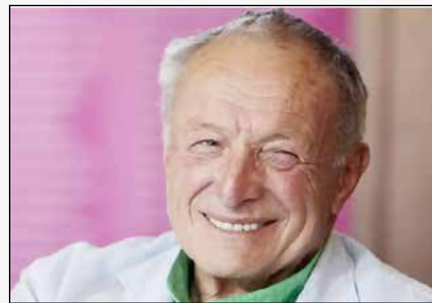
RICHARD ROGERS: changed the London skyline

Fellow architect, Norman Foster, described Rogers, as a "kindred spirit" whose buildings are "a social mirror" of his personality - "open, welcoming and, like his wardrobe, elegantly colourful". Foster, who studied alongside Rogers at Yale, would go on