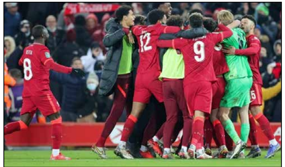
JUBILATION: the scene at Anfield after Jota's decisive penalty

Soyuncu's exit was the trigger for Liverpool