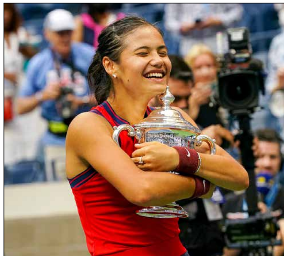
IT WAS A VERY GOOD YEAR: Emma Raducanu with her US Open trophy

While there were loud rounds of applause inside the Salford Media City studio, the ceremony was completed without a studio audience, after BBC producers took the decision to impose Covid precautions a week