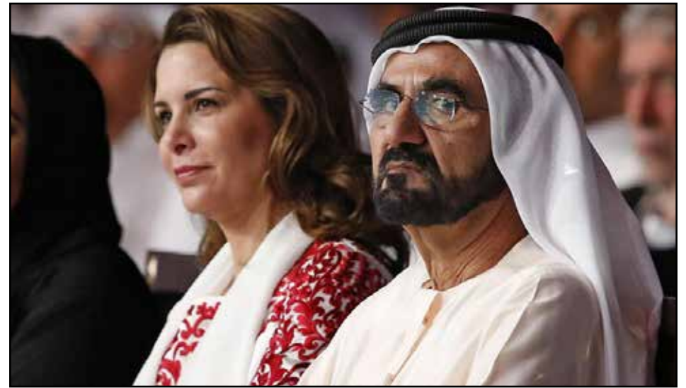
THAT'S RICH: Princess Haya and Sheikh Mohammed bin Rashid al-Maktoum

Giving evidence, the princess admitted she had taken money from one of her children's bank accounts to 'pay off' a