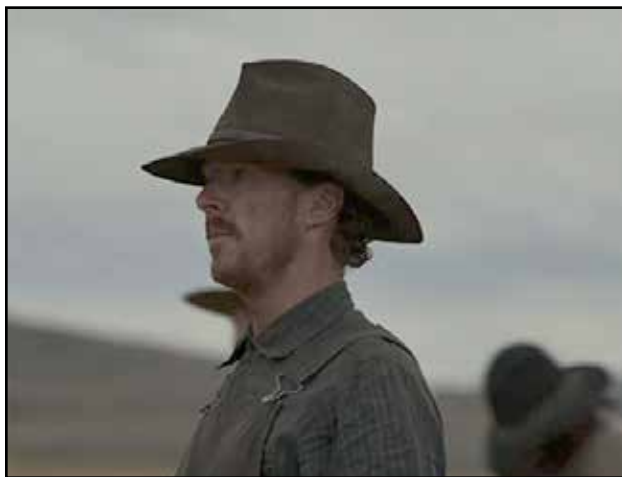
DOGGONE BAD: Cumberbatch in Power of the Dog

They are both nominated alongside fellow Brit Garfield for his