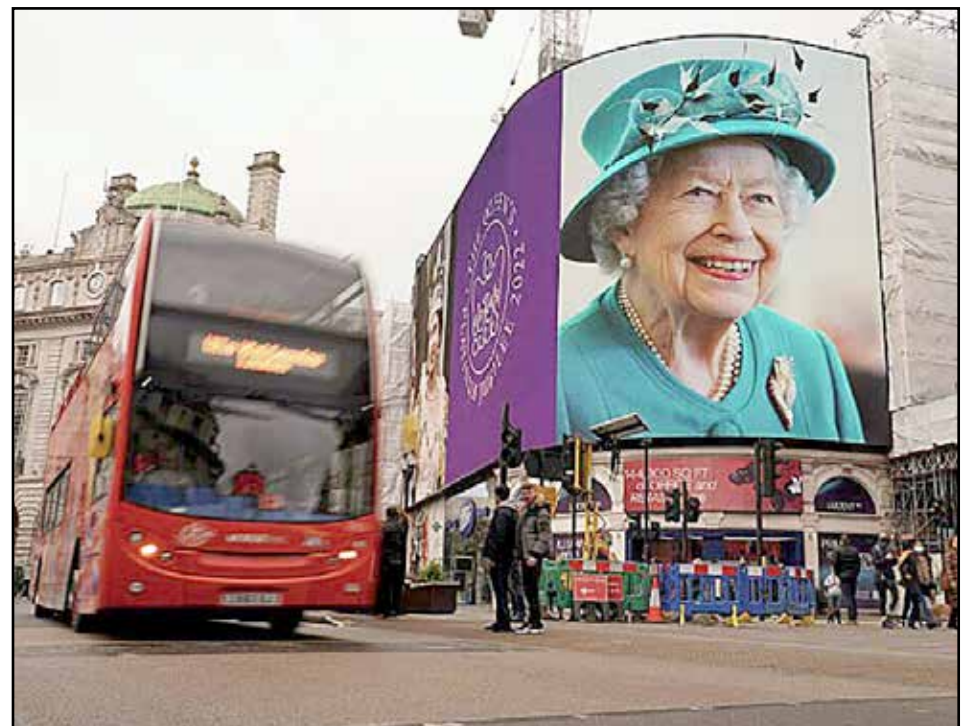
SEEN IN PICCADILLY: a beaming image of the Queen as she celebrated 70 years on the throne on Sunday

Sources said the Queen had decided to use her message to pass on all the wisdom and experience of her 70 years on the throne. One said: “This is her saying with all that experience of seeing the support that she received from the Duke of Edinburgh and how her mother supported her father, she thinks the