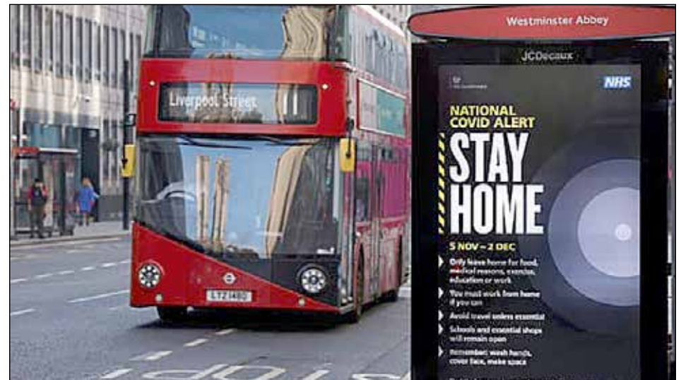
GOODBYE TO ALL THAT? the scheduled end of restrictions will be 703 days since UK lockdowns began on March 23 2020.

A further 68,214 UK infections were recorded on Monday, taking the