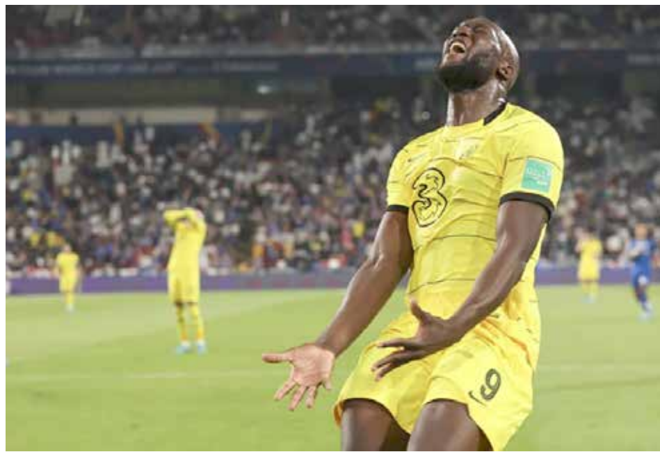
WORTH A SHOUT: despite scoring the only goal of the game, Romelu Lukaku was vocal about the poor service he received from teammates

Chelsea will meet Brazilian side Palmeiras in the Club World Cup final after edging past Al-Hilal at the Mohamed bin Zayed Stadium in Abu Dhabi on Wednesday.