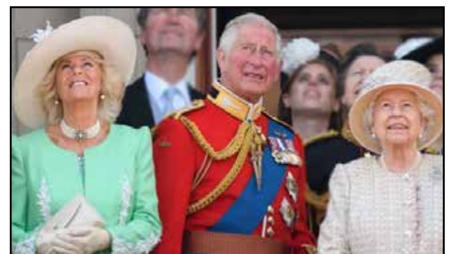
LOOKING UP: but the subject of Camilla's future title remains controversial for most Britons

Elizabeth ascended the throne aged 25 following the death of her father King George VI on