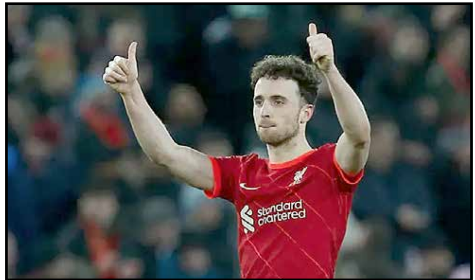
BRACE YOURSELF: Jota scored either side of half time

If the Colombian needs any inspiration from a new signing at Liverpool, he needs to look no further than Jota, who has