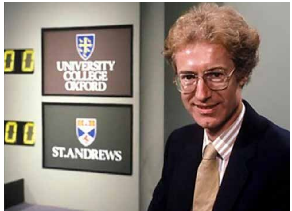
BRITISH ORIGINAL: Gascoigne was famous for his catchphrases, including "Fingers on buzzers", "I'll have to hurry you" and "Your starter for 10".

Sherlock actor Mark Gatiss, who portrayed Bamber in the 2006 film Starter For 10, said: "Very sorry to hear that Bamber