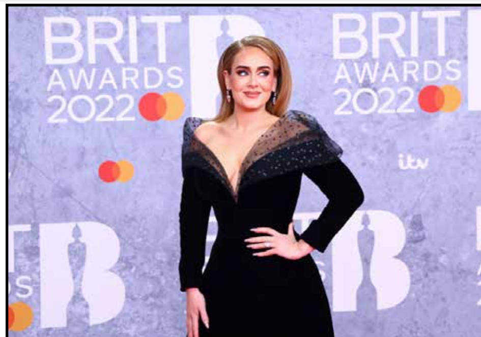
SPARKLING FORM: Adele's sizeable engagement ring was on full display as she posed on the red carpet ahead of Sunday's Brit Awards in London

The singer, 33, looked incredible in a classy black frock with a plunging chest. But it