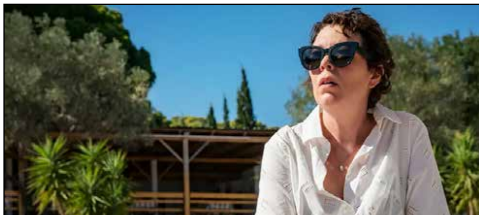
Olivia Colman: best actress nomination for The Lost Daughter