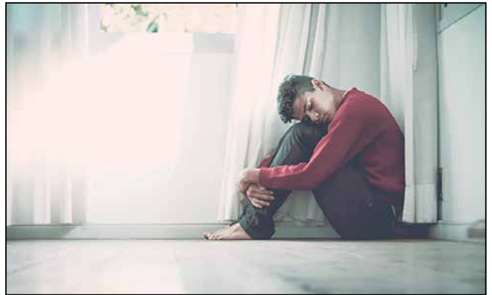
ALMOST AN EPIDEMIC: Mental health issues among white men have grown alarmingly in recent years...but there is help out there

Now back to the 19year-old kid in a bathtub - putting his head under the water and holding his breath for as long as he can - not for sport but to numb the unexplainable pain or void. I mean it all reeks