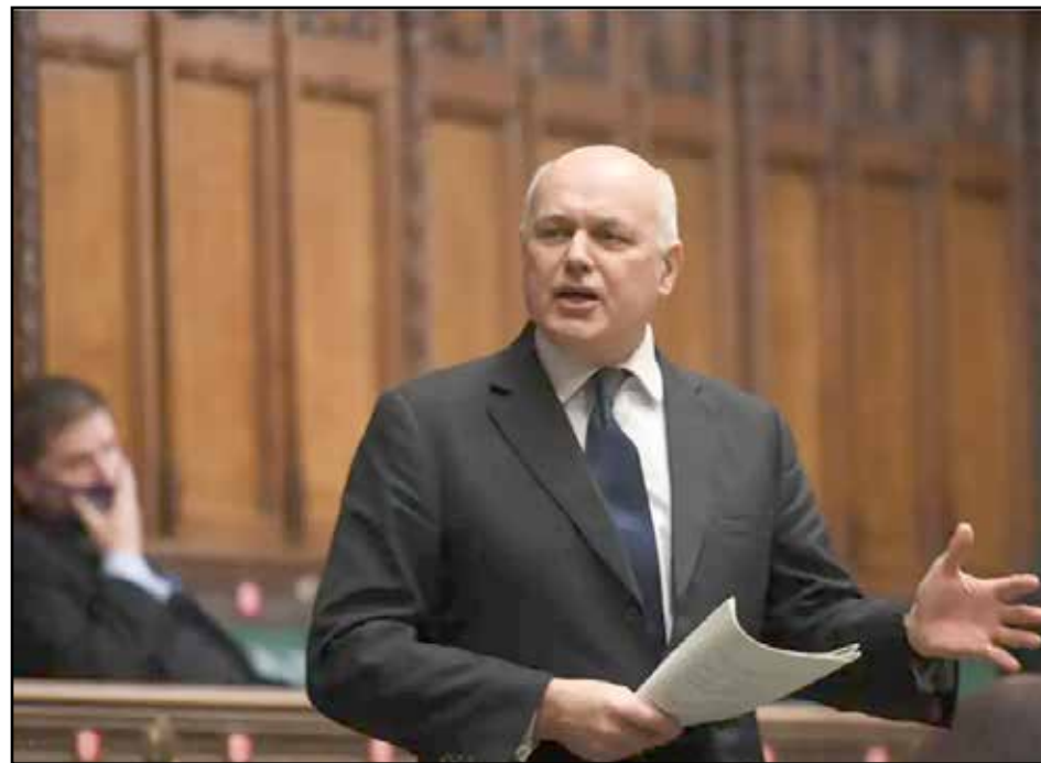
Duncan Smith: “I am not particularly in favour of plunging us into the mess of votes of no confidence, followed by leadership elections.”

He vowed that he and his “darling wife” would follow the example of the Queen’s life of duty during a future reign as King and Queen Consort.