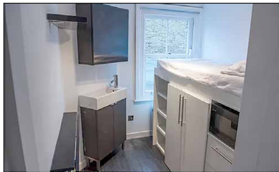
LIVING SMALL: The property, in a Victorian conversion in Lower Clapton, East London, has a bed, microwave, bathroom and an incumbent tenant

The auction minimum is well below the average deposit for first-time buyers in London, which Halifax calculated at £130,357 in 2020, but Neal Hudson, a London housing analyst, warned that first-time buyers should be aware it is not sustainable to live in a tiny flat long-term and that if they are unable to sell they could find themselves stuck.