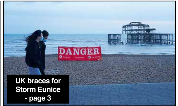
UK braces for Storm Eunice - page 3