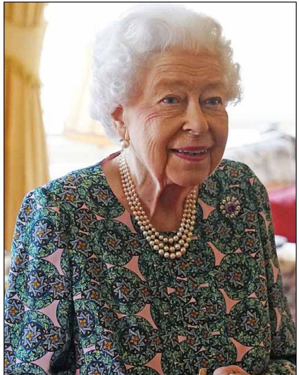
The Queen recently stripped Andrew of all his Royal roles

It read: "Virginia Giuffre and Prince Andrew have reached an