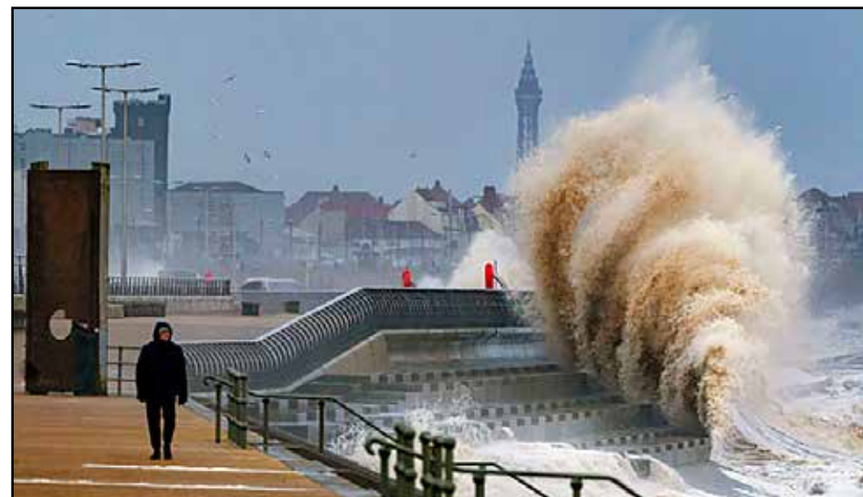
BLEAK UP NORTH? the seafront at Blackpool as Eunice approached on Thursday

All Welsh train services were suspended for Friday and Network Rail said disruption across the wider network was