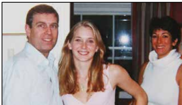
DAMNED BY THE PHOTO: Andrew has always claimed he has no memory of meeting Virginia Giuffre

out of court settlement. "The parties will file a stipulated dismissal upon Ms Giuffre's receipt of the settlement (the sum of which is not being disclosed). Prince