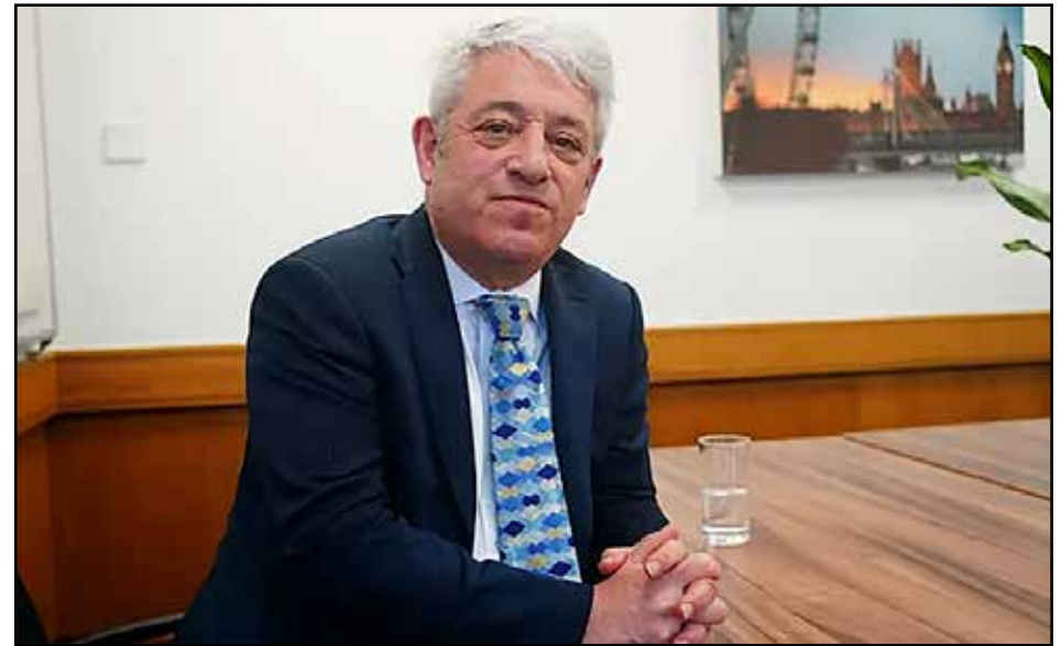
JOHN BERCOW: damning indictment of the former Speaker of the House

"His evidence in the investigations, the findings of the commissioner, and his submissions to us, show also that the respondent has been a serial liar."