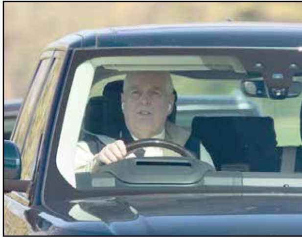
ON HIS WAY OUT: Prince Andrew leaving Windsor

paedophile financier three times when she was Jeffrey Epstein ordered her 17. The Prince vehemently denied her claims.