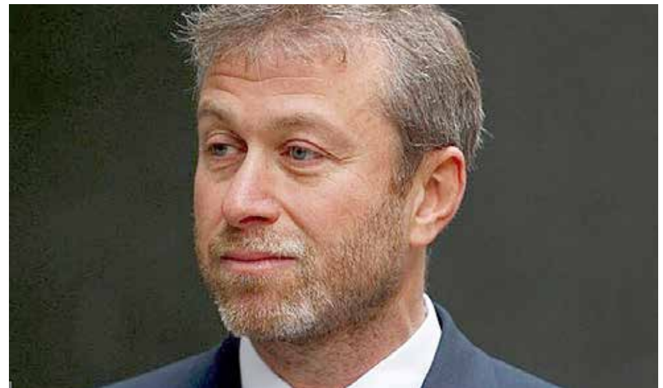
FALL OF THE ROMAN EMPIRE? Abramovich's closeness to Vladimir Putin is finally costing him dearly

Mr Abramovich, 55, is alleged to have strong