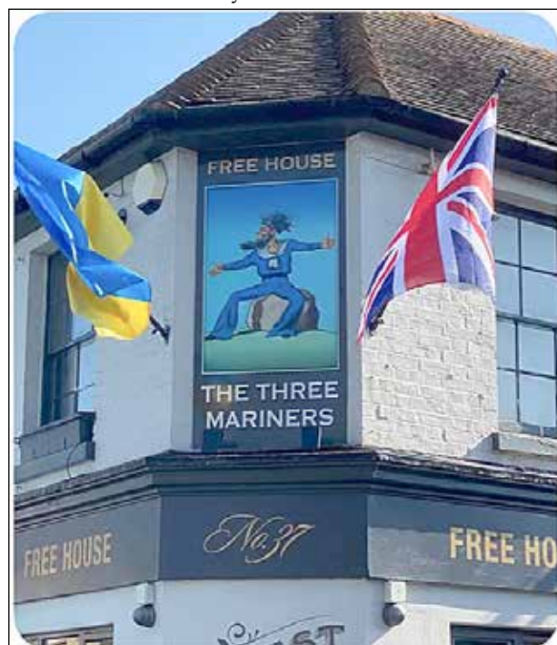
CLASSIC WATERING HOLE: The Three Mariners in Hythe, Kent

Ye Olde King's Head, 116 Santa Monica Blvd. Santa Monica CA 90401 • Tel: 310-451-1402