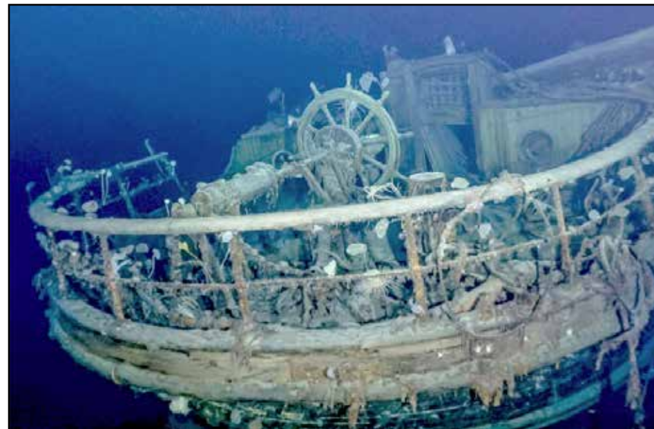
ENDURANCE: the historical ship's wheel and taffrail are clearly visible in this remarkable image from 10,000 feet under the Weddell Sea