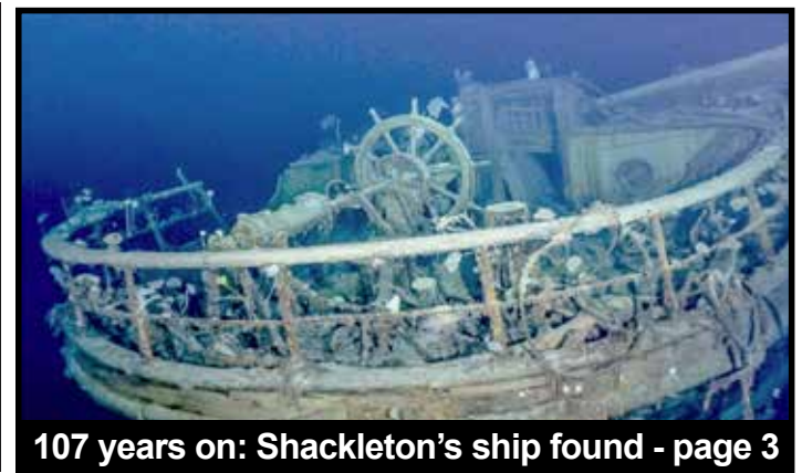
107 years on: Shackleton's ship found - page 3