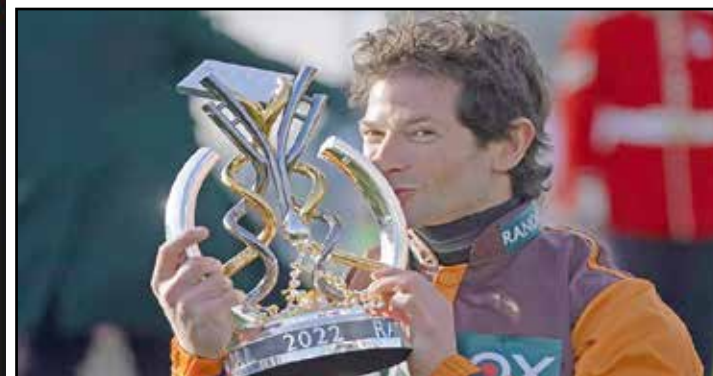
50-1 outsider wins Grand National - page 5

California's British Accent™ - Since 1984