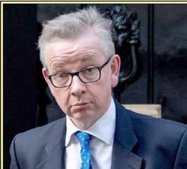
TARGETED: Tory MP Michael Gove