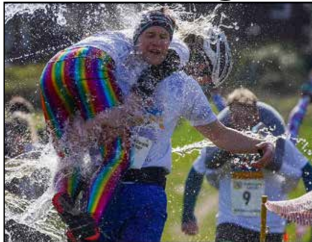
Heavy going: The pastime dates back nearly 900 years

All "wives" had to weigh at least 50kg – just under 8st – with anyone lighter wearing a rucksack with