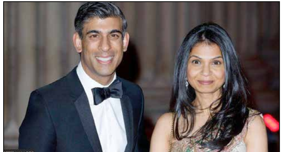
GOLDEN COUPLE NO MORE: Rishi Sunak and Akshata Murty

The result is that many of the wealthiest families living in the UK are not contributing to direct taxation in the UK. The claim is that the system is still useful because these people tend to contribute indirectly, maintaining a small army of servants and service providers, who themselves pay income tax. Non-doms may also pay VAT on