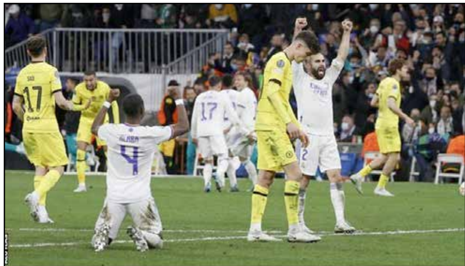
REAL JOY at the Bernebeu....but it was misery for Chelsea

In the end Chelsea, who played superbly, were made to pay for their first-leg performance as Tuchel's side fell just short of producing one of the great comebacks in the competition.