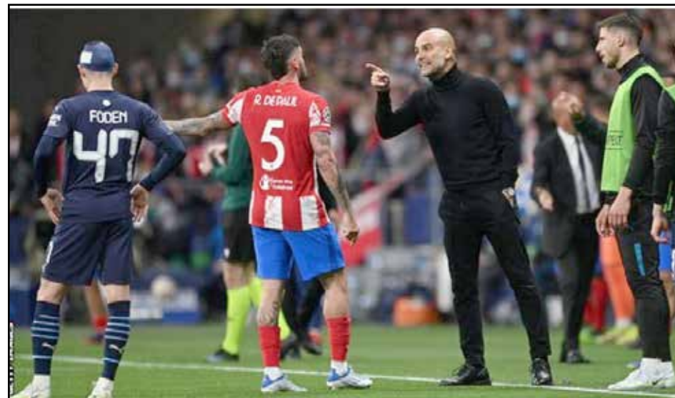
TOUCHLINE CLASH: Wednesday's explosive encounter in Madrid has come at a big cost to City, claims Guardiola

Spain and they played with energy and, in the second half, were better than us and we were lucky we didn't concede. In the first half we had chances, overall we are in the semi-finals - it is well deserved.