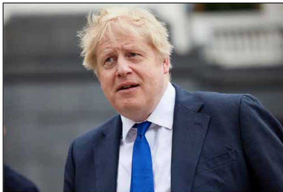
BORIS JOHNSON: he’s been a very naughty boy

“But clearly once it became obvious what had been happening, the types of behaviour that unfortunately sadly we’d