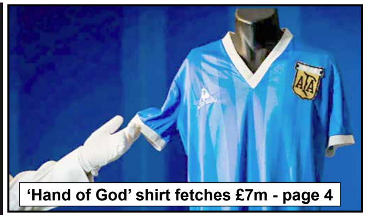
'Hand of God' shirt fetches £7m - page 4