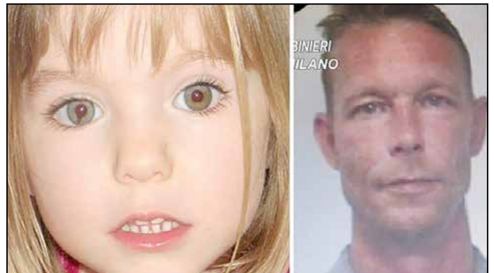
According to unconfirmed reports, Christian Brueckner's van contained fibers from Madeleine McCann's pajamas

German rapist and paedophile Brueckner, 45, who is currently jailed in his home country, was named the prime suspect in 2020. Inquiries revealed he was close to