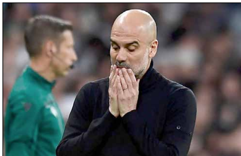
DARKNESS DESCENDS: Guardiola ponders the loss of an epic semi-final

"We didn't play our best, but it is normal, a semi-final, the players feel the pressure and wanting to do it. Football