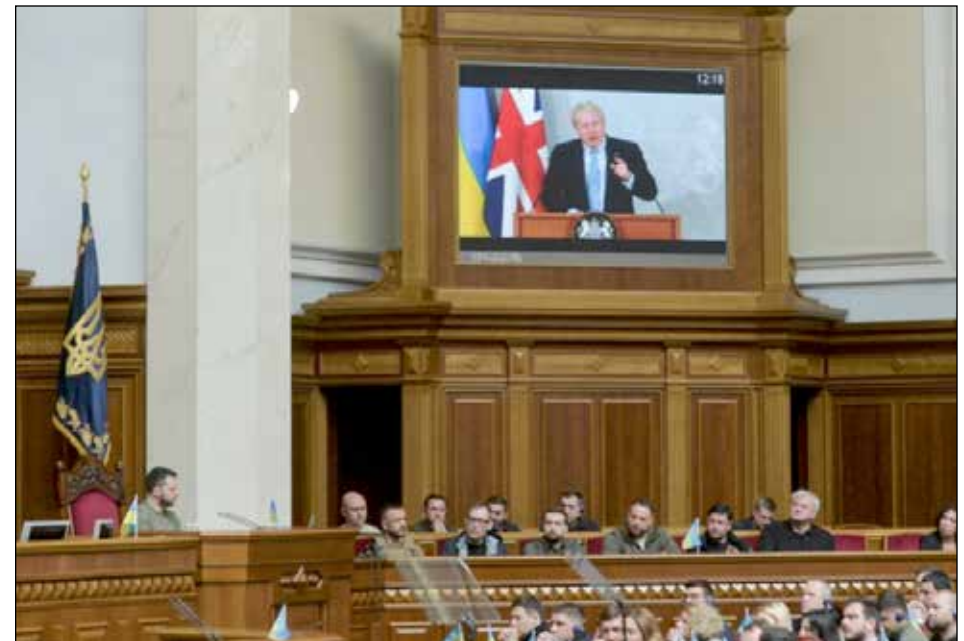
The Prime Minister addressed Ukrainian legislators via video link on Monday

finest hour, that will be remembered and recounted for generations to come."