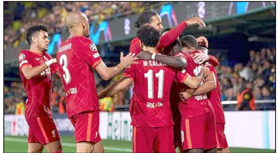
Liverpool clinched their Champions League final spot on Tuesday night, coming from two goals down to beat Villareal, 3-2 in Spain

About 23,000 seats will be available to national associations, commercial partners, broadcasters, and Uefa's official