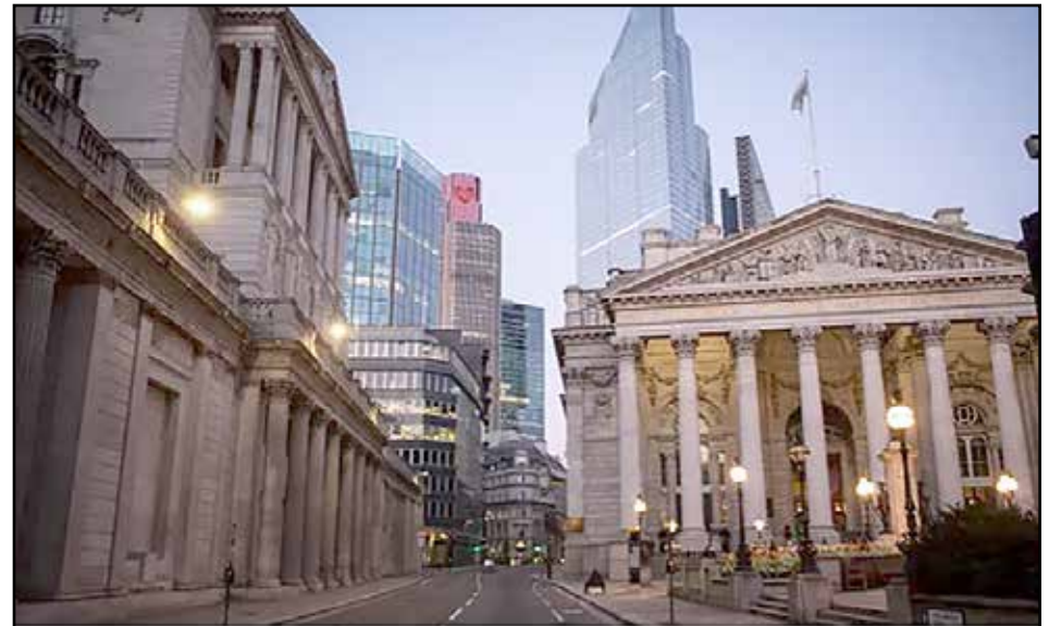
Darker skies approaching: dusk on Threadneedle Street

expecting to take a drubbing in the polls, Labour and opposition parties called on the government to drastically rethink its support measures for hard-pressed families as