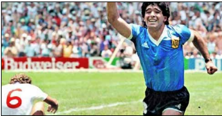
PRICE OF HISTORY: Maradona's shirt is "a reminder of an important moment not only in the history of sports, but in the history of the 20th century"

England midfielder Steve Hodge, who unintentionally flicked the ball to Maradona in the build-up to the memorable opener, swapped shirts with his rival after the game