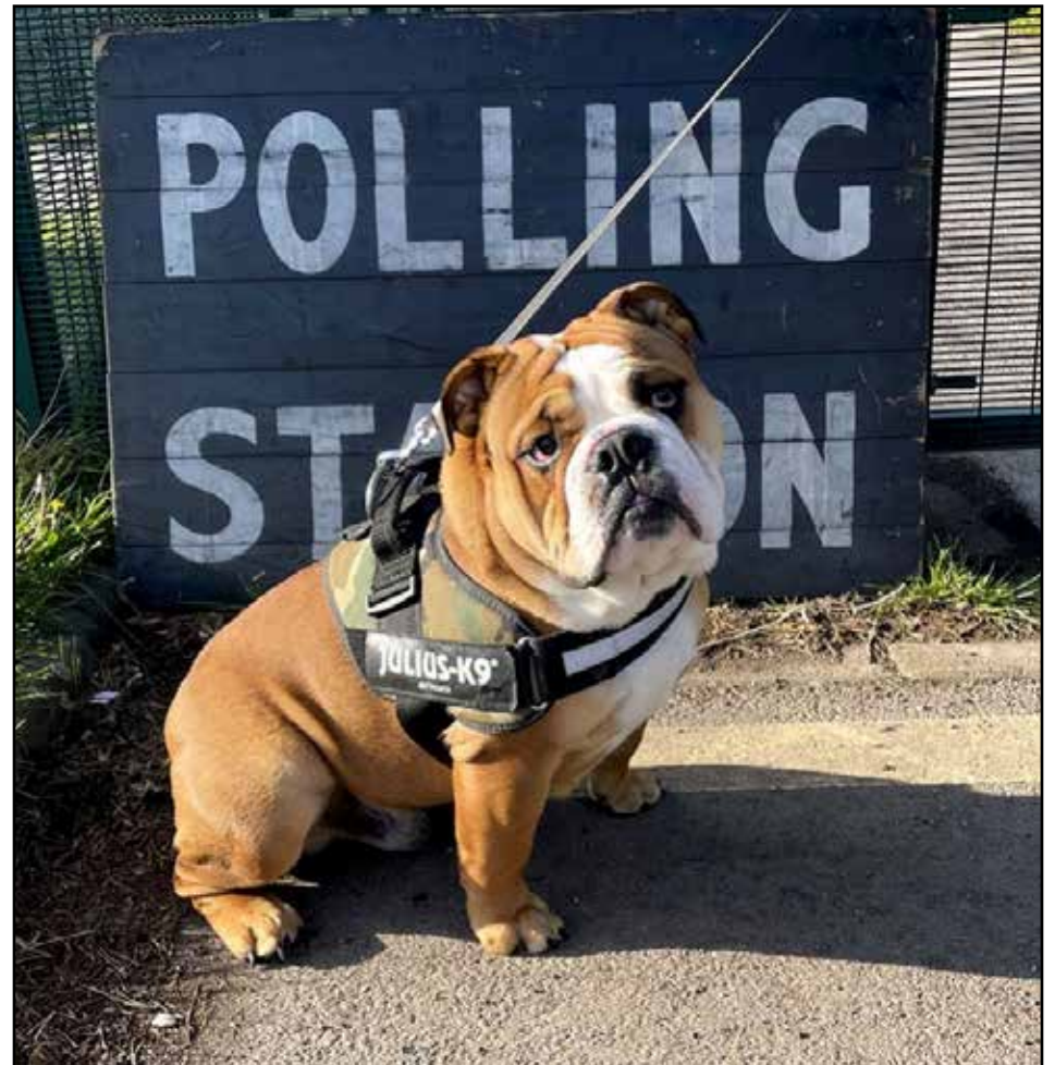
FOREVER ENGLISH: photos of dogs at polling stations are a tradition in Britain, although this bulldog, captured on Thursday, remained unimpressed

Labour also hopes to make progress in south Wales, where