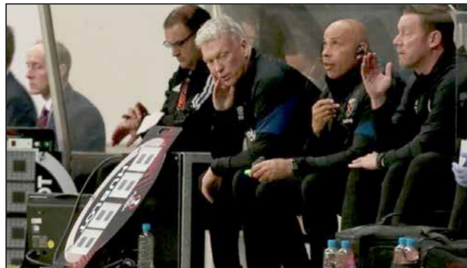
DISMAL NIGHT: David Moyes and Aaron Cresswell were both red carded in West Ham's Europa League semi-final loss on Thursday in Frankfurt

"We are gutted in there. We have come so far as a group. "We had genuine belief