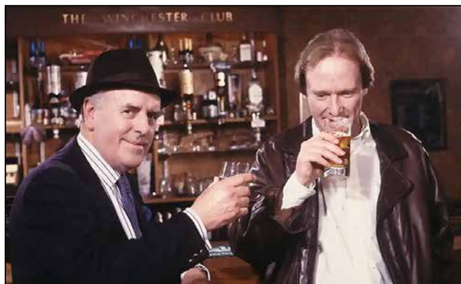
ICONIC ROLES: Waterman with John Thaw (top), in a 1977 episode of The Sweeney and (above) in 1985 as Terry McCann with the serially dishonest Arthur Daley (George Cole) in Minder