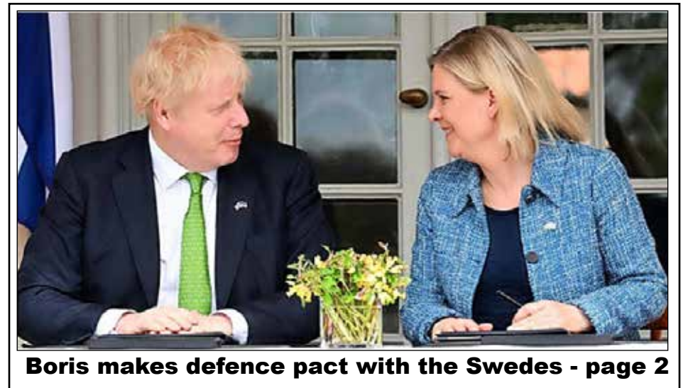
Boris makes defence pact with the Swedes - page 2

and murder rates in the capital, while eco-campaigners pointed out the hypocrisy in Mr Khan pleading for international tourists while being quick to praise his own green credentials as mayor.