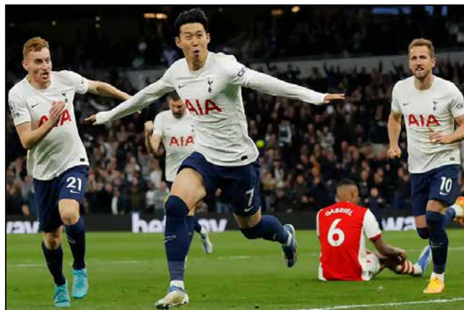
NICE ONE, SON: Son Heung-min celebrates Tottenham's third goal in their pulsating victory over Arsenal on Thursday night

Mikel Arteta's side were never given the chance to settle and once Kane put Spurs ahead it was all downhill, with Holding's needless sending-off making an