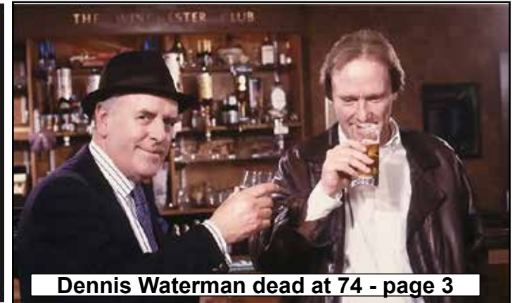
Dennis Waterman dead at 74 - page 3

California's British Accent™ - Since 1984