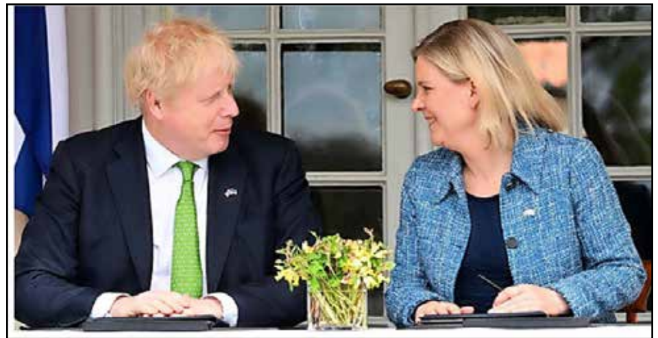
GROWING CLOSER: Boris Johnson and Swedish prime minister Magdalena Andersson signed mutual security agreements on Wednesday

Speaking earlier alongside Andersson in Harpsund, the Swedish prime ministerial country retreat, Johnson said: "The war in Ukraine is