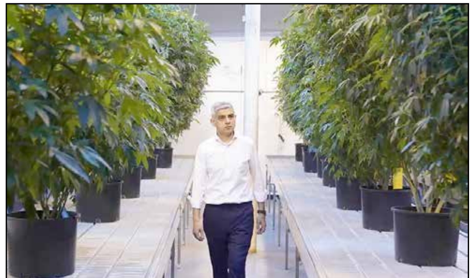
GOING TO POT? Khan says panel of experts will consider effectiveness of UK policies on non-class A drugs, with a view towards possible legalization of marijuana

But Khan's tour has not gone down well with many of his own constituents. He suffered a serious backlash from