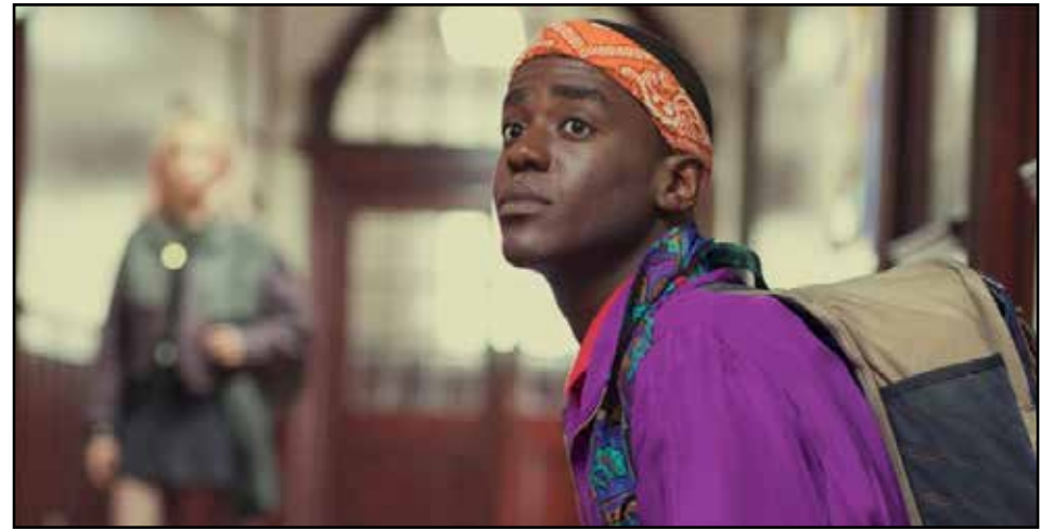
Showrunner Russell T Davies said the Gatwa impressed him in a "blazing" audition

"Doctor Who, like so many programmes, is eager to win back some of those younger viewers, so the sheer interest from someone like him being involved is going to help with that."