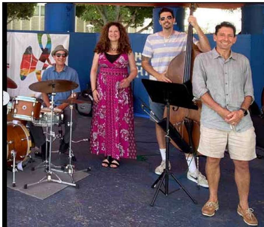
ISN'T IT ROMANTIC: Local jazz band Corcovado specialize in the music of Antonio Carlos Jobim and classics from the great American songbook