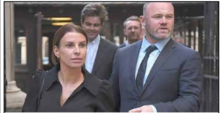
Wagatha Christie trial comes to a close - page 3

California's British Accent™ - Since 1984