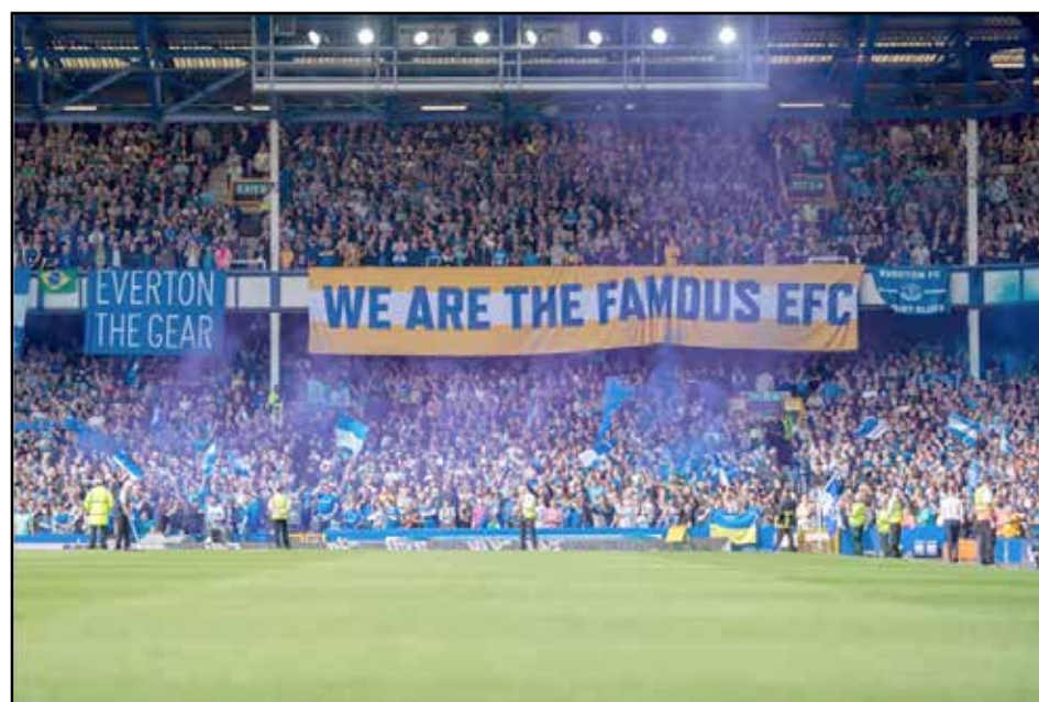
The atmosphere was feverish at Goodison's famed Gwladys Street end on Thursday - and everywhere else in the stadium, too

The party started at the final whistle, with thousands of fans flooding onto the pitch, letting off more smoke