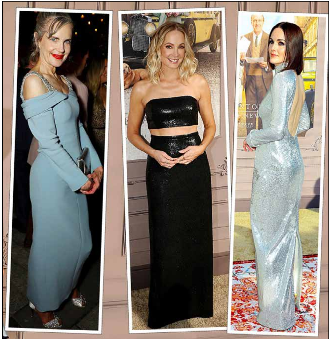
POSH FROCKS: Elizabeth McGovern, Joanne Froggatt and Michelle Dockery cast off their upstairs/downstairs differences with dazzling dresses at the New York Premiere at the Met on Sunday

In the sequel to the 2019 smash-hit first film, the Crawley family head to the South of France to uncover a mystery at a villa bestowed to the Dowager Countess of Grantham, played by Dame Maggie Smith.