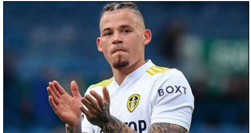
Calvin Phillips: natural replacement for Fernandinho?

Manager Pep Guardiola has identified Phillips as the ideal replacement for Brazil midfielder Fernandinho, who is leaving at the end of this season after nine years at the club.