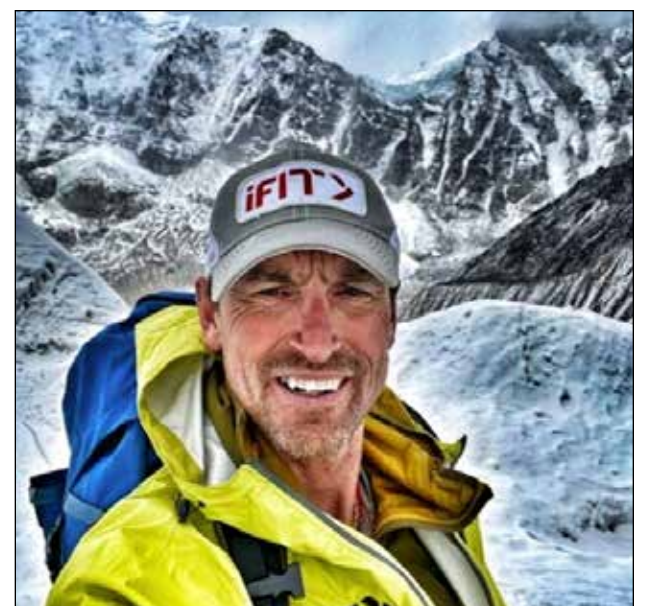
accident in 1996. He needed a year of surgery and therapy and still has chronic pain.