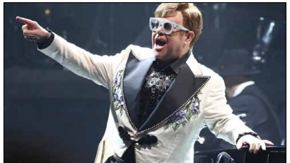
ROYAL PERFORMANCE: Elton John and (below) Queen+Adam Lambert will perform at Buckingham Palace on June 4th