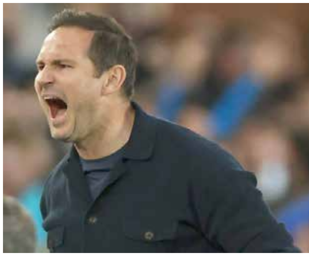
LAMPARD: emotional scenes on the touchline