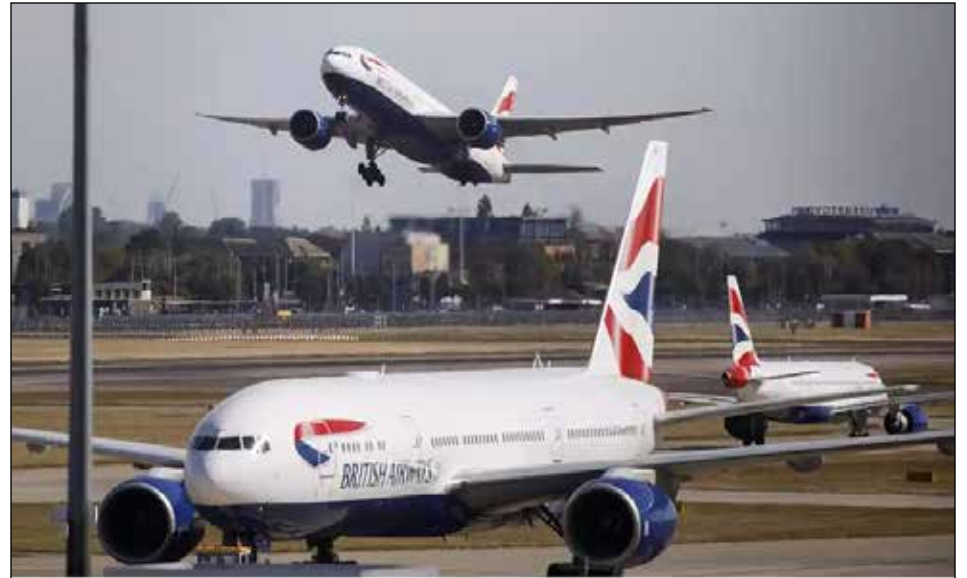
CLEAR SKIES? BA has agreed a deal that sources say in effect restores the 10% pay cut introduced during the pandemic