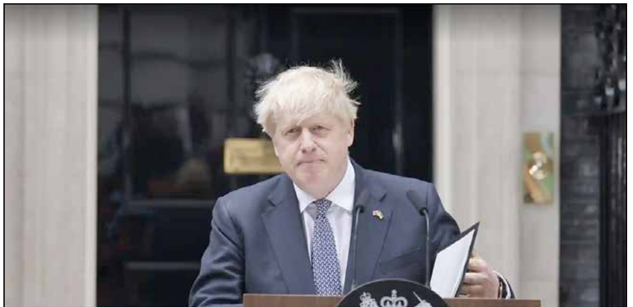
THE NARCISSIST IN NO.10: Johnson’s goodbye speech contained not one iota of regret or apology

His resignation will kick off a leadership contest over the coming months, in which Rishi