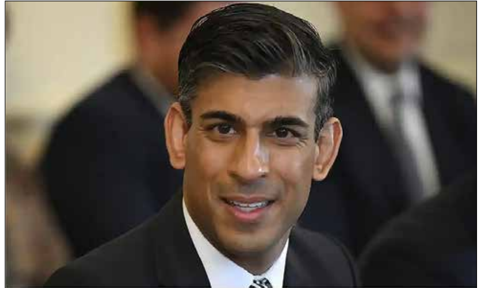
SETTING THE PACE: former Chancellor Sajid Javid (above) enjoys plenty of support among the party's grass roots, as does Liz Truss (below)

However, amid a torrent of resignations over the past 48 hours, her decision to remain as international trade minister has raised eyebrows. In an apparent move to deflect criticism, Mordaunt broke her silence on Thursday morning to tweet that