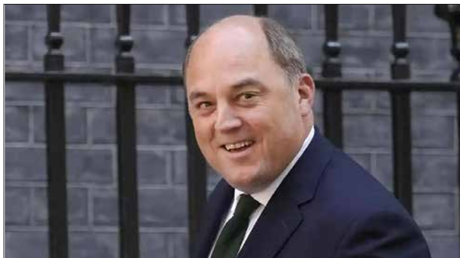
FRONTRUNNER: Defence Secretary Ben Wallace

at the weekend by ConservativeHome put her as the second choice, just behind Wallace. cont. on page 4, col. 1