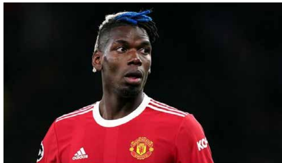
POGBA: not so great the second time round

United offered him an extension and BBC Sport understands it was a more lucrative offer than his previous deal but in an Amazon Prime documentary 'The