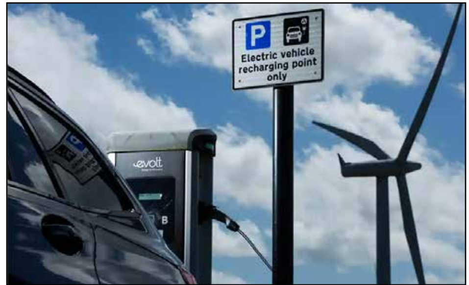
GOOD...YET BAD: The loss of fuel duties as Britain switches to electric cars is likely to blow a hole in the public finances

His ex-adviser turned chief critic, Dominic Cummings, repeatedly accused him of being an out-of-control shopping