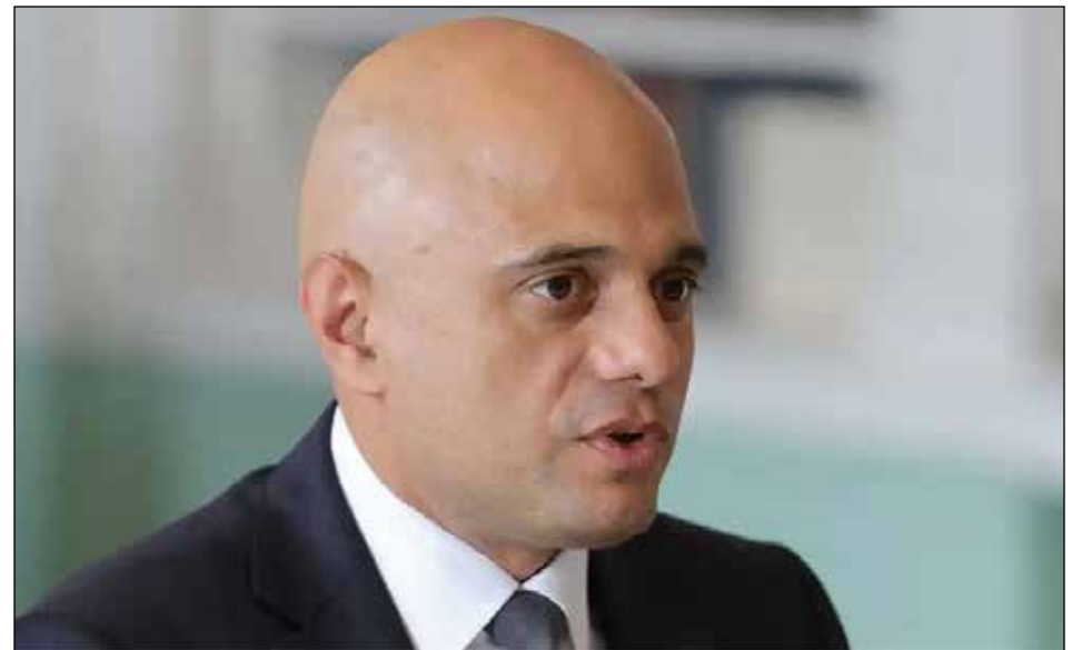
Something was "fundamentally wrong" with government, claimed Javid on Wednesday, adding that "the problem starts at the top".

He added: "I do fear that the reset button can only work so many times. There's only so many times you can turn that machine on