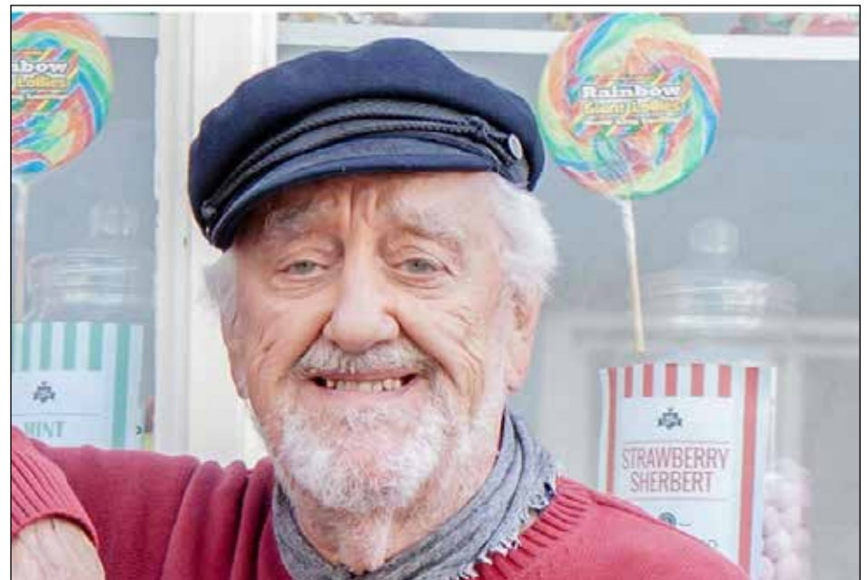
"A BRILLIANTLY TALENTED MAN" : Bernard Cribbins enjoyed a long career, including prominent roles in Dr Who (above) and the Railway Children in 1970 (below, with Sally Thomsett and Jenny Agutter)