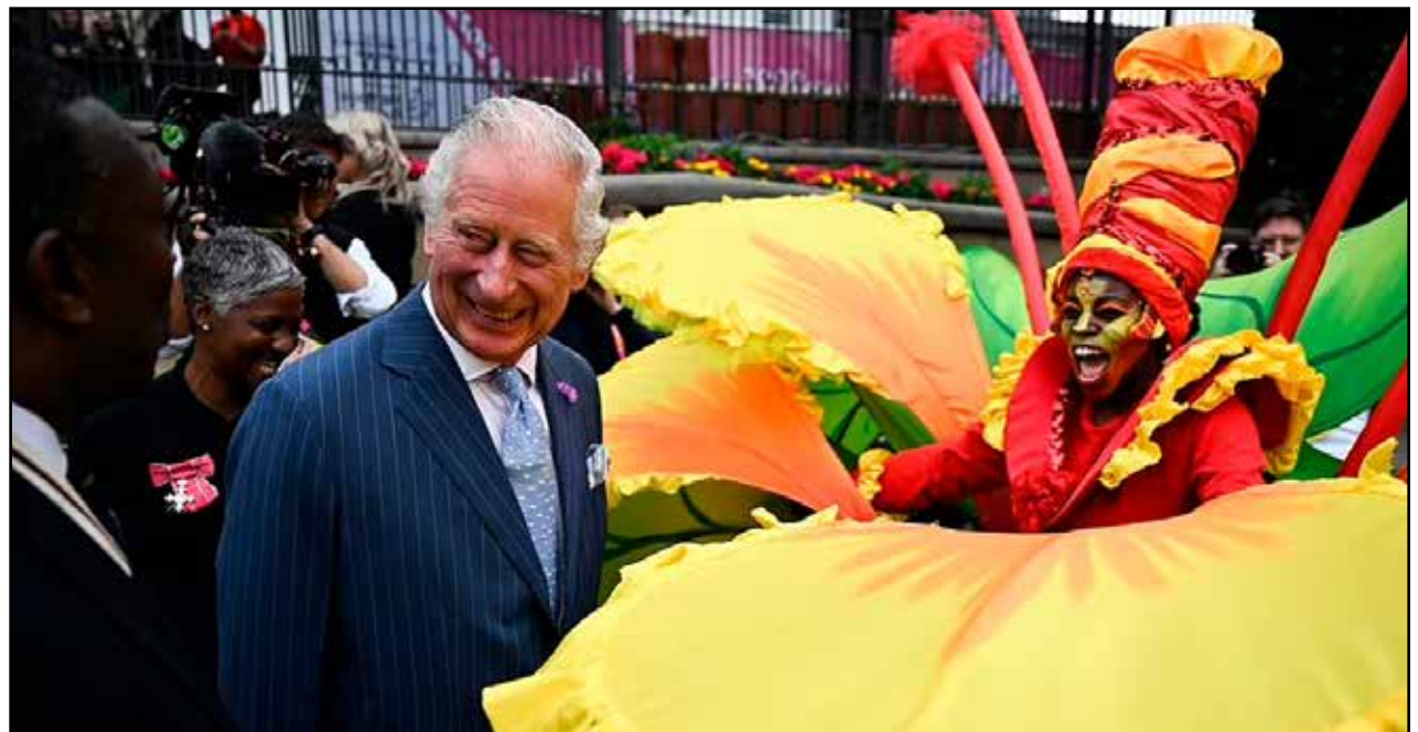
Prince Charles appeared at a celebration in Birmingham's Victoria Square on Thursday ahead of the opening ceremonies at Alexander Stadium

games in Her Majesty's place when they were held in India in 2010 and Australia in 2018.