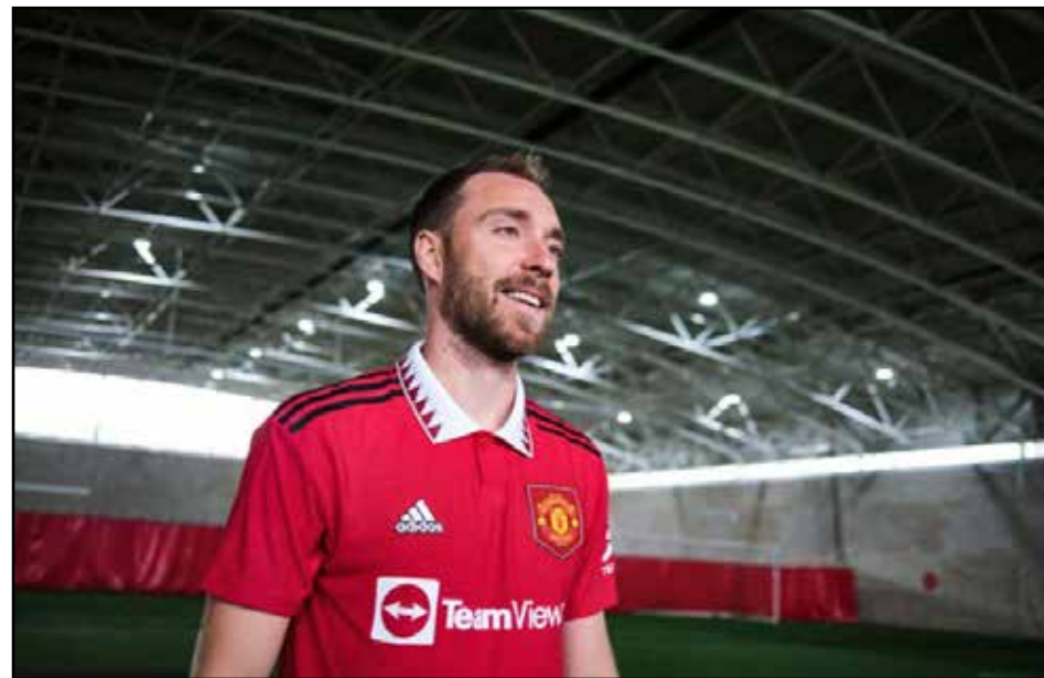
ERIKSEN: "I still have major ambitions in the game."

In addition, his former club Tottenham were interested in re-signing him this summer.