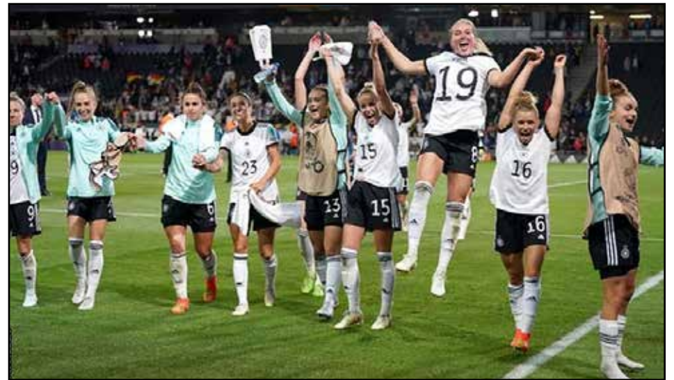
FORMIDABLE OPPONENTS: Germany will be aiming to win their ninth European title when they meet England on Sunday

The Lionesses have not been beaten since Sarina Wiegman took over in September. That undefeated run includes beating Germany on home soil for the first