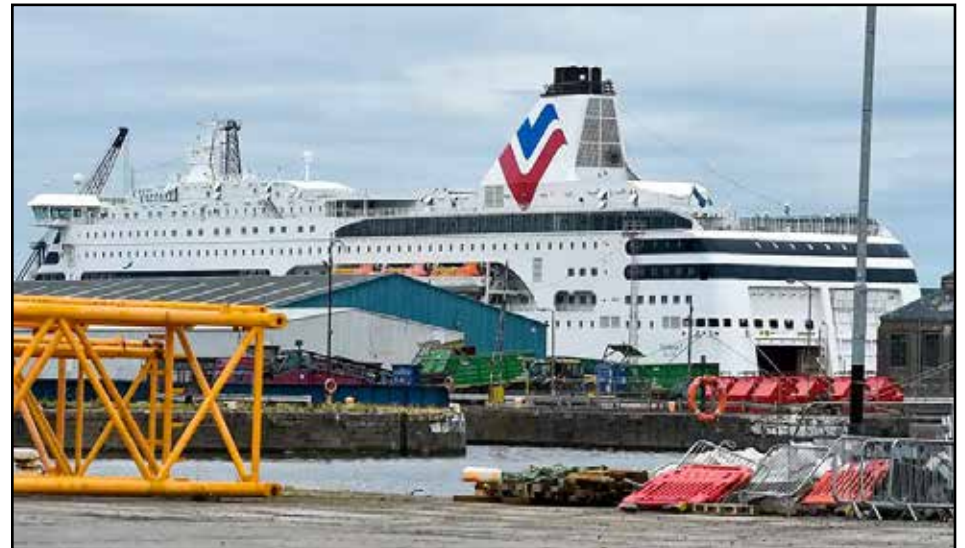
MS Victoria: welfare groups are alarmed about the suitability of such accommodation