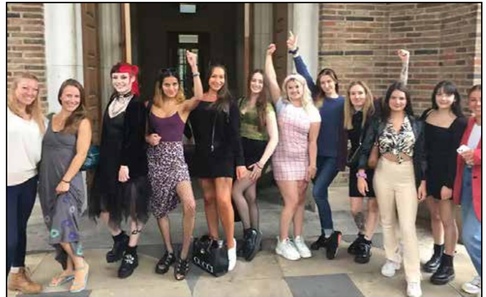
LAP OF HONOR: dancers celebrate on the steps of Bristol City Hall this week