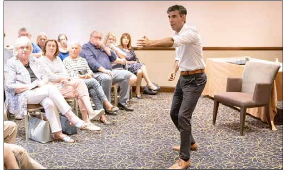
ON THE HUSTINGS: Rishi Sunak makes his case to Tory members in Leeds

Chief secretary to the Treasury and Truss-