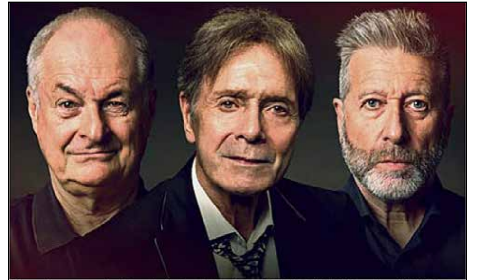
Wrongly accused...from left, Paul Gambaccini, Sir Cliff Richard and Neil Fox