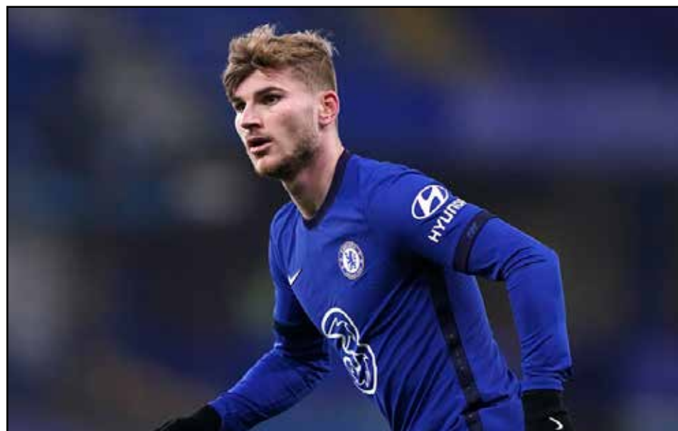
AUF WIEDERSEHEN: Werner impressed nobody during his Premier League stint

But the Blues blocked his departure and they are yet to