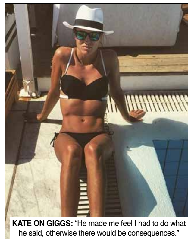
KATE ON GIGGS: "He made me feel I had to do what he said, otherwise there would be consequences."