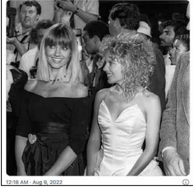
12:18 AM - Aug 9, 2022

Kylie Minogue @kylieminogue · Follow Since I was ten years old, I have loved and looked up to Olivia Newton John. And, I always will. (Just like this picture @nfsaonline) She was, and always will be, an inspiration to me in so many, many ways. My deepest condolences to her family and loved ones. x ONJ4EVER