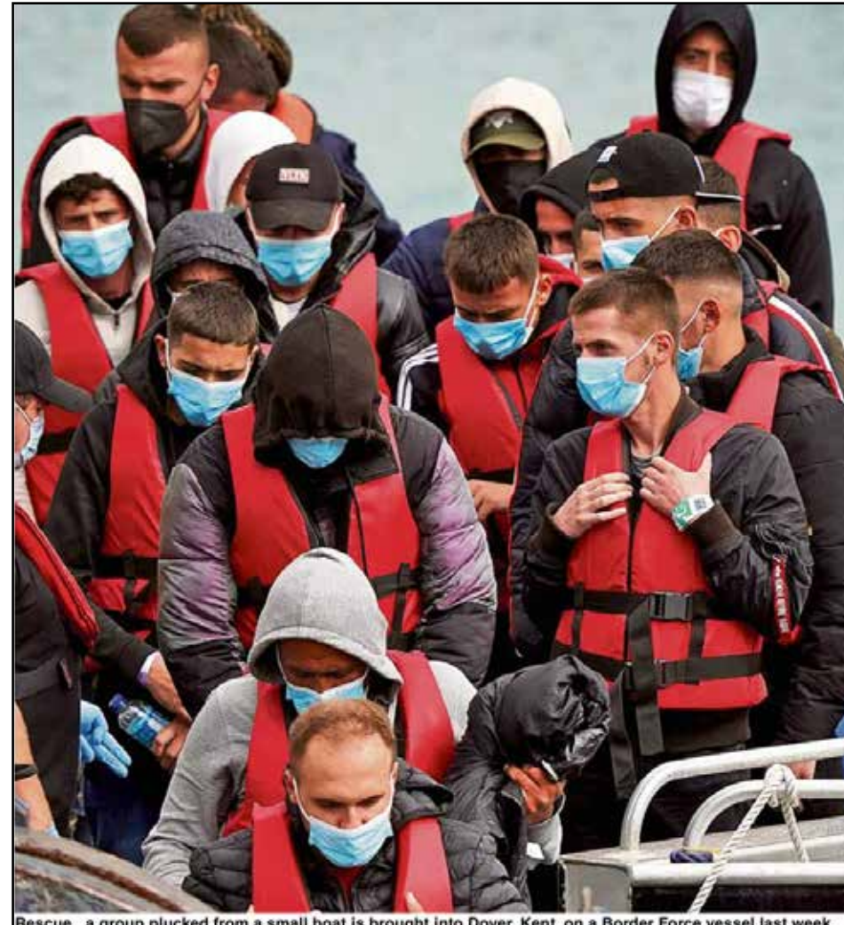
Rescue...a group plucked from a small boat is brought into Dover, Kent, on a Border Force vessel last week

to provide police with "valuable intelligence while shutting down the smugglers' lines of communication". A TikTok spokesman said: "We do not allow content that depicts or promotes people-smuggling... and have permanently banned these accounts. Nearly 400 crossed the Channel by small boat on Monday, bringing the total this month to more than 2,000 so far. According to one report this week, six out of ten of all migrants are Albanian.