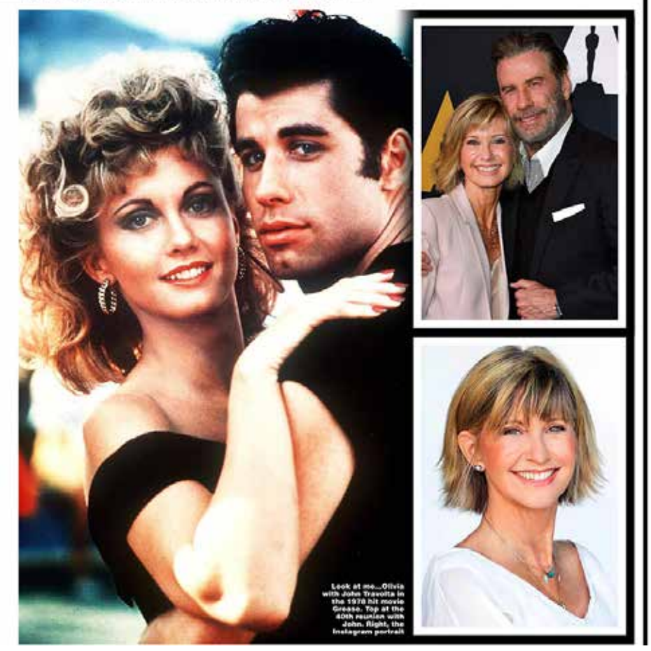
DAME OLIVIA NEWTON-JOHN: 1948-2022

selling Have You Never Been Mellow in 1975.