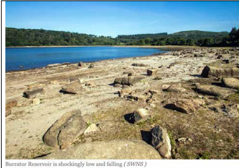
Burrator Reservoir is shockingly low and falling

And on Tuesday, as the country woke up to the news of her death,