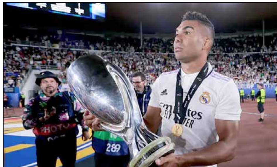
SERIAL WINNER: Personal terms were expected to be discussed with the Brazilian player on Friday

The board have more irons in the fire as United look to kickstart their ailing campaign, with PSV winger Gakpo, a player suggested by Ten Hag, still on their shortlist. United could also try and revive a