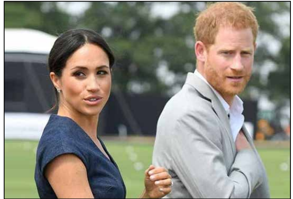
MEGHAN AND HARRY: set for a visit to Britain in September

The book is expected to reopen wounds over the Sussexes' claim of racism inside the Royal Family and allegations that Meghan bullied palace staff.