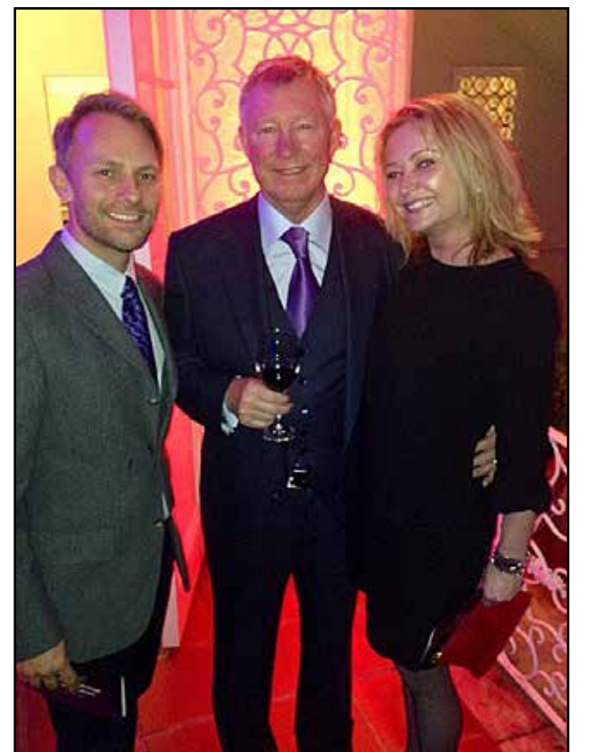
The pair with a certain famous football manager