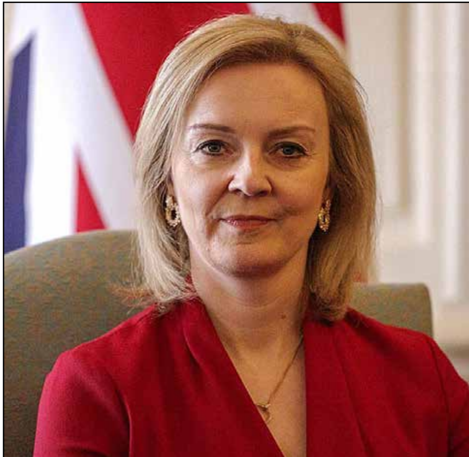
"A child of the Union": Truss promised to deliver for all corners of the country