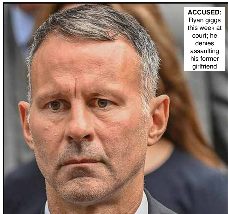
ACCUSED: Ryan Giggs this week at court; he denies assaulting his former girlfriend