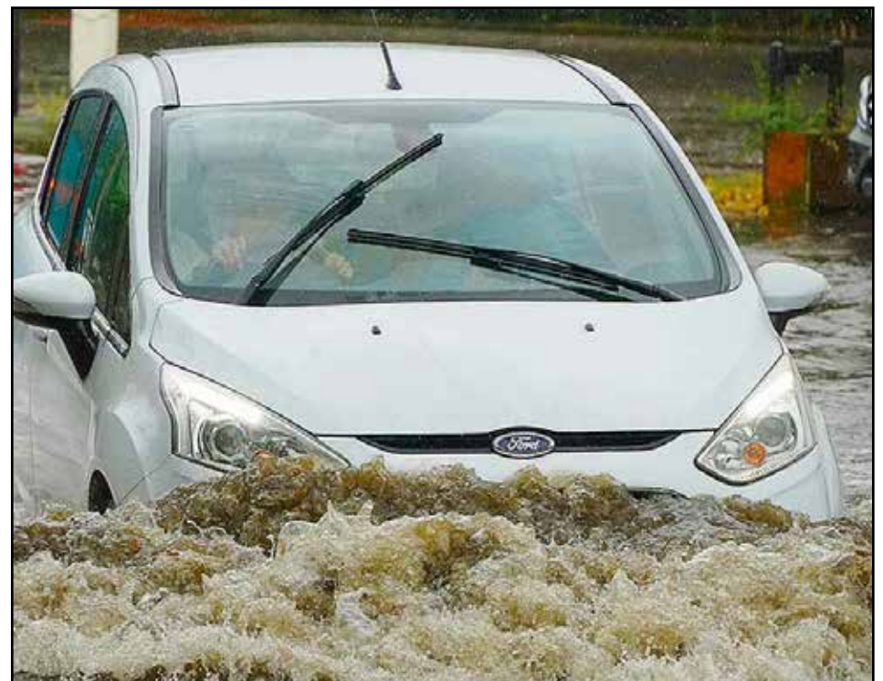
WAVE ON: a car battles through the waters in Market Rasen, Lincolnshire

Defra said it may introduce further measures in the coming