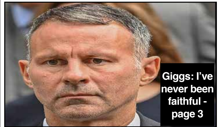
Giggs: I've never been faithful - page 3

California's British Accent™ - Since 1984