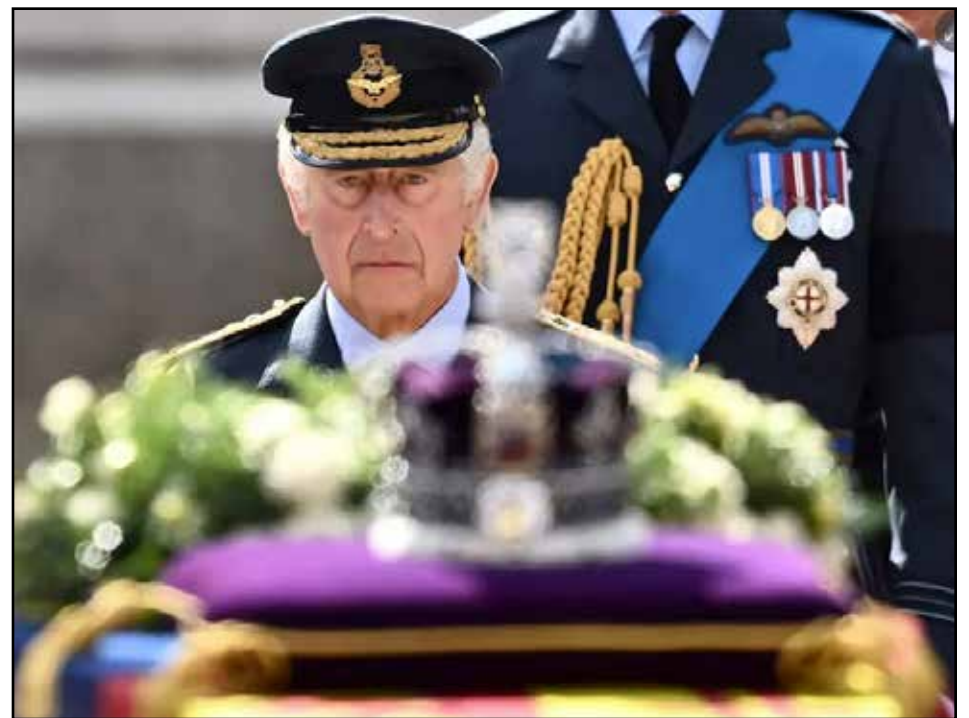
DUTIFUL SON: "She set an example of selfless duty which, with God's help and your counsels, I am resolved faithfully to follow."

Minutes earlier, the King's Body Guard of the Yeomen of the Guard, dressed in their distinctive Tudor uniforms of red, white and yellow, and the Honourable Corps of Gentlemen at Arms, wearing helmets with white swan feather plumes, slow marched to the steps of the Great Hall to stand in watch over the monarch. MPs and peers were seated under the medieval timbered roof, with Prime Minister Liz Truss and Leader of the Opposition Sir Keir Starmer, along with former premiers Boris Johnson and Theresa May in the crowd.