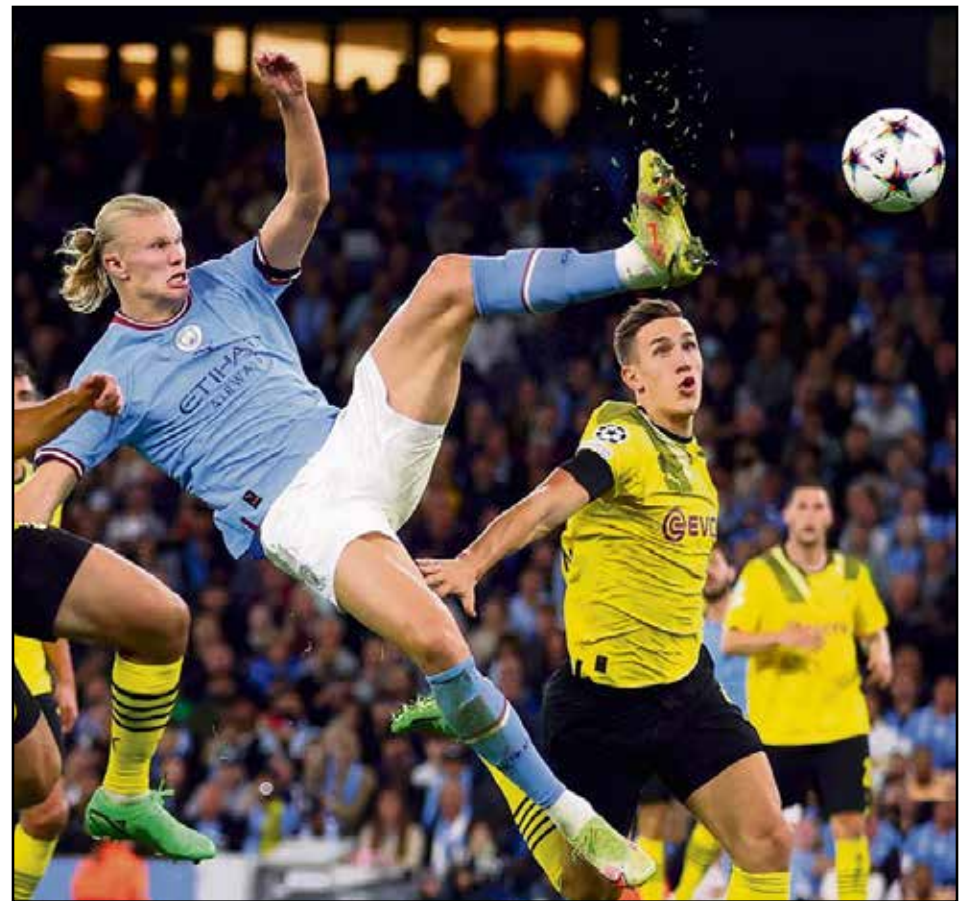
WHO CAN STOP HIM?: not even his former teammates on Wednesday night

It means City now have a maximum return from two games and a striker every team in the competition will fear.