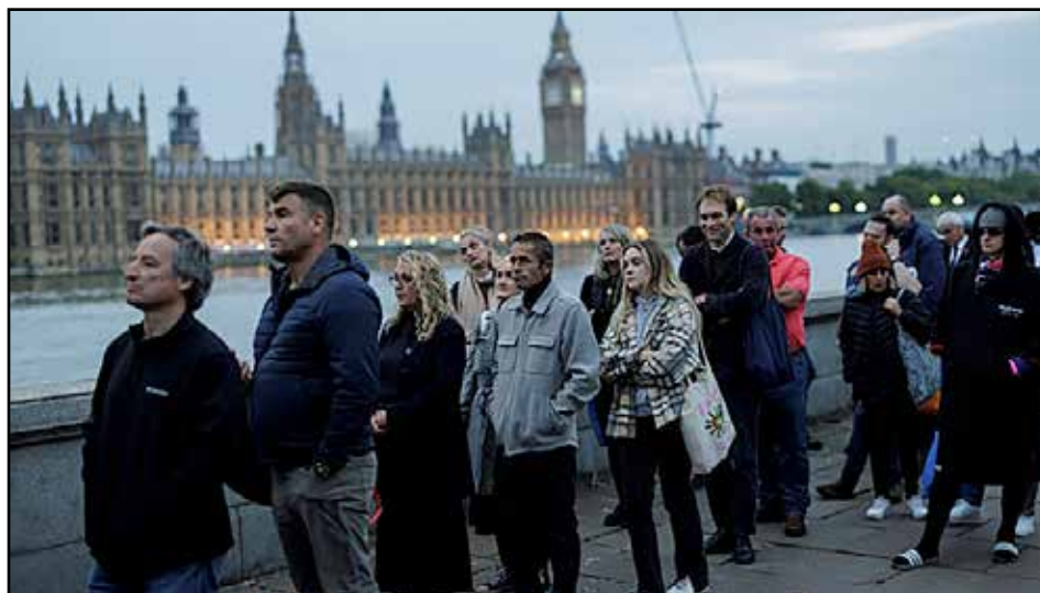
PATIENCE: the queue stretches almost five miles from its beginnings at Southwark Park on the South Bank, west and north to Westminster Hall

Standing room on the route reached capacity more than 40 minutes before the parade left and the roads were closed off.