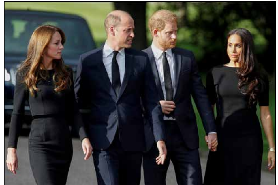
RELATIONS, STRAINED: the royal princes put aside their differences this week

The call with Mr Drakeford came a day after William offered an olive branch to the Duke and Duchess of Sussex by inviting them to join him and Kate on a walkabout at Windsor Castle to see flowers left in memory of the Queen and to speak