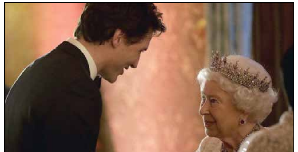
HE'LL BE THERE: Justin Trudeau with Her Majesty. Last week the Canadian prime minister described her as 'one of my favorite people in the world'