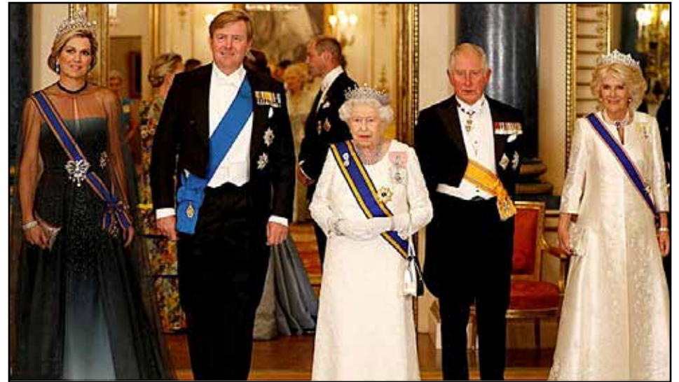
ALL IN THE FAMILY: King Willem-Alexander and Queen Maxima of the Netherlands are confirmed for the funeral

King Felipe and Queen Letizia of Spain have also accepted an invitation, as have the royal families of Norway, Sweden,