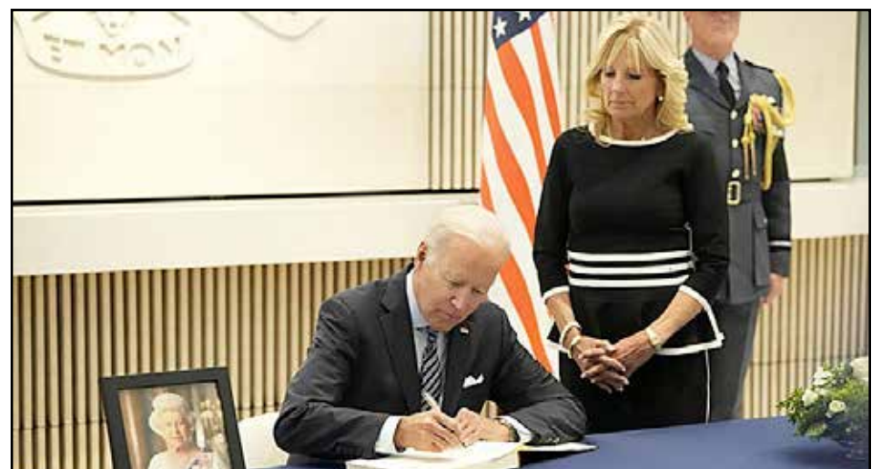
President Biden and the First Lady Jill Biden signed the Book of Condolences at The British Embassy in Washington this week