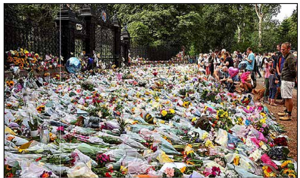
SEA OF FLOWERS: the scene outside the gates of Sandringham this week