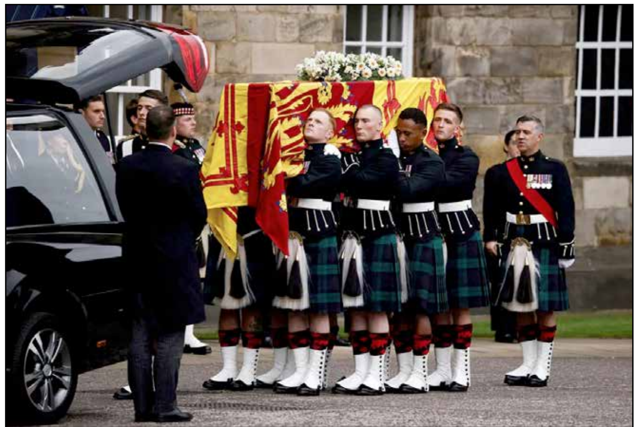
SOLEMN FAREWELL: unloading the royal casket at Holyrood house

Away from the pomp of public life, the royal retreat was famously known as Her Majesty's happy place. It was on the grounds of the