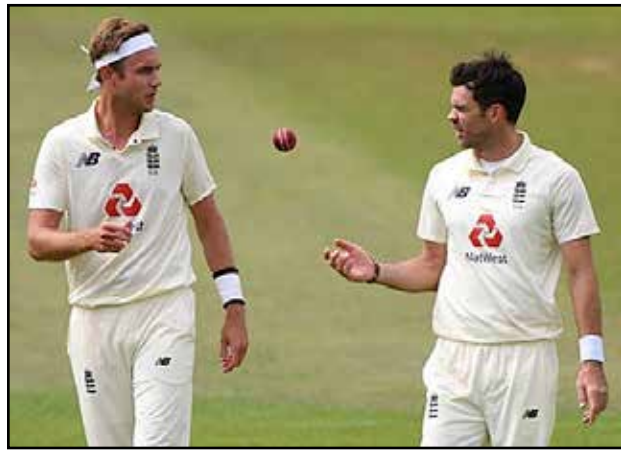
On the plane: England's record-breaking bowlers Stuart Broad and James Anderson are confirmed for the Ashes series