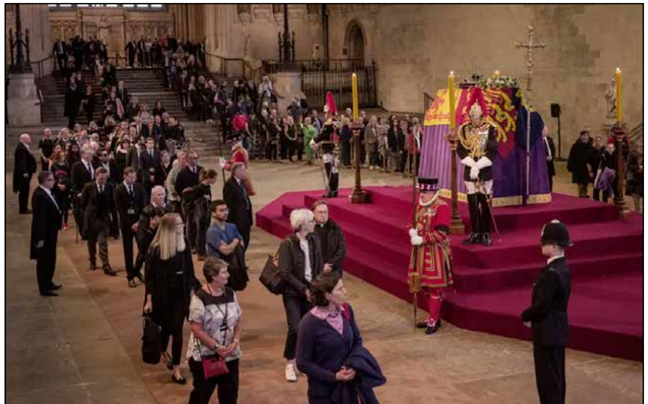
PURPLE PATCH: the Queen will lie in state in Westminster Hall until her funeral on Monday

In a reverential hush they descended the steps of the 11th-century hall to pay their last respects to the Queen, many still wearing the yellow wristbands that marked their place in the queue.