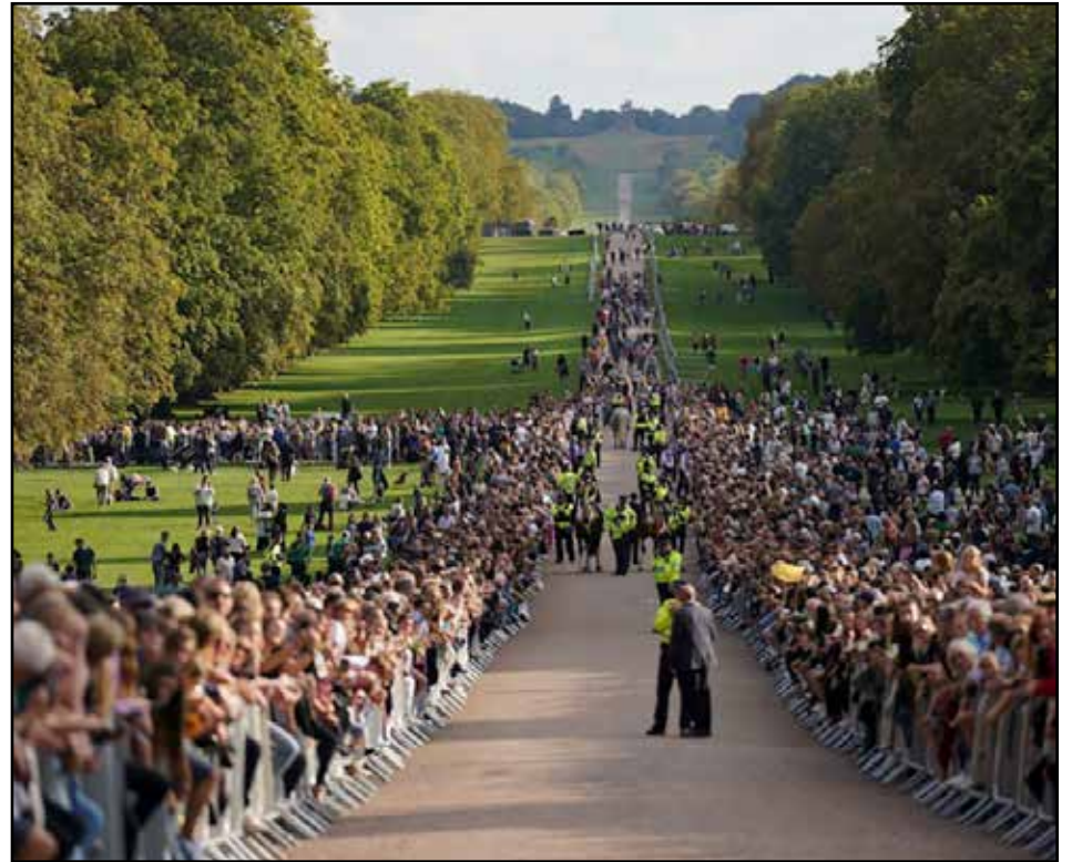
The famed Long Walk in Windsor was thronged with visitors this week

"I was born in the old King's reign, but she was my Queen for virtually all my life. I left a message on my flowers saying, 'You had this Majesty about you, but you could walk among all of us'."