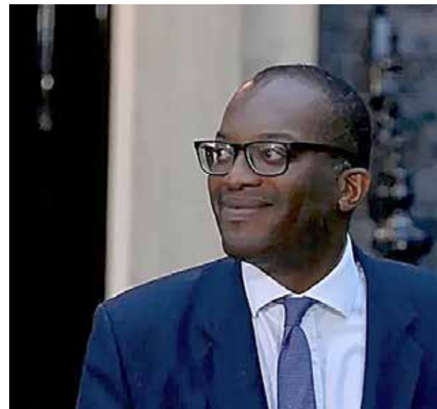
IN AT THE DEEP END; Kwasi Kwarteng

One of the main elements of the package – the £13bn reversal of