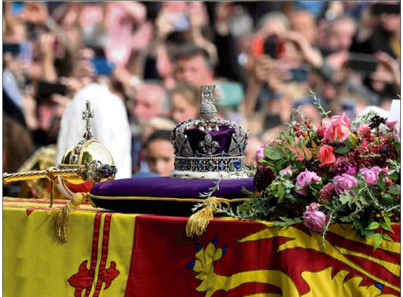
THERE SHE GOES: The Imperial State Crown rests atop the Queen's casket en route to the Abbey

Throughout her reign, the late Queen had a strong Christian faith, which she