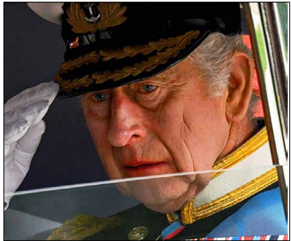
TEARFUL GOODBYE: Charles couldn't hide his feelings after Monday's service

He and Camilla had been planning an autumn visit to Asia until the death of the Queen.