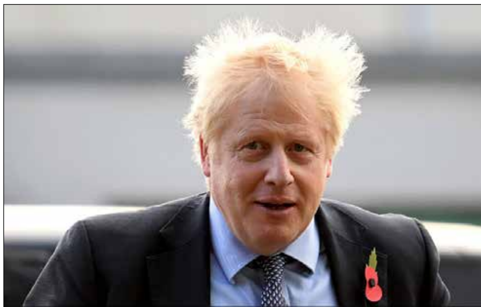
NOT AGAIN? Boris Johnson still enjoys strong support among the Tory old guard, and has not ruled out running to replace Truss

Despite his opposition to Brexit, Mr Wallace has been a key supporter of Boris Johnson and was rewarded with a cabinet post in 2019.