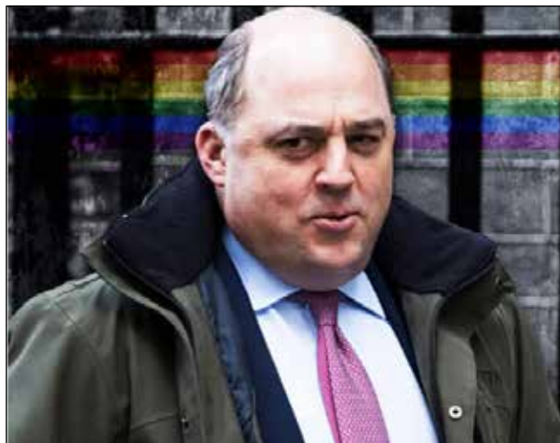
Ben Wallace is considered a safe pair of hands by a large faction of the Conservative Party

During the campaign he warned that his rival's tax plans would damage the economy, but his message failed to appeal