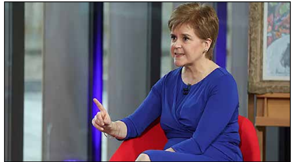
NICOLA STURGEON: "There are no words to describe this utter shambles adequately. It's beyond hyperbole - and parody."

"Scotland's votes don't determine the outcome of UK general elections," she said.