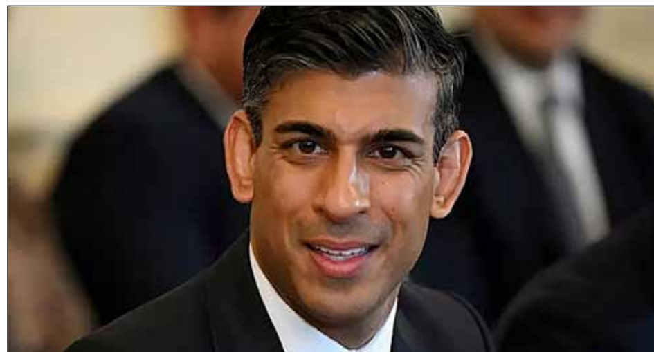
VINDICATED: former Chancellor Rishi Sunak described Liz Truss's economic policies as 'pure fantasy' during their contest to replace Boris Johnson