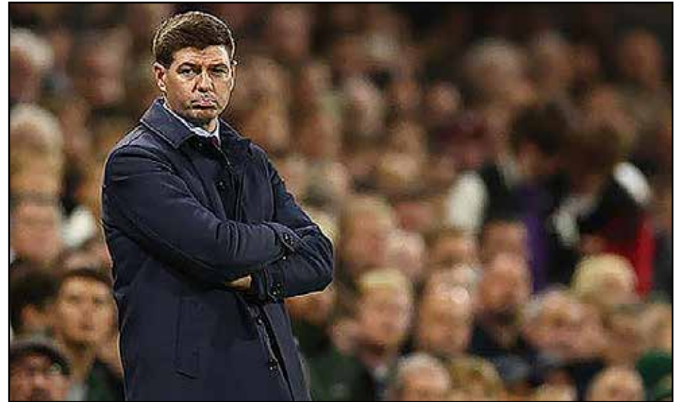
Gerrard: the former Liverpool legend led Villa to only 13 wins from his 40 games