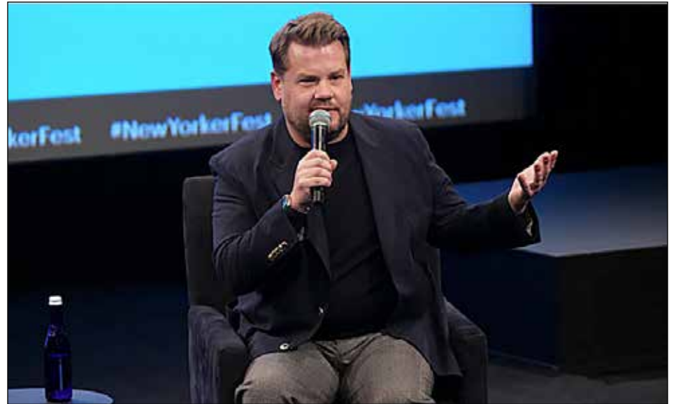
NO COMMENT: for once, James Corden is staying silent...