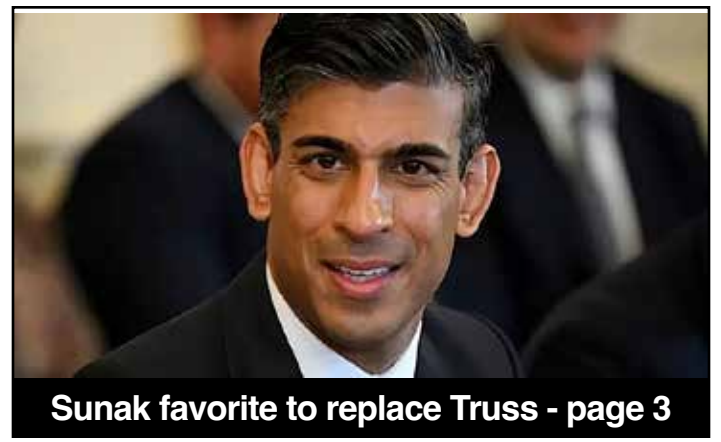
Sunak favorite to replace Truss - page 3