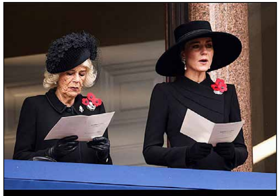
Queen Camilla and Catherine, Princess of Wales, watched from a nearby balcony