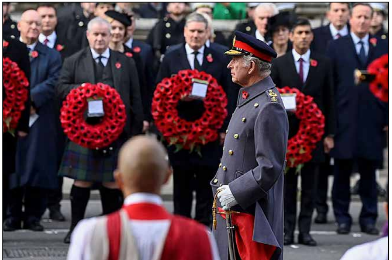
The King, wearing a field marshal's uniform, laid his wreath and saluted

The late Queen was the last member of the Royal Family to have served in the military in the Second World War but the connection with that greatest generation was not lost on Sunday. Around 10 veterans of the 1939-45 war were on