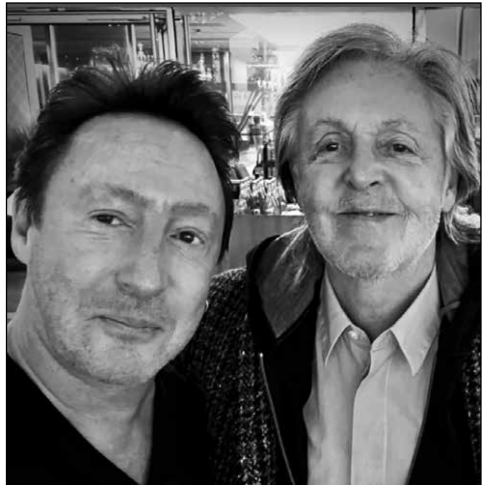
It is named after the Beatles' 1968 hit Hey Jude, written by Sir Paul McCartney for Julian after his mum originally as Hey Jules Cynthia and John split.