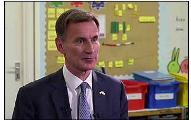
“I’m not pretending these aren’t going to be difficult times, but there’s a plan.....” - Jeremy Hunt

“We need to be sensible about the way we do this. We