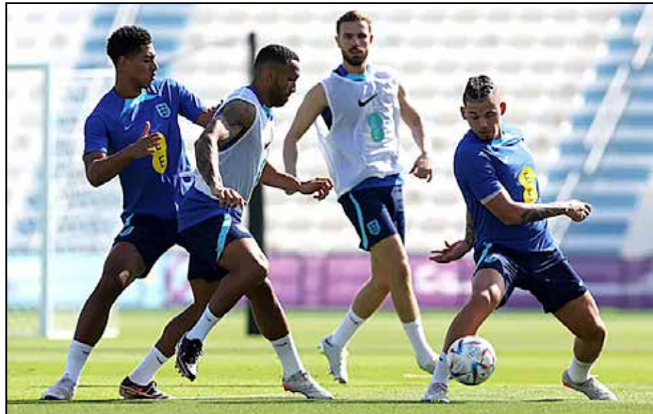
Easy does it: England players in training at the Al Wakrah Sports Complex

But while the players were training, the wives and girlfriends had it