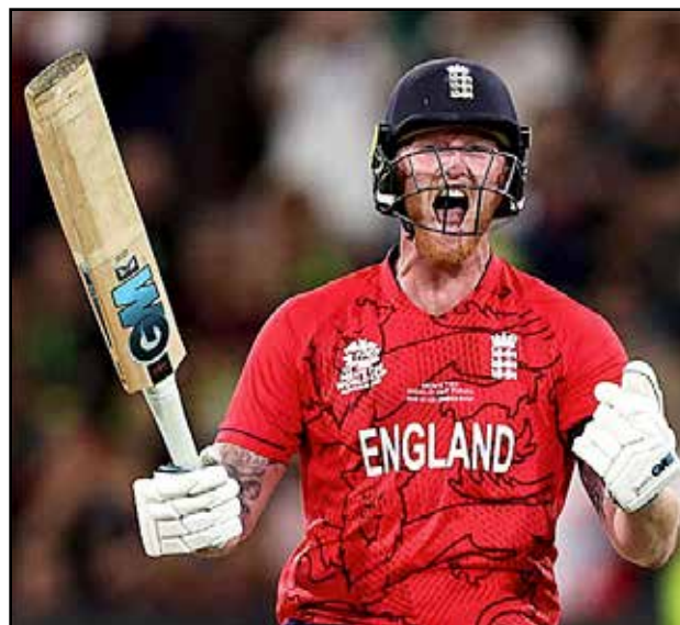
England's Ben Stokes celebrates after winning the T20 World Cup final against Pakistan in Melbourne on Sunday

It had looked like it might turn into another disappointing weekend