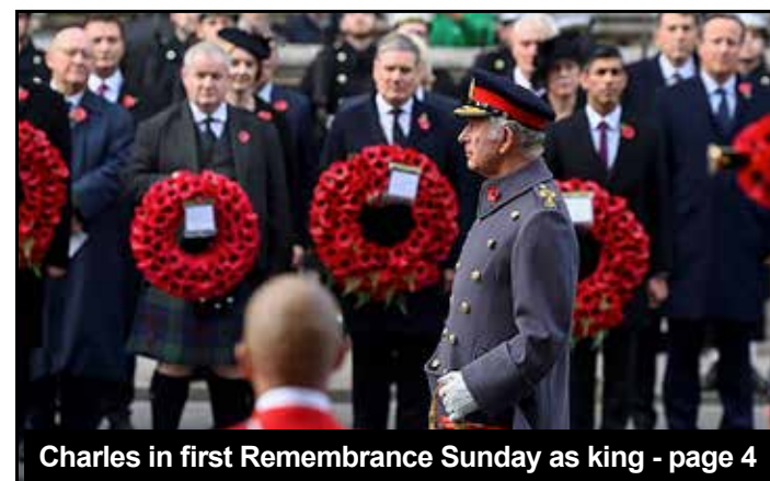
Charles in first Remembrance Sunday as king - page 4