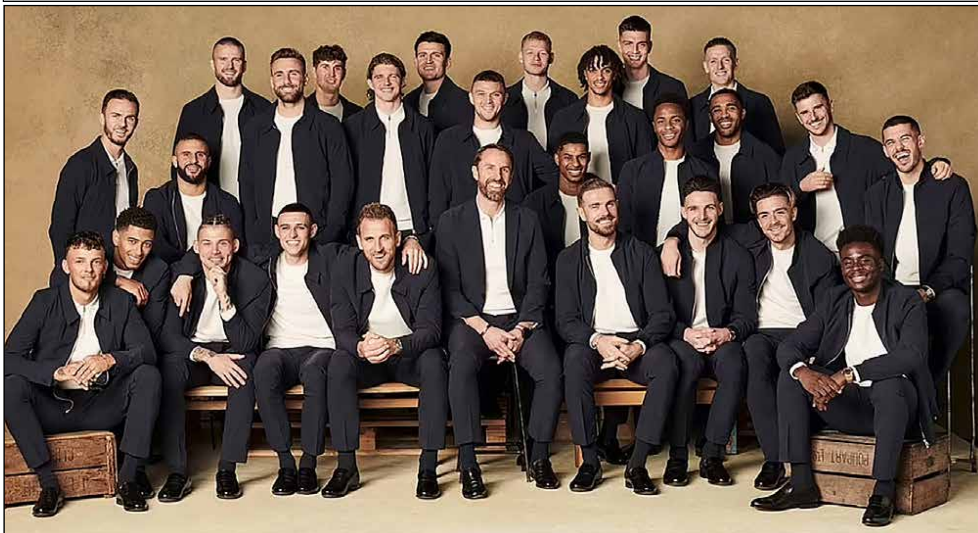
SUITED AND BOOTED: England's football team poses in their best M&S outfits ahead of flying out to Qatar this week