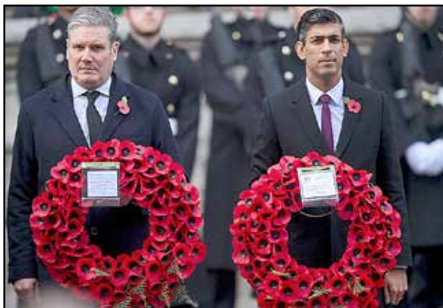
Sir Kier Starmer and Rishi Sunak also attended

He added: "What we do is stop people from being able to perpetrate evil in the way that they were doing it."