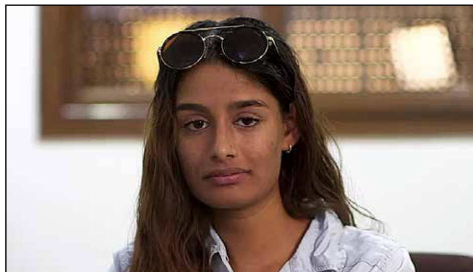
A former MI6 officer described the UK's treatment of Begum as "fundamentally misguided"