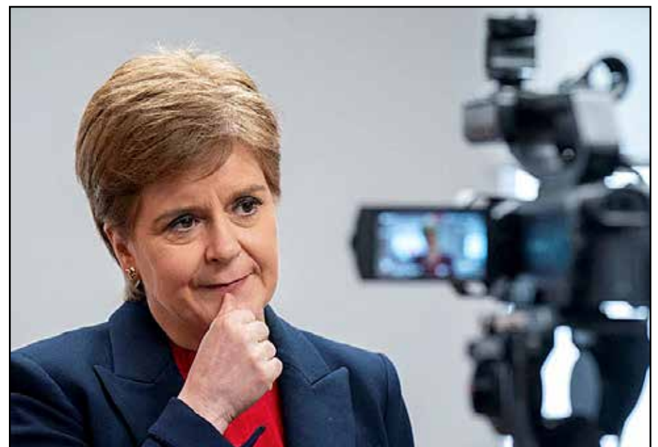
"We must and we will find another democratic, lawful and constitutional means by which the Scottish people can express their will....." - Nicola Sturgeon

Delivering the unequivocal judgment, the supreme court president, Robert Reed, said the effects of legislation were "not restricted to legal consequences but can include its practical consequences". The outcome of a referendum would "possess the authority ... of a democratic expression of