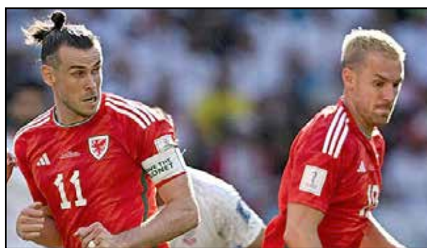
Gareth Bale and Aaron Ramsey have almost 200 caps between them for Wales

Bale, the nation's captain, all-time leading scorer in men's football