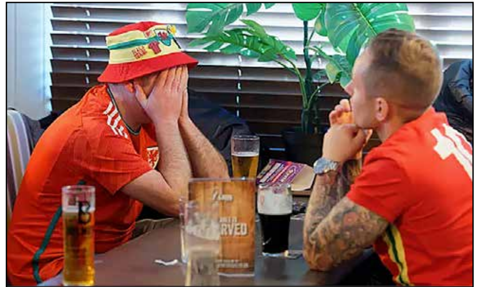
LAMENTATION IN THE VALLEYS: Welsh fans at the Lion pub in Treorchy (above and below) lay their emotions bare as their heroes lost to Iran, 2-0 on Friday

Treorchy certainly threw itself behind the Wales team on Friday, the high street a blaze of red. The Welsh clothing and gift shop opened early to sell last-minute clothes and flags. "You can't watch the game without a bucket hat. It's the law," said one