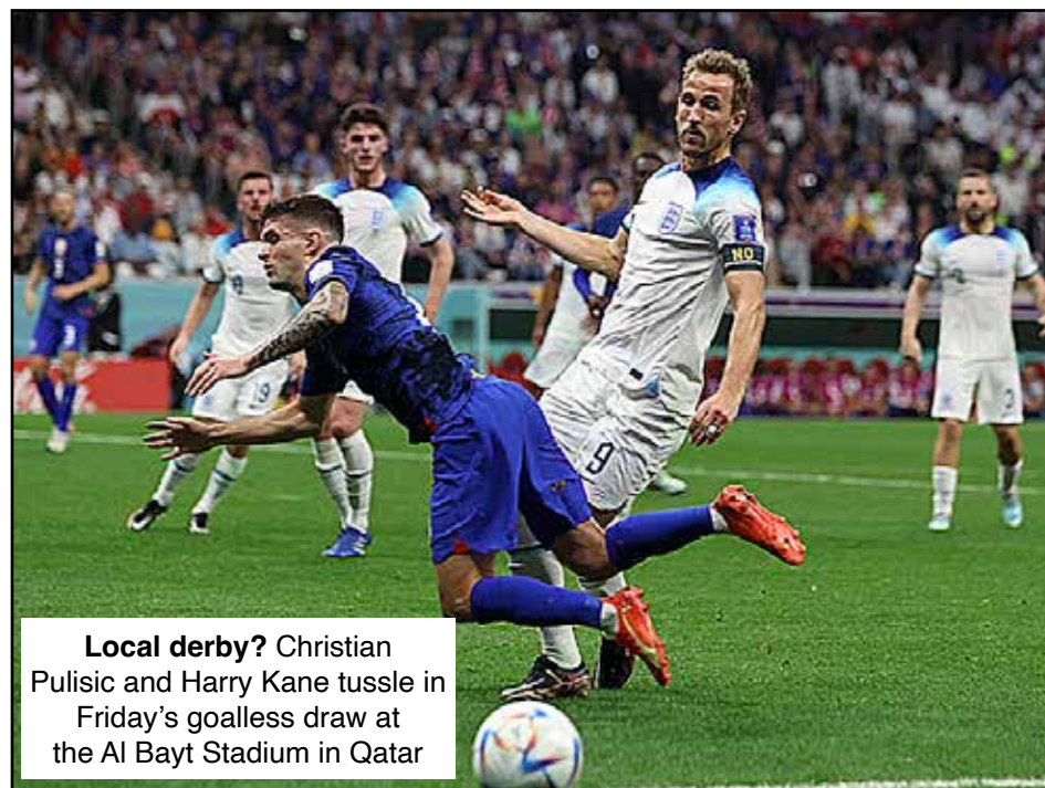
Local derby? Christian Pulisic and Harry Kane tussle in Friday's goalless draw at the Al Bayt Stadium in Qatar

Southgate's decision to cont. on page 19 col. 3