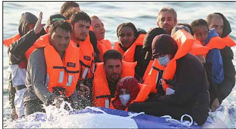
ANOTHER BREXIT? one senior politician warned that growing public unease over immigration numbers could spark a political revolution

"My priority remains tackling the rise in dangerous and illegal crossings and stopping