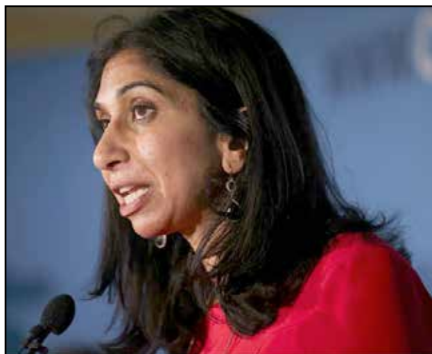
BRAVERMAN: "My priority remains tackling the rise in dangerous and illegal crossings and stopping the abuse of our system."

Shadow Home Secretary Yvette Cooper acknowledged factors behind the total but said that there was "real evidence of Tory mismanagement".