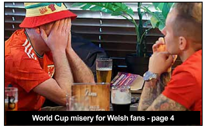
World Cup misery for Welsh fans - page 4