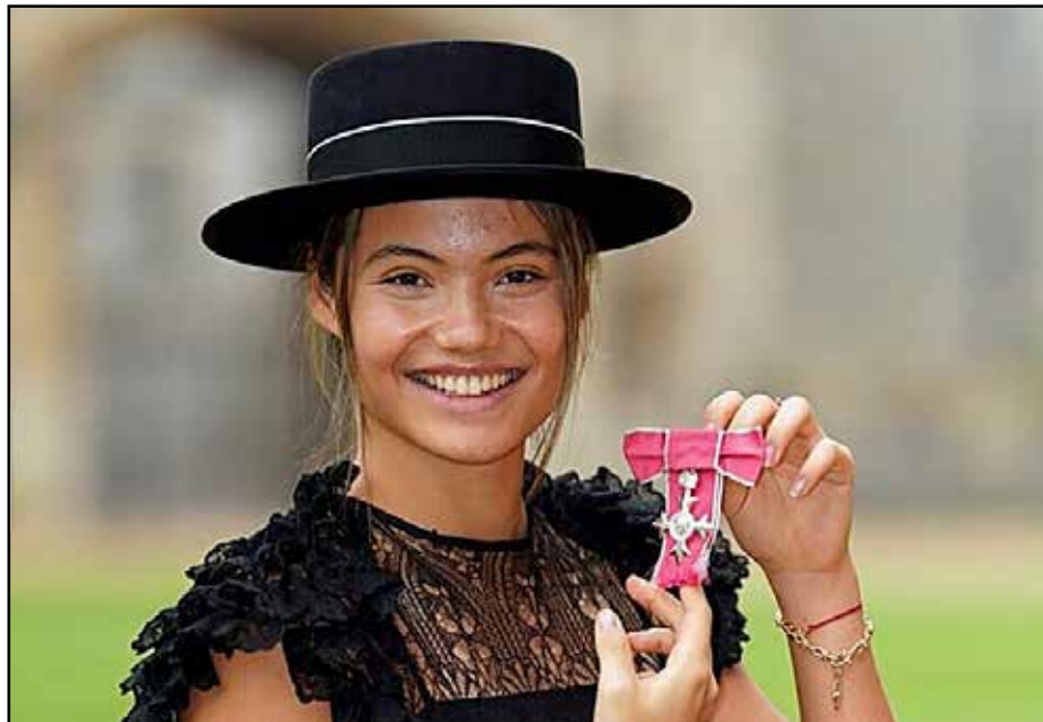
Emma Raducanu shows off her MBE outside Windsor Castle this week