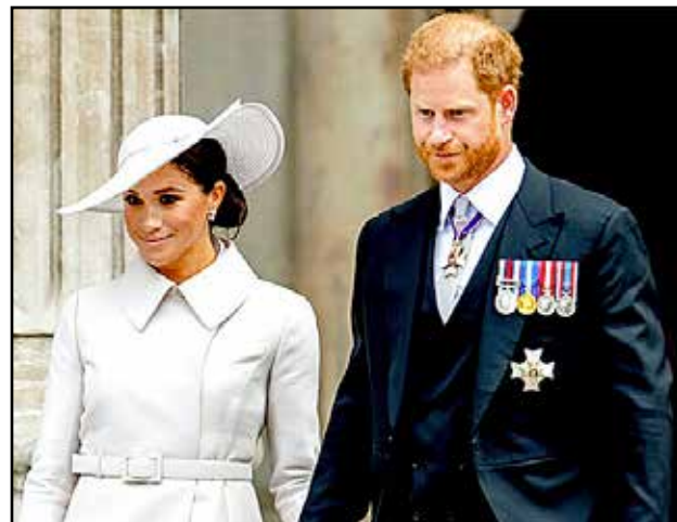
Harry and Meghan: the pair were targeted by British right wing extremists following their wedding

The Home Office said: "We are actively pushing for a cultural change in the police, including via a targeted review of police dismissals to ensure officers who are not fit to serve can be swiftly removed."