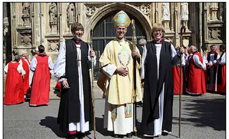
OUT OF FASHION: the Bishops of Gloucester and Crediton, flanking the Archbishop of Canterbury

Some 9.3 per cent called themselves Asian British, up from 7.5 per cent, while 2.5 per cent identified as Black, Black British, Black Welsh, Caribbean-African