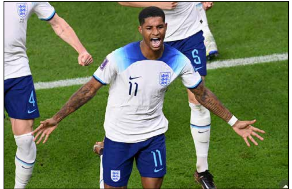
A RASH OF GOALS: Marcus Rashford scored twice for England on Tuesday

when talisman captain Gareth Bale, now 33, was replaced by the youngster Brennan Johnson. Just minutes later,