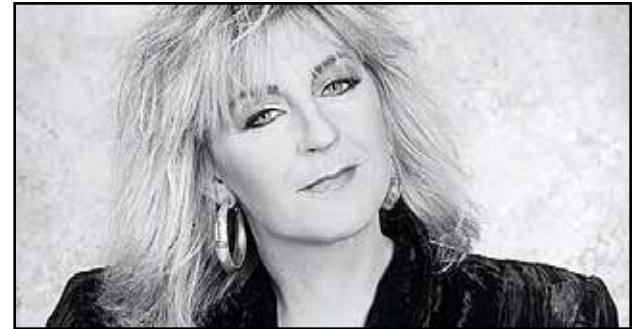
McVie: the rock icon was born Christine Perfect in 1943 in the Lake District

She took a hiatus from the band in 1998. "I just wanted to embrace being in the English countryside and not have to troop around on the road," she said to the Guardian.