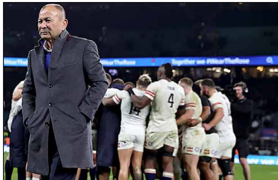
ON THE OUTSIDE? I've got a plan for how England can win it, but it doesn't go in a perfect line," Eddie Jones told reporters following the weekend loss

Jones said on Saturday night: "I don't really