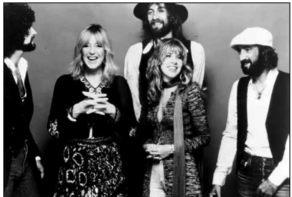
ROCK ROYALTY: Lindsey Buckingham, Christine McVie, Mick Fleetwood, Stevie Nicks and John McVie, pictured at the band's peak in 1977