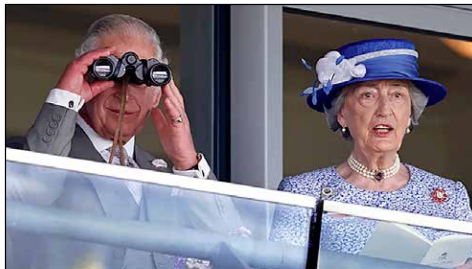
Lady Susan Hussey at Royal Ascot with then Prince Charles

The chief executive said the Sistah Space charity she set up was based in