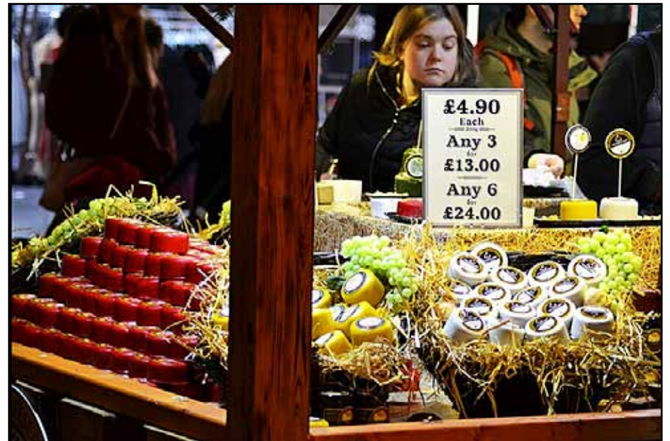
Come and buy: a stall at Bristol's famed Christmas market

The Christmas Markets are one of Britain's fondest traditions, perfect for holiday shopping and exploring some of the UK's loveliest cities. Offering twinkling lights, mulled wine and more,