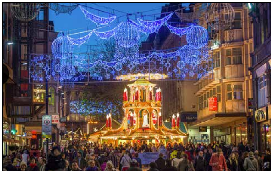
A TOUCH OF GERMAN: Birmingham's magical Frankfurt Christmas market

When? Thursday 3 November to Friday 23 December 2022.