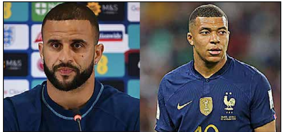
"I understand what I need to do and that is to stop him," Walker, (left) 32 said of French star Kylian Mbappe

On the Frenchman's comments, Walker said: "That's nice to hear because he had a tough game against me. I know