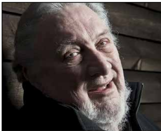
Jet Black: an "elder statesman" of British music