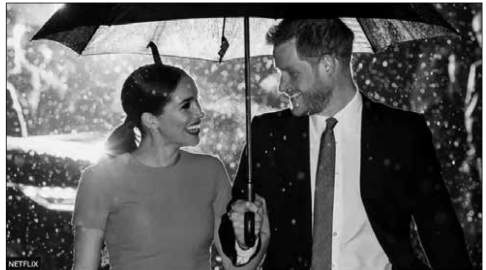
Harry's romance with Meghan seems inextricably linked to his experience of grief.

In terms of news lines, the biggest criticism is against the news writers,