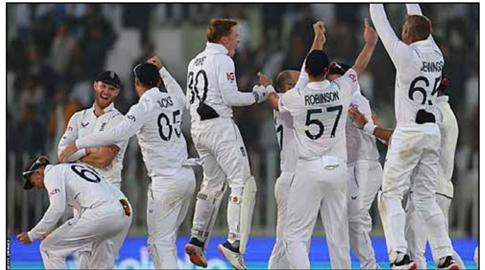
ENGLAND RISING AGAIN: Ben Stokes's swashbuckling team won their first overseas victory against Pakistan for 22 years

England's pressure finally told after tea. Ignoring the availability of the second new ball, Robinson had Salman lbw