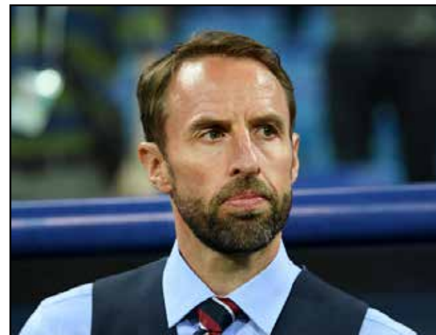
"I have been with England for three years and he has been amazing," Phillips said of Southgate, who has won 49 and lost 13 of his games in charge of England

England have since recovered to reach the World Cup quarter-finals in Qatar, with Southgate earning credit for his tactical decisions that led to a 3-0 win against Senegal in the