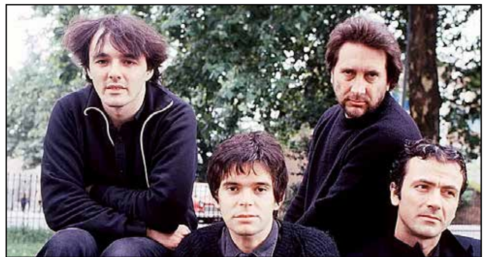
PUNK PIONEERS: (left to right) Dave Greenfield, Jean-Jacques Burnel, Jet Black and Hugh Cornwell of The Stranglers in 1980

remembered by the band's website 12 years ago, Black replied: "I guess if we are actually remembered, then that will do."