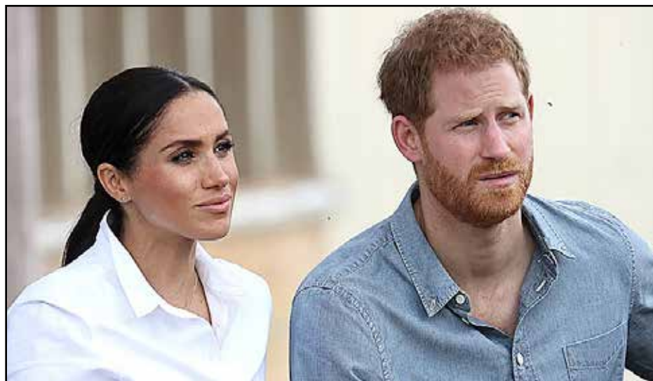
MEGHAN AND HARRY: back on the front pages this week

"I said 'the difference here is the race element'."