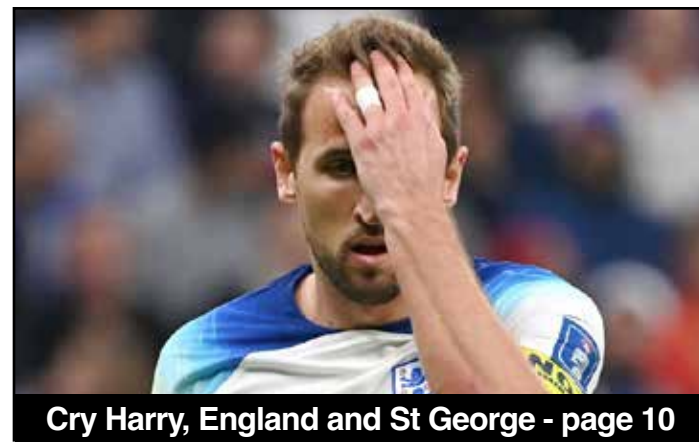
Cry Harry, England and St George - page 10