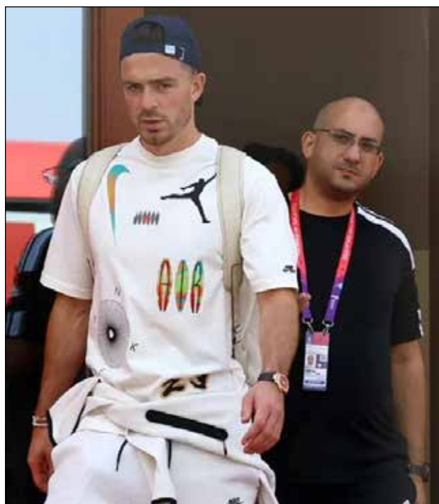
STILL LADDISH: Jack Grealish checks out

Southgate left last with a consoling arm around defender Kieran Trippier's shoulders before boarding a separate coach. However, Bellingham, 19, and one of the tournament's top performers, stopped to sign autographs and pose for selfies.