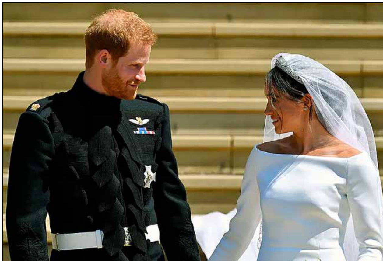
In the fourth episode, Meghan discusses suicidal thoughts that she blamed, in part, on negative headlines

Of her suicidal thoughts, she added: "All of this will stop if I'm not here, and that was the scariest thing about it - it was such clear thinking," Meghan said,