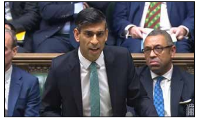
GETTING TOUGH? Rishi Sunak

Mr Sunak told MPs: "No one can doubt our generosity of spirit but far too many of the beneficiaries of that generosity are not those