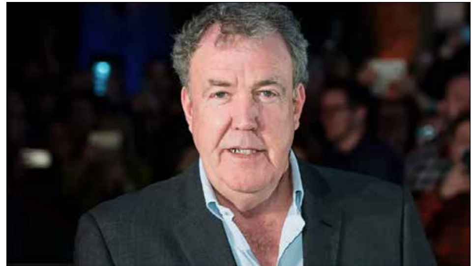
Clarkson wrote on Friday that he "hated [Meghan] on a cellular level"