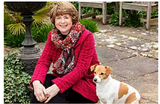
freeze. Pam Ayres 2022

Well, happy Christmas mateys, you can't get on a train, The Border Force is striking, so you can't get on a plane, The nurses on the picket line feel underpaid and wronged, And if you need an ambulance, the wait could be prolonged. No turkey on the table, the blighter's got the flu, Here's a Yuletide sausage, one'll have to do, Let's raise a glass of water, with blankets on our knees, And drink to festive merriment, as we gently