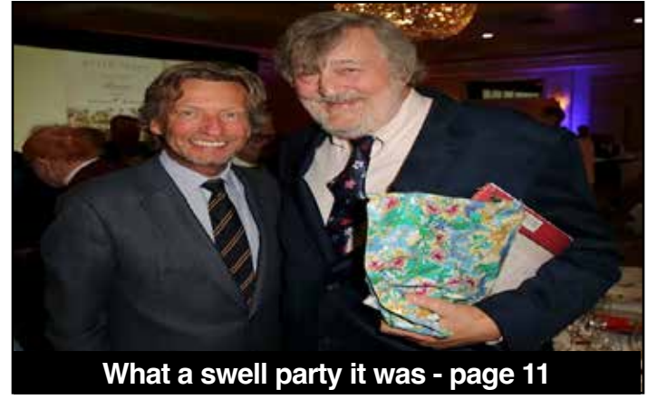
What a swell party it was - page 11