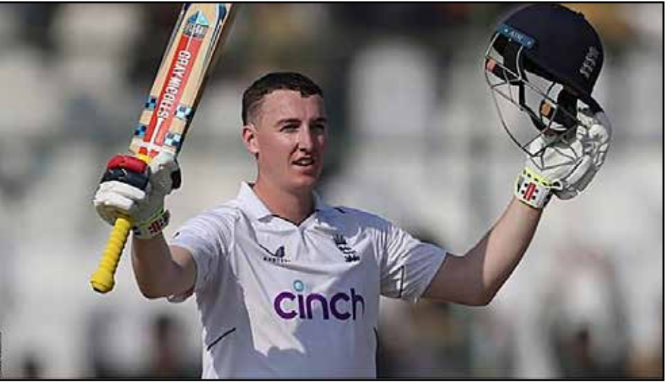
BRIGHT START: England debutante Harry Brook scored a century in each Test

"Every ground has challenged us in different ways," said New Zealander McCullum. "Some challenged us tactically, some challenged us technically and some challenged us mentally."