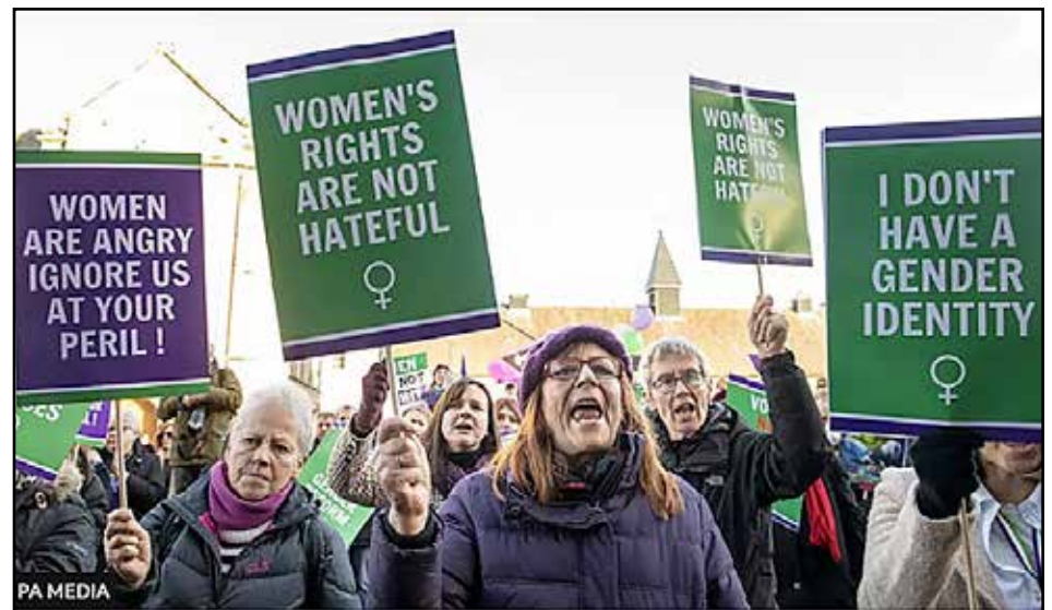
NOT EVERYONE APPROVES: women's rights groups protesting against the bill in Edinburgh this week

Speaking ahead of the vote, Social Justice Secretary Shona Robison said: "Trans rights are not in competition with