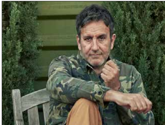
Terry Hall: the singer succumbed to pancreatic cancer

In a separate message, Staple told the BBC he had learned of his friend's passing as he