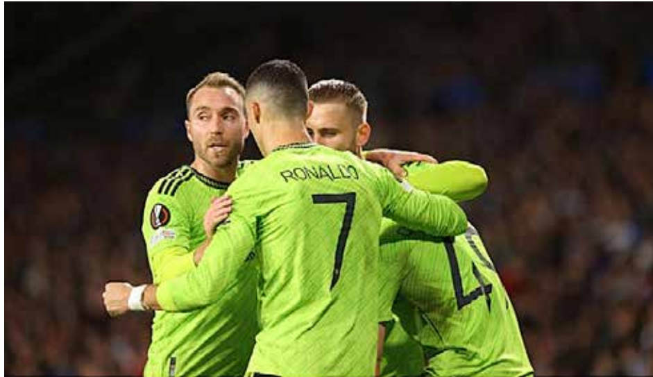
Ronaldo (center) scored 19 Premier League goals in 40 games during his second spell at Old Trafford

"His legacy and his name at any club is special and for me to be fortunate to play with