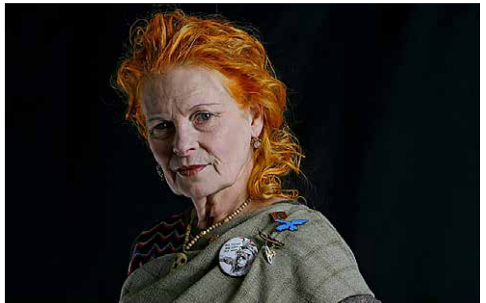
Westwood died on Thursday surrounded by family in Clapham, south London

"Don't extradite Assange - it's a stitch-up," she said, while