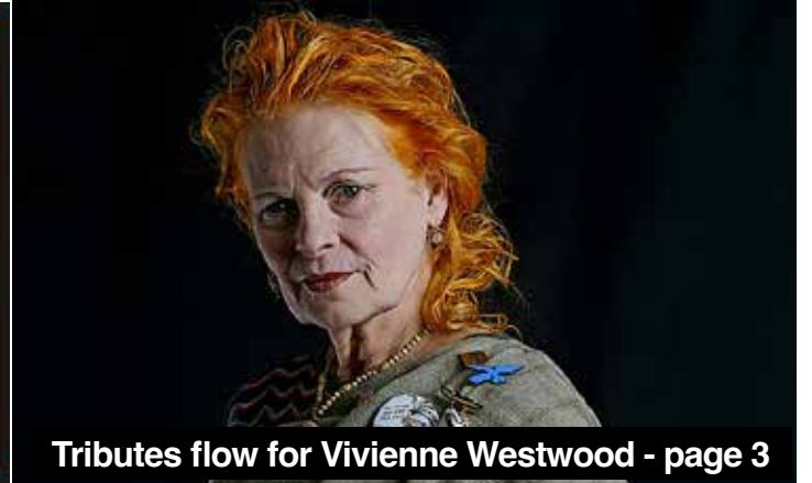
Tributes flow for Vivienne Westwood - page 3

California's British Accent™ - Since 1984