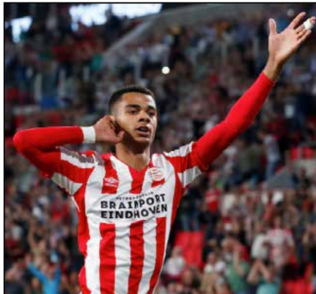
GAKPO: £37m initial fee will take him to Anfield

Gakpo, who scored three goals as he helped Holland reach the