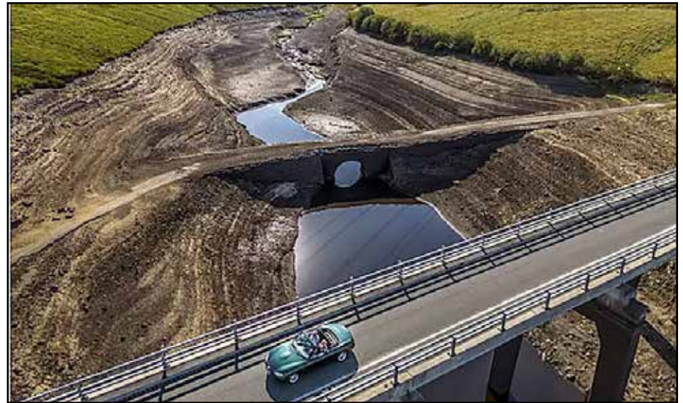
SIGN OF THE TIMES: Baitings Reservoir in Rippenden, West Yorkshire, where water levels reached historic lows in August

The final provisional figure for 2022 will be available at the conclusion of the year and will then be subject