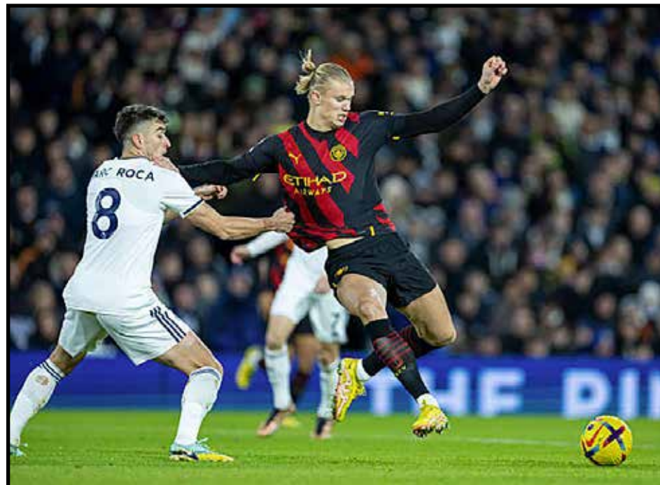
PICKING UP WHERE HE LEFT OFF: Erling Haaland grabbed a brace Wednesday night as Manchester City brushed aside Leeds

goal back with a header minutes left, and had substitute Joe Gelhardt