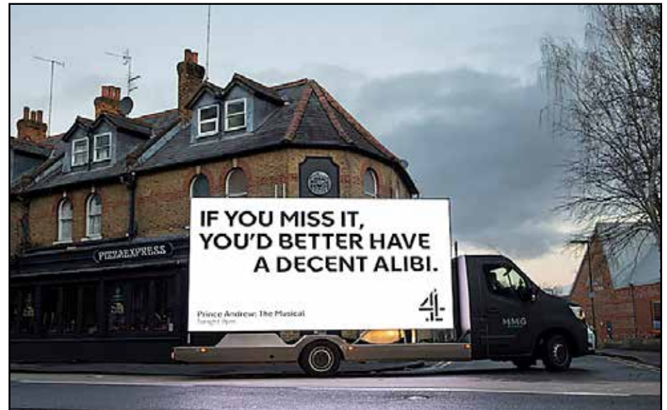
SLICE OF HUMOR: a billboard advertising Channel 4's "Prince Andrew: The Musical", prominently displayed outside a certain Pizza Express..

settled his US sexual assault case out of court, although the agreement was not an admission of guilt from the Duke