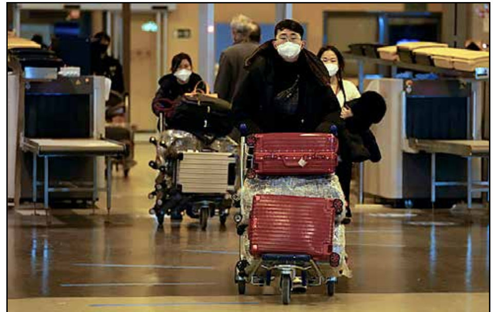
CHINESE FLEW? soaring cases in that country are forcing a UK rethink

But the return of Covid rules is being resisted by Mr Sunak, who has been openly critical of lockdowns since leaving the Treasury and argued that there was not enough consideration of the negative impact on children's well-being and the economy.