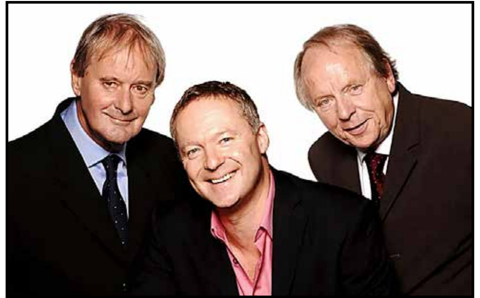
John Fortune, Rory Bremner and John Bird, who starred in the sketch show 'Bremner, Bird and Fortune'

Speaking about his late co-star, Bremner, 61, wrote on Twitter: "It's an irony that one of our greatest satirists, so brilliant at portraying ministers, civil servants or high-ranking officials who exuded self-satisfaction, was himself so modest and self-